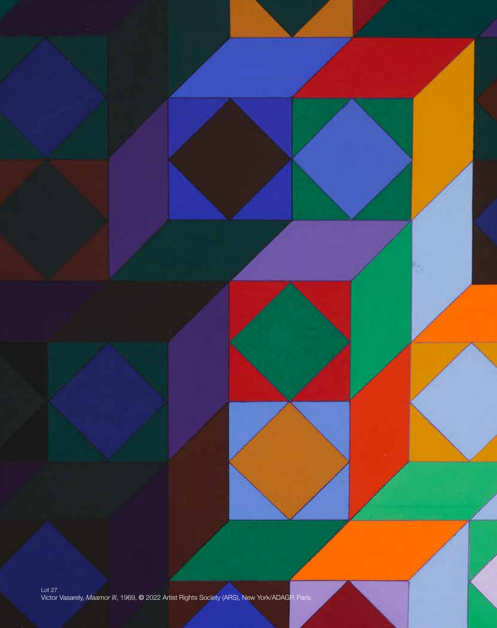
Lot 27 Victor Vasarely, Maamor III , 1969, © 2022 Artist Rights Society (ARS), New York/ADAGP, Paris