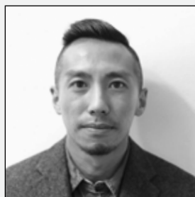
Bill To +44 (0) 20 8963 2822 bill.to@bonhams.com