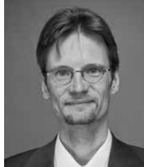
Ming Hua New York