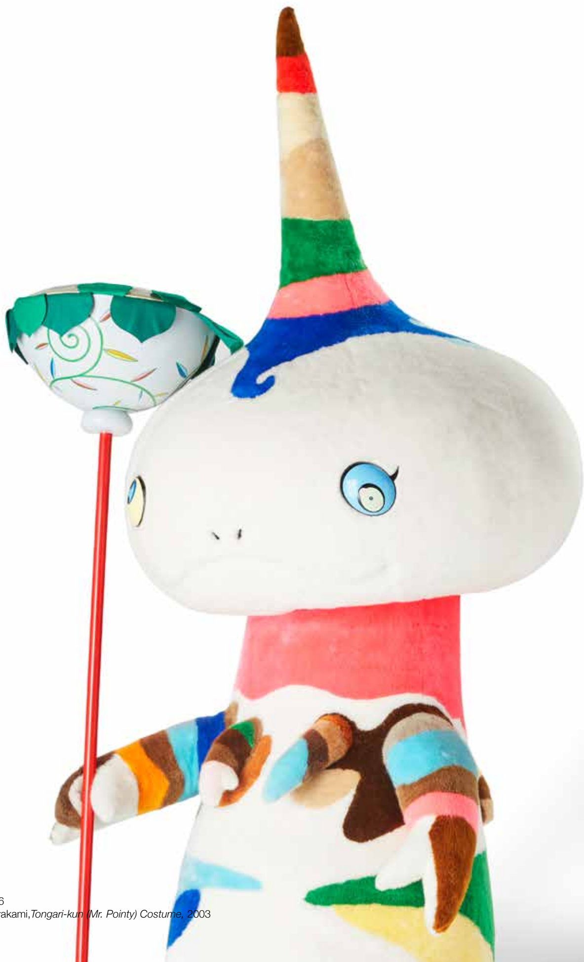
Detail Lot 36 Takashi Murakami, Tongari-kun (Mr. Pointy) Costume , 2003