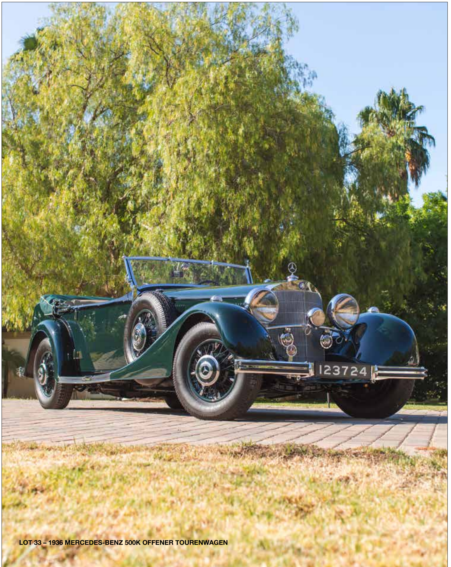
LOT 33 – 1936 MERCEDES-BENZ 500K OFFENER TOURENWAGEN