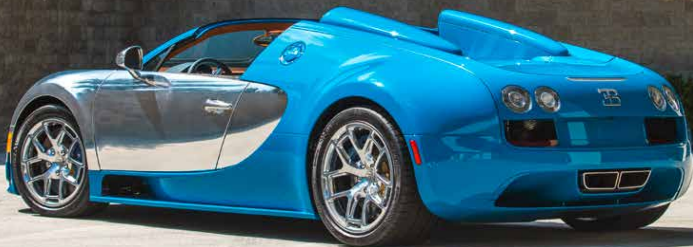
LOT 77 - 2014 BUGATTI VEYRON