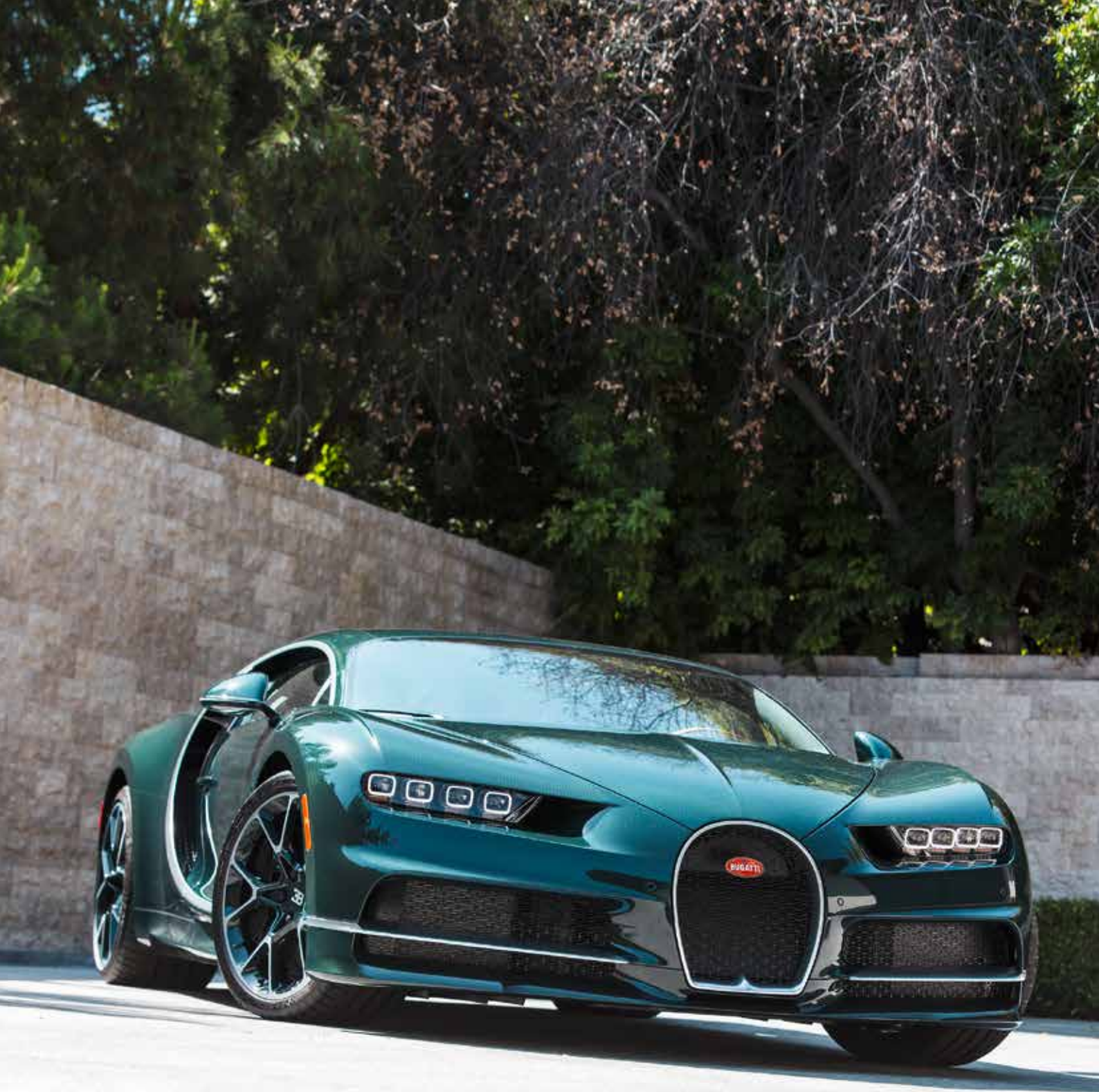
LOT 20 - 2018 BUGATTI CHIRON