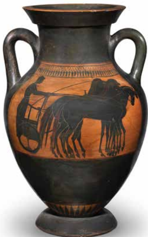
23 (side a)