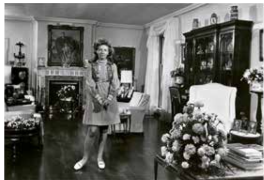
Mary Duke Biddle Trent Semans

Mary Duke Biddle Trent Semans was an American philanthropist, leader, activist and patron of the arts. The granddaughter of Benjamin N. Duke, great niece of James B. Duke and great-granddaughter of Washington Duke, tobacco and energy tycoons who founded Duke University, she created and contributed to innumerable charitable organizations, with a special emphasis on the arts, which was a lifelong passion.