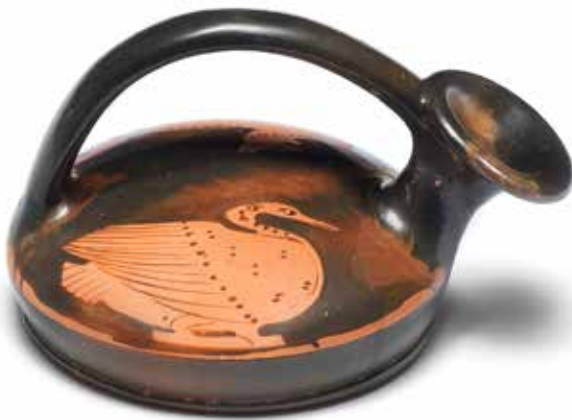
25 (side b)