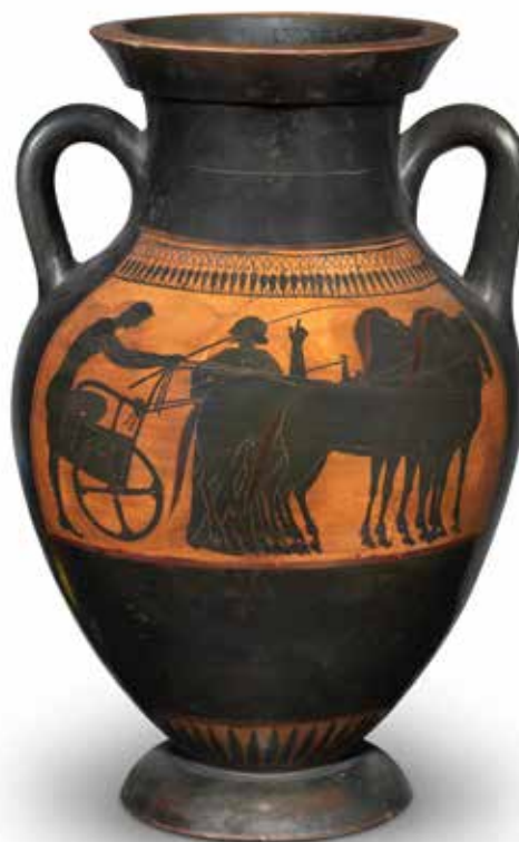
23 (side b)