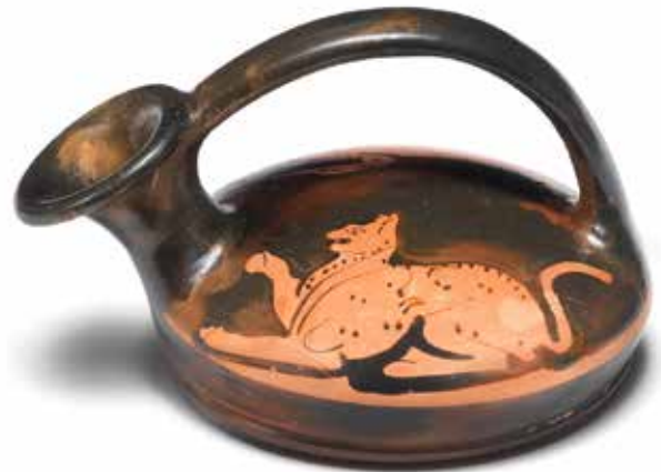
25 (side b)