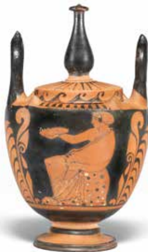
27 (side b)