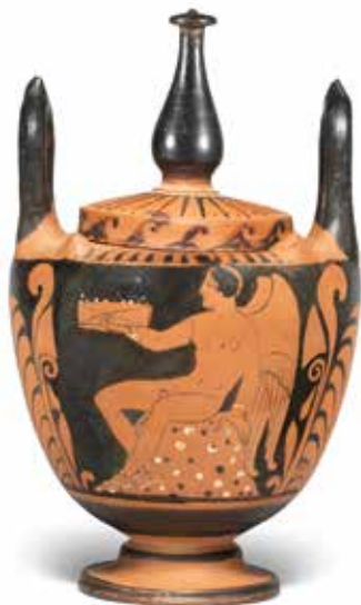
27 (side a)