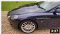
2005 Aston Martin DB9 6.0 V12 Coupe