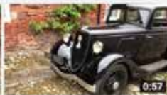
1936 Ford Model Y Tudor