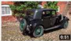
1933 Riley 9 Monaco Saloon