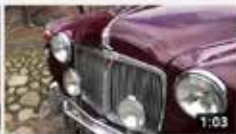
1961 Rover P4 100