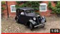
1938 Austin Big Seven