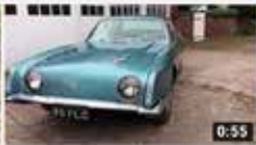
1963 Studebaker Avanti