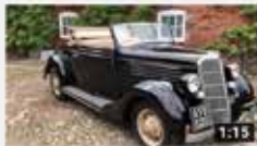
1935 Ford V8 Rumble Seat Cabriolet