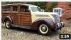
1937 Ford V8 'Woody' Station Wagon