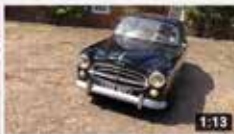
1958 Peugeot 403 Saloon