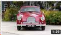
1954 Aston Martin DB2