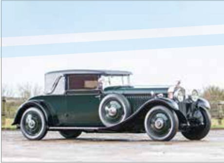
The 1926 Olympia Motor Show 1926 HISPANO-SUIZA H6B FIXED-HEAD COUPÉ Coachwork by Park Ward