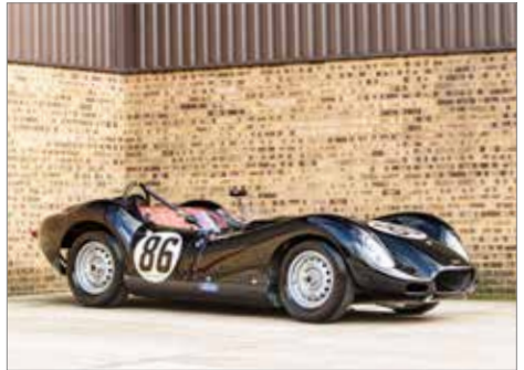
The 2018 Stirling Moss Trophy Championship winning 1958 LISTER-JAGUAR KNOBBLY