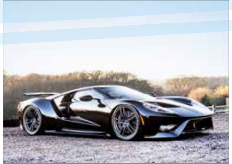
A rare UK delivered example circa 600 miles from new 2018 FORD GT COUPÉ