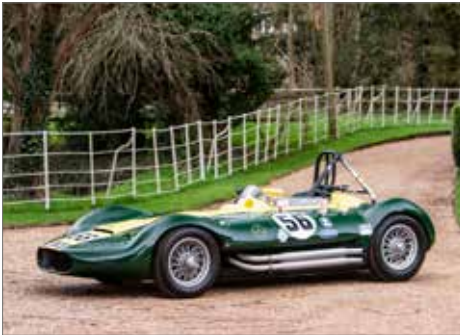
The ex-Archie Scott-Brown and the only example built 1956 LISTER-MASERATI SPORTS-RACING TWO-SEATER Chassis no. BHL 1