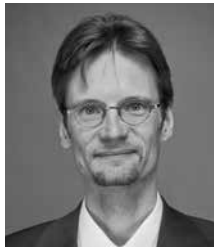
Ming Hua New York