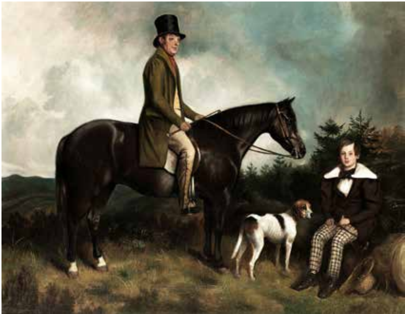
5 ENGLISH SCHOOL, 19TH CENTURY Man on a horse with a boy and dog oil on canvas 59 x 74cm (23 1/4 x 29 1/8in). £500 - 700 €570 - 790