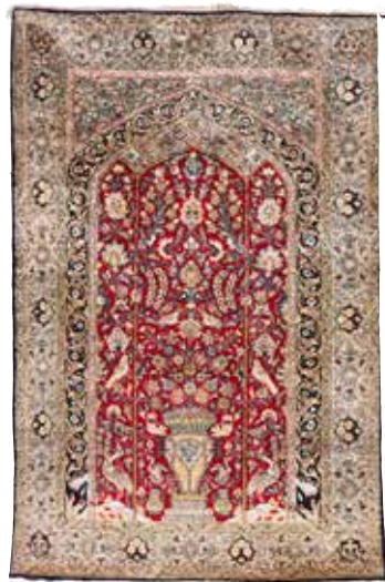
123 A SILK RUG

Ω 165cm x 106cm TP £400 - 600 €450 - 680