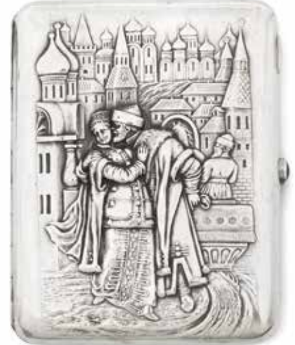
256 A RUSSIAN SILVER CIGARETTE CASE maker's mark 'A3' Moscow 1908 - 1927 The front with a scene of an embracing couple, with a lapis lazuli thumb-piece, length 12cm, weight 7oz. £600 - 800 €680 - 910