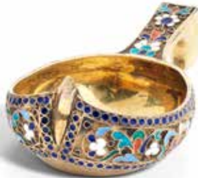
257 A RUSSIAN SILVER AND ENAMEL KOVSH by The Eleventh Moscow Artel, Moscow 1908 - 1927 With cloisonné enamel decoration, length 9cm , together with a further kovsh, Moscow 1895, weight total 3.5oz. (2) £500 - 700 €570 - 790