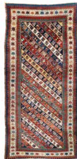
95 A KAZAK RUG TP Central Caucasus, 255cm x 108cm £800 - 1,000 €910 - 1,100