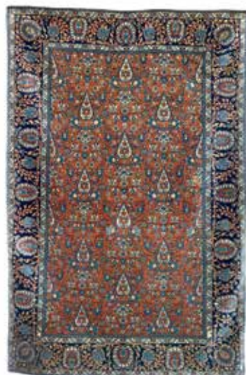
142 A MOHTASHEM KASHAN RUG