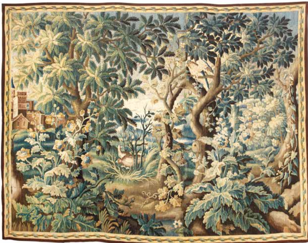
176 A LATE 17TH / EARLY 18TH CENTURY FLEMISH VERDURE TAPESTRY