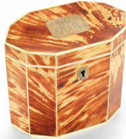
79 AN EARLY 20TH CENTURY TORTOISESHELL VENEERED AND IVORY INLAID TEA CADDY in the George III style of canted form, the hinged top inset with a metal panel with the monogram HM , enclosing a lidded foil lined interior, 11cm high, 13cm wide, 7.5cm deep £300 - 400 €340 - 450