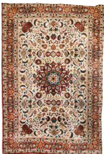
125 A SILK GHOM RUG

TP Central Persia, 175cm x 106cm £700 - 1,000 €790 - 1,100