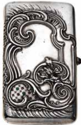
259 A RUSSIAN SILVER CIGARETTE CASE maker's mark 'ПП', Moscow 1908 - 1927 The front with a mythological bird, with a green glass thumb-piece, length 11cm ; together with a further Russian cigarette case, 1898-1908, the cover set with glass beads, length 12cm, weight total 12.5oz. (2) £500 - 600 €570 - 680