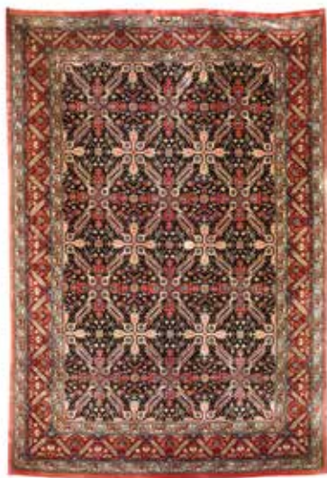
94 A SILK GHOM RUG Ω 100cm x 71cm TP £700 - 1,000 €790 - 1,100