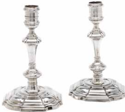
348 A PAIR OF GEORGE II CAST SILVER CANDLESTICKS possibly by James Langlois, maker's mark on one struck twice, London 1737 Knopped form with faceted stems, on shaped-square bases, height 17.5cm, weight 33oz. (2) £2,000 - 3,000 €2,300 - 3,400