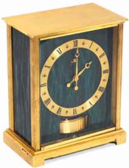
29 A 20TH CENTURY SWISS GILT BRASS AND DECORATED ATMOS TIMEPIECE signed Jaeger le Coultre, the rectangular case set with three malachite-effect panels, the dial with shaped moon hands reading against a Roman chapter ring set over the matt and burnished horizontal balance 22cms high £600 - 800 €680 - 910