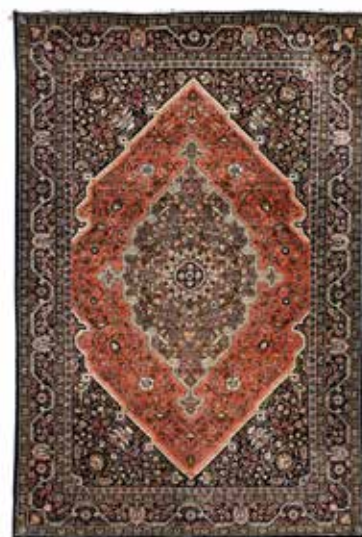
141 A SILK GHOM RUG