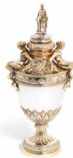
335 AN EDWARDIAN SILVER-GILT CUP AND COVER by Reid & Sons, London 1910 The cover surmounted by Hercules, the body with two mermaids holding wreaths, height 24cm, weight 17oz. £500 - 600 €570 - 680