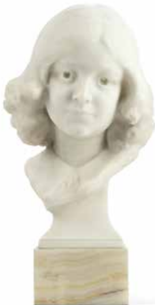
189 FREDERICK WILLIAM POMEROY (BRITISH, 1857-1924): A CARVED WHITE MARBLE BUST OF A YOUNG GIRL with curling shoulder length hair and wide pointed collar, on waisted square socle, signed and dated to one side F.W. POMEROY. ARA, SCULP - 1908, and square plinth base, 48cm high £800 - 1,200 €910 - 1,400