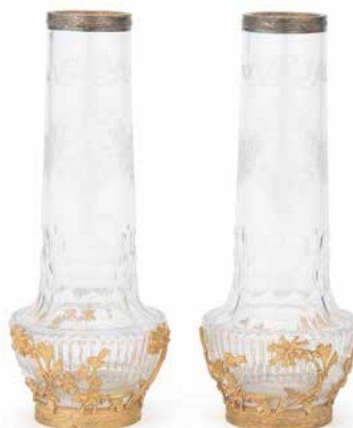
136 A PAIR OF FRENCH GILT BRONZE MOUNTED CUT AND ENGRAVD GLASS GARNITURE VASES possibly by Baccarat, earl 20th century the low shouldered squat bodies with floral cast mounts, the slightly tapering cylindrical necks with ribbon tied floral pendant drapery decoration and reeded rims, 28.5cm high £800 - 1,200 €910 - 1,400