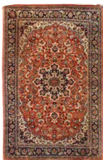
126 A SILK RUG

Ω 174cm x 104cm TP £700 - 1,000 €790 - 1,100