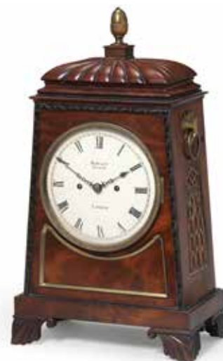
97 AN EARLY 19TH CENTURY BRASS-INLAID MAHOGANY TABLE CLOCK TP the dial signed for Hawley, Strand, London the gadrooned caddy top with acorn finial over cornucopia side handles and architectural sound frets, to a spreading base on carved feet, the repainted 7" Roman dial with matching hands and strike/silent lever above XII, the twin gut fusee movement with anchor escapement striking on a bell, the shouldered plates with engraved border, 51cms high £1,200 - 1,800 €1,400 - 2,000