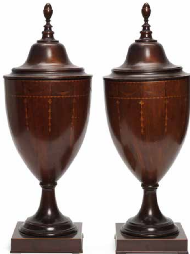
108 A PAIR OF LATE 19TH / EARLY 20TH CENTURY MAHOGANY AND BOXWOOD TP INLAID URNS AND COVERS in the George III style of pedestal vase form with ogee domed covers, the bodies inlaid with swagged and flowerhead and pendant husk decoration, on footed shallow square plinth bases, 61cm high (2) £1,200 - 1,800 €1,400 - 2,000