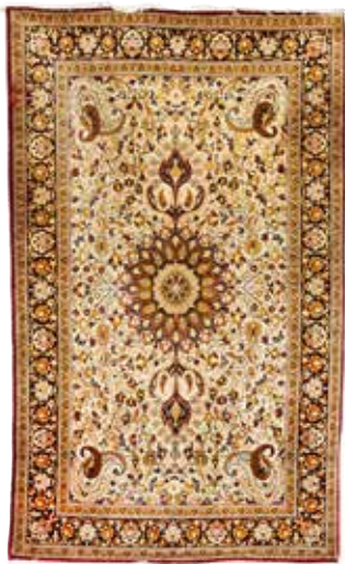
122 A SILK PRAYER RUG

TP Central Persia, 206cm x 134cm £700 - 1,000 €790 - 1,100