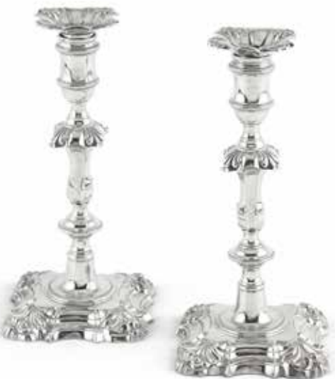
347 A PAIR OF GEORGE II SILVER CANDLESTICKS by John Cafe, London 1751 Rococo style, the removable drip pans and bases with six shells, crested, height 22.5cm, weight 38oz. (2) £1,500 - 2,000 €1,700 - 2,300