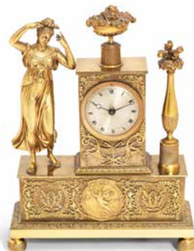
36 A 19TH CENTURY AND LATER FRENCH GILT BRONZE FIGURAL MANTEL CLOCK formed as a classical maiden and a foliate pillar flanking a pedestal set with a 3.52 Roman dial with moon hands, on a plinth base applied with a pierced mount on cast ball feet, the movement now replaced with a battery driven quartz movement, 43cms high £600 - 800 €680 - 910