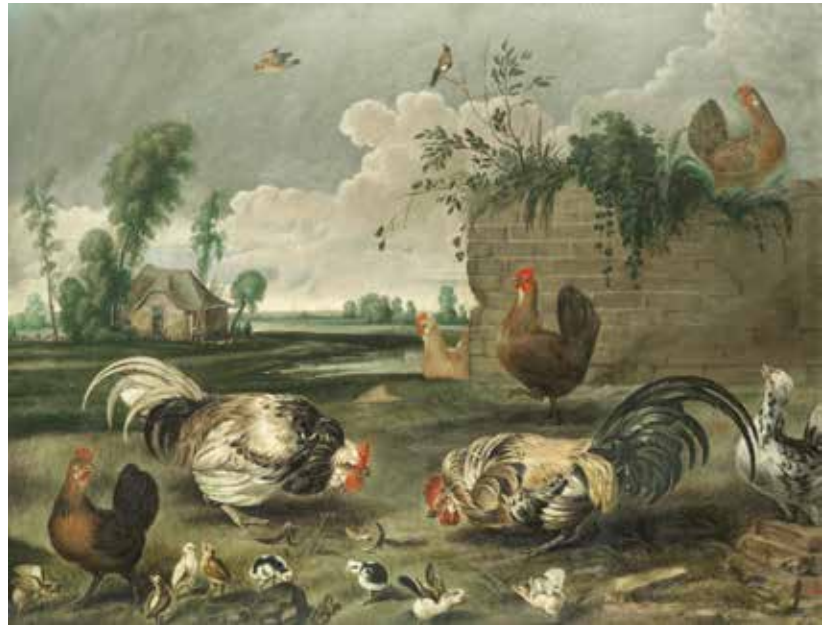
6 AFTER FRANS SNYDERS, 20TH CENTURY Birds in a landscape signed 'Montozo' and inscribed (on reverse) oil on canvas 89.6 x 115cm (35 1/4 x 45 1/4in). £1,000 - 1,500 €1,100 - 1,700