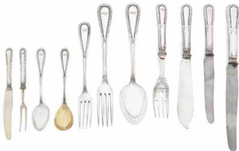
334 AN EXTENSIVE CANTEEN OF GERMAN SILVER FLATWARE by A. Voelkel, late 19th century With an ornate wreath border, placings for twelve, comprising: fish forks, fish knives, table forks, table knives, table spoons, dessert spoons, dessert forks, dessert knives, coffee spoons, teaspoons, fruit knives, fruit forks, seventeen serving pieces, in a canteen box, weight of weighable silver 114oz. (161) £3,000 - 5,000 €3,400 - 5,700