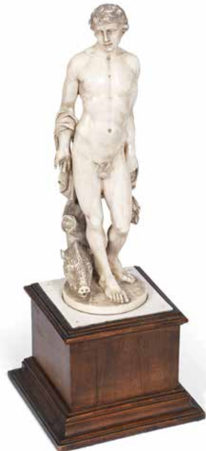
85 A LATE 18TH / EARLY 19TH CENTURY GERMAN CARVED IVORY FIGURE MELEAGER * the young classical male looking slightly to dexter, holding drapery around his naked body and standing beside a rustic tree stump, a boars head at his feet, on circular base, raised on a square thin foot mount, and set on a moulded square section plinth, the figure, 28.5cm high, 40cm high overall Y Φ £4,000 - 6,000 €4,500 - 6,800