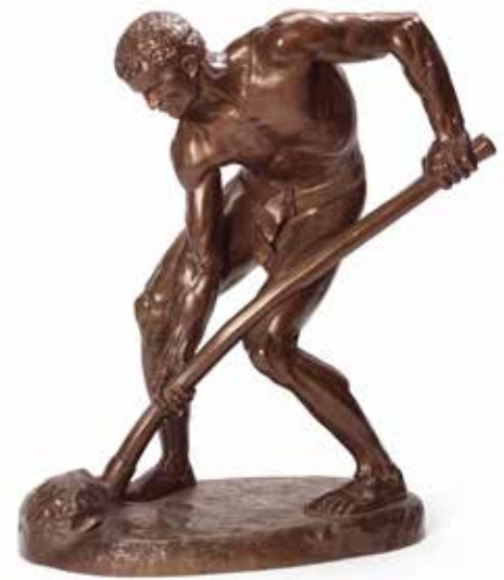
193 JEAN BOUCHER (FRENCH, 1870-1939): A BRONZE FIGURE OF 'LE TERRASSIER,' TP the semi-nude workman holding a shovel, on oval naturalistic base, signed within the edge of the cast BOUCHER , dark brown patination, 41cm high £1,200 - 1,800 €1,400 - 2,000

See Bonhams.com for further footnote on this lot