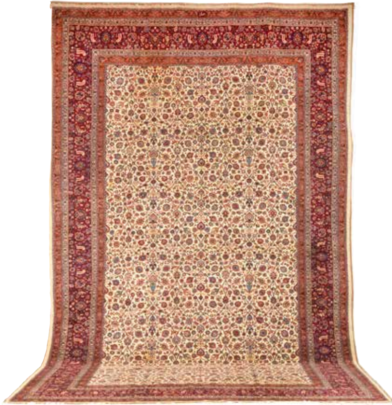
128 SABER MASHED TP North East Persia, 556cm x 350cm £8,000 - 12,000 €9,100 - 14,000