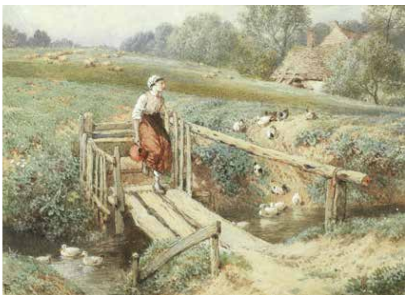
3 MYLES BIRKET FOSTER, RWS (BRITISH, 1825-1899) Crossing the bridge signed with monogram (lower left) watercolour heightened with white 20.3 x 27.9cm (8 x 11in). £1,200 - 1,800 €1,400 - 2,000