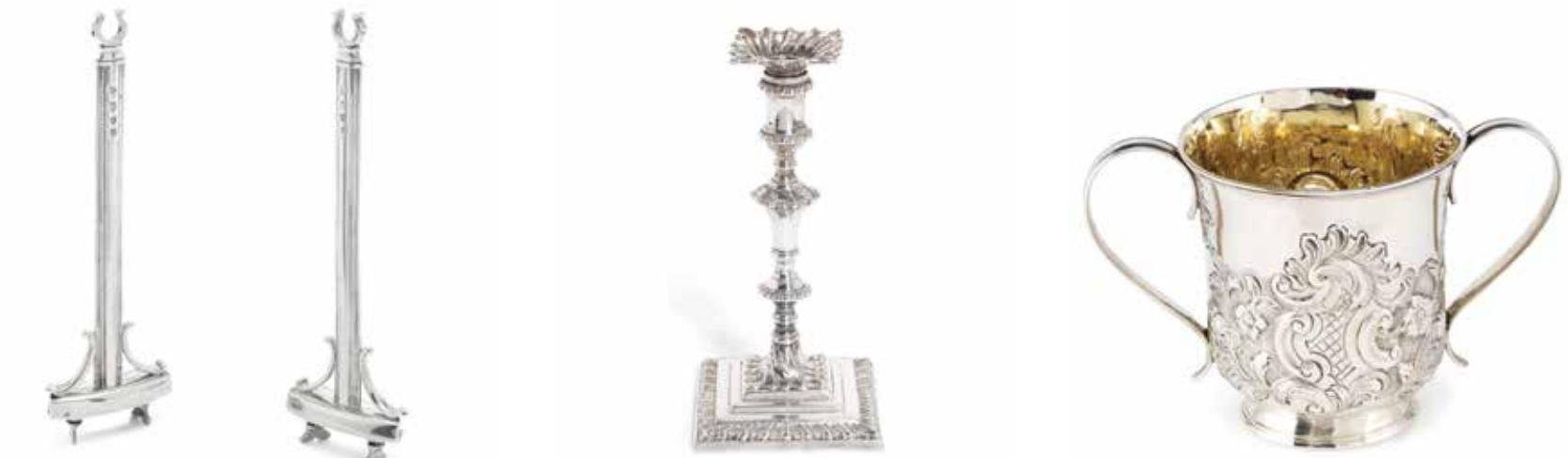
285 A PAIR OF GEORGE III SILVER BEEF MACHINE BRACKETS by Thomas Heming, London 1770 The fluted vertical supports leading to rounded clamps, one of the support finials with round holes, length 21.5cm, weight 11.5oz. £1,000 - 1,500 €1,100 - 1,700