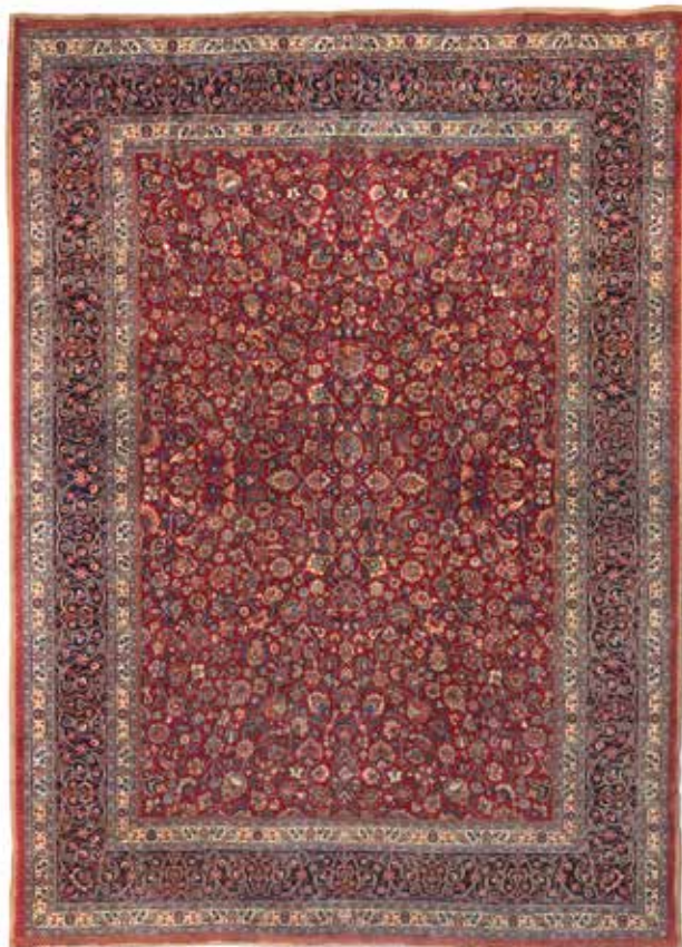
130 A SABER MASHED TP North East Persia, 340cm x 250cm £7,000 - 10,000 €7,900 - 11,000