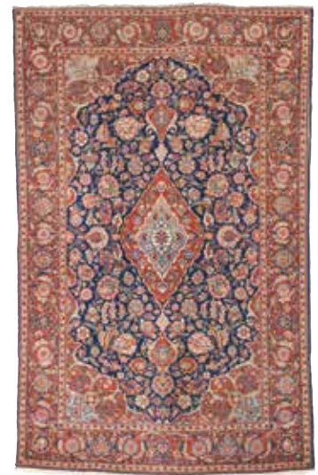
121 A PAIR OF KASHAN RUGS

Ω West Anatolia, TP 104cm x 75cm £1,000 - 1,500 €1,100 - 1,700