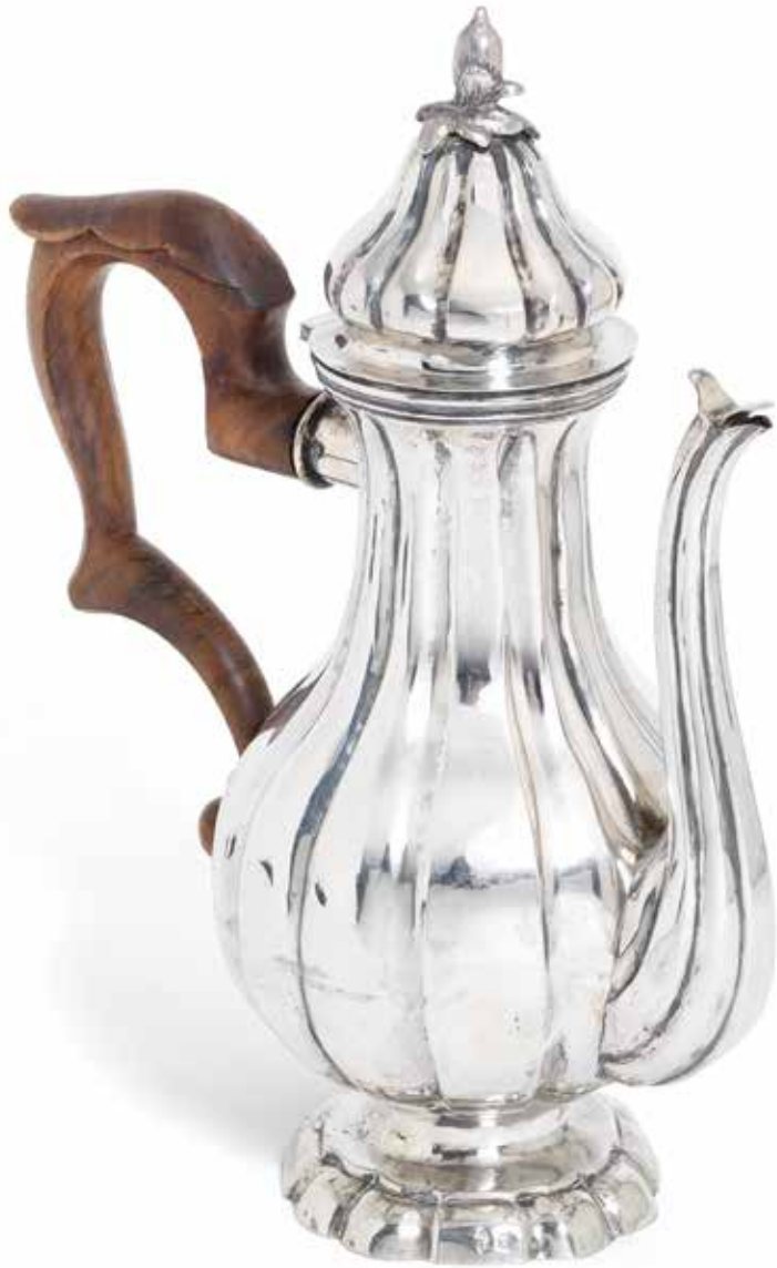
304 AN 18TH CENTURY MALTESE SILVER COFFEE POT maker's mark 'IL' with animal above, and mark for Ferdinand von Hompesch (1797-1798) Baluster form with vertical fluting, with a bud finial and wood handle, height 35cm, weight total 38.5oz. £3,000 - 5,000 €3,400 - 5,700