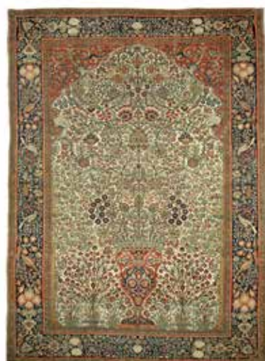
144 A KASHAN MOHTASHAM PRAYER RUG