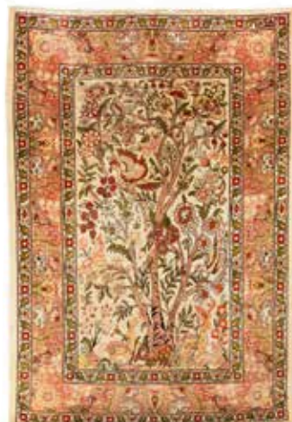
145 A SILK KAYSERI RUG WITH TREE