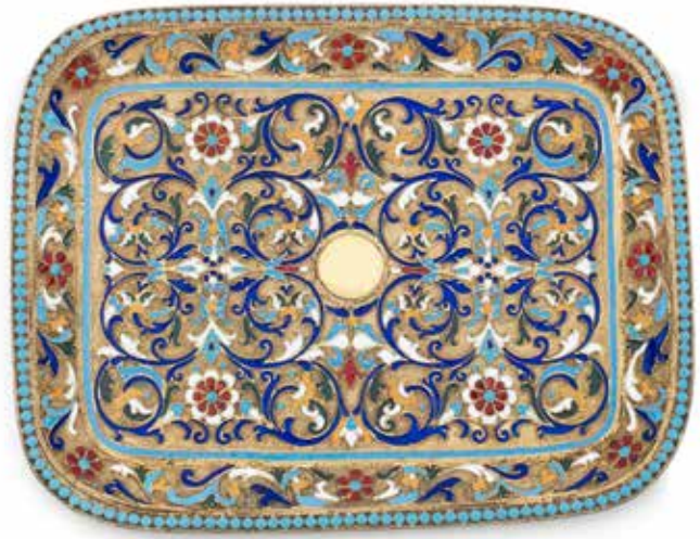
258 A RUSSIAN SILVER-GILT AND CLOISONNÉ TRAY maker's mark 'KK', St Petersburg circa 1890 Rectangular, the surface decorated with blue, white, red and orange cloisonné enamel, length 20cm, weight total 12oz. £500 - 700 €570 - 790