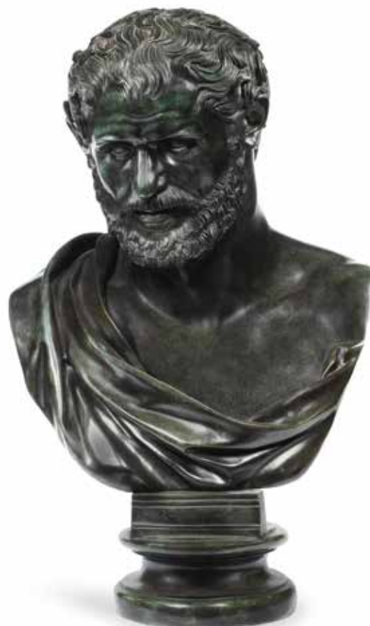
110 AFTER THE ANTIQUE: A LATE 19TH / EARLY 20TH CENTURY BRONZE BUST OF A TP GREEK PHILOSOPHER, POSSIBLY ARISTOTLE cast by the Chiurazzi foundry modelled looking slightly to dexter, his shoulders clad in drapery, inscribed Fonderia Chiurazzi on socle base, dark brown patination, 75cm high £800 - 1,200 €910 - 1,400