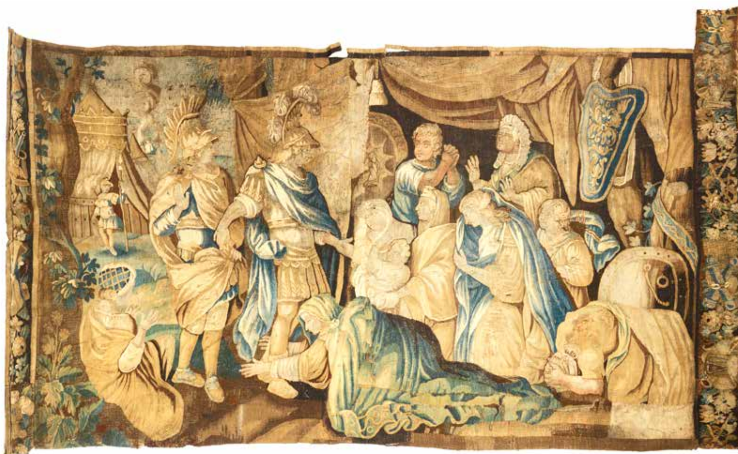
177 A FLEMISH MYTHOLOGICAL TAPESTRY