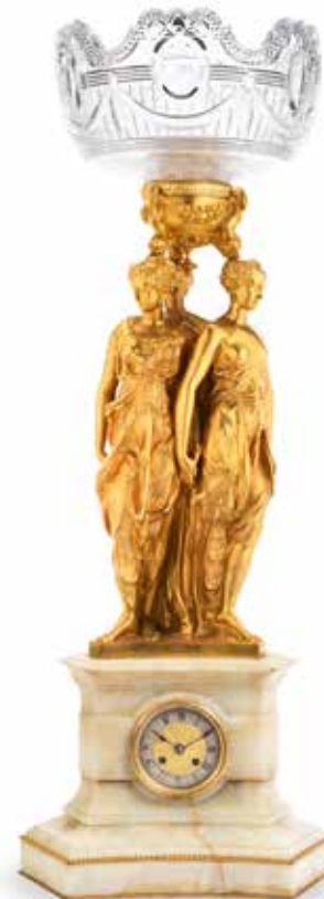
188 AN IMPRESSIVE FRENCH GILT BRONZE, ONYX AND CUT GLASS 'THREE GRACES' FIGURAL CLOCK CENTREPIECE TP parts 19th century and later, the bronze after Germain Pilon (French, 1525-1590), the movement stamped Japy Freres, the bowl set within a rams mask cast urn supported by the three classical maidens, on shaped tripartite base, the canted moulded clock case with griffins handles and 3.5" silvered and gilt Roman dial, the brass twin train movement striking on a bell, with pendulum and key, 95cm high £4,000 - 6,000 €4,500 - 6,800

See Bonhams.com for further footnote on this lot