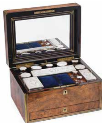
211 A LATE 19TH CENTURY SILVER-PLATED DRESSING SET IN A WALNUT CASE unmarked The lid opening to reveal a variety of boxes and pots, the bottom drawer with compartments for jewellery, height 18cm, length 31cm. £500 - 600 €570 - 680