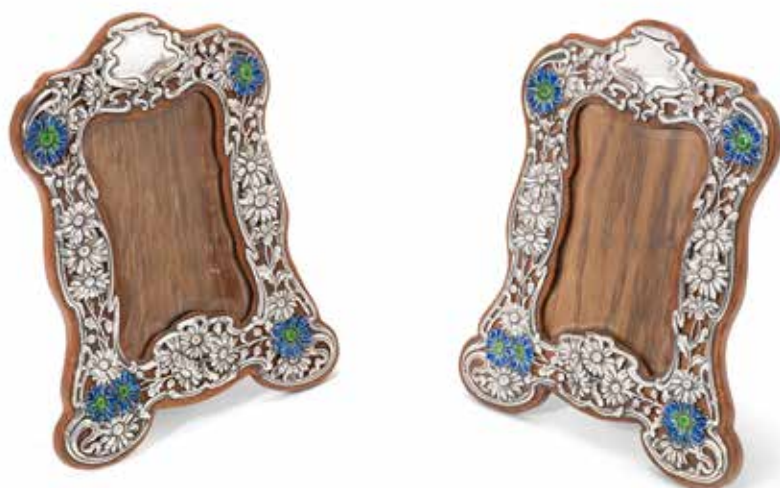
210 A MATCHED PAIR OF ART NOUVEAU SILVER PHOTOGRAPH FRAMES by James & William Deakin & Co Ltd and maker's mark WJM & Co, Chester 1904 / 1905, Upright shaped form with open-work frame, with later enamelled flowers, with wood easel backs, height 23cm. £1,500 - 2,000 €1,700 - 2,300