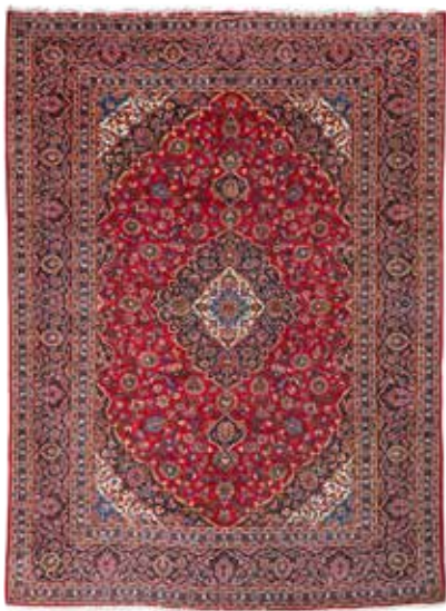
119 A KASHAN CARPET

TP Central Persia, 372cm x 270cm £700 - 1,000 €790 - 1,100