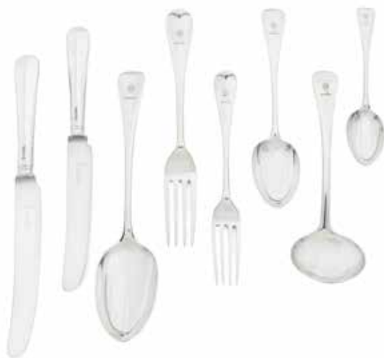
332 A VICTORIAN OLD ENGLISH PATTERN SILVER FLATWARE SERVICE by Holland, Son & Slater, London 1888 / 1889, the knives and sauce ladles later Placings for twelve, comprising: table spoons, table knives, table forks, dessert knives, dessert forks, dessert spoons, teaspoons, two sauce ladles, crested, a plated ladle, weight of weighable silver 114oz. (87) £1,000 - 1,500 €1,100 - 1,700