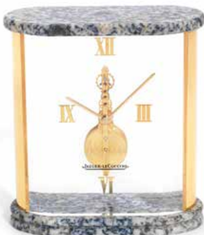
35 A 20TH CENTURY GILT-BRASS AND POLISHED STONE MANTEL TIMEPIECE signed Jaeger-LeCoultre, the shaped rectangular case with top and bottom panels of variegated stone over glass panels, the front faceted, the rear applied with Roman quarter hour numerals and visible in-line movement of a manually wound spring (numbered to the barrel 215.022) to a jewelled train of wheels terminating in a lever escapement, 14cms high £500 - 700 €570 - 790