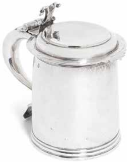
342 A WILLIAM III SILVER TANKARD by Hugh Roberts, London 1697 Straight-sided form, the lid with a ram's-horn thumb-piece, height 18.5cm, weight 26oz. £2,000 - 3,000 €2,300 - 3,400