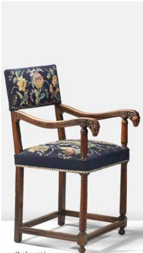
(1 of a pair)

Each with a horizontal top rail above channelled tablet and stylised rosette incised curved arm supports terminating in acanthus capped carved rams' masks, on ring turned arm terminals each headed by an entrelac collar, on ring turned front legs and square section back legs, with plain stretchers, restorations , each: 60cm wide. (2)