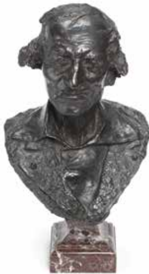
194 AFTER JEAN-BAPTISTE CARPEAUX (FRENCH, 1827 –1875): A PATINATED TP BRONZE BUST OF "LE FUMEUR" depicting a man smoking, signed and dated JB Carpeaux 1869 , raised on a levanto rouge marble square socle base, 54cm high £700 - 1,000 €790 - 1,100

See Bonhams.com for further footnote on this lot