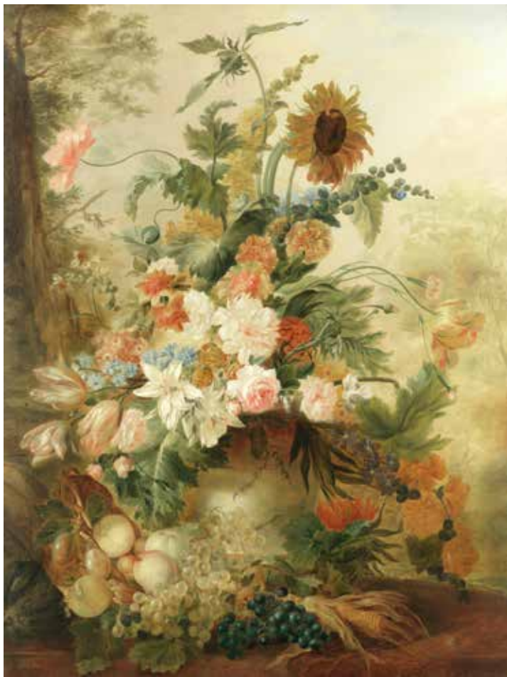
8 MANNER OF GEORGIUS JACOBUS JOHANNES VAN OS, 19TH CENTURY Still life of flowers oil on canvas 137.5 x 104.6cm (54 1/8 x 41 3/16in). £3,000 - 5,000 €3,400 - 5,700