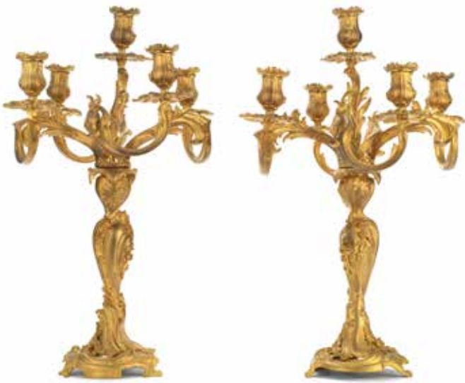
192 A PAIR OF LATE 19TH CENTURY GILT BRONZE FIVE LIGHT CANDELABRA TP in the Louis XV style and in the manner of Henri Dasson the acanthus and floral and rocaille cast baluster stems issuing four corresponding arms with acanthus urn nozzles centred by a further raised nozzle, on pierced scroll footed circular bases, 58cm high £2,000 - 3,000 €2,300 - 3,400