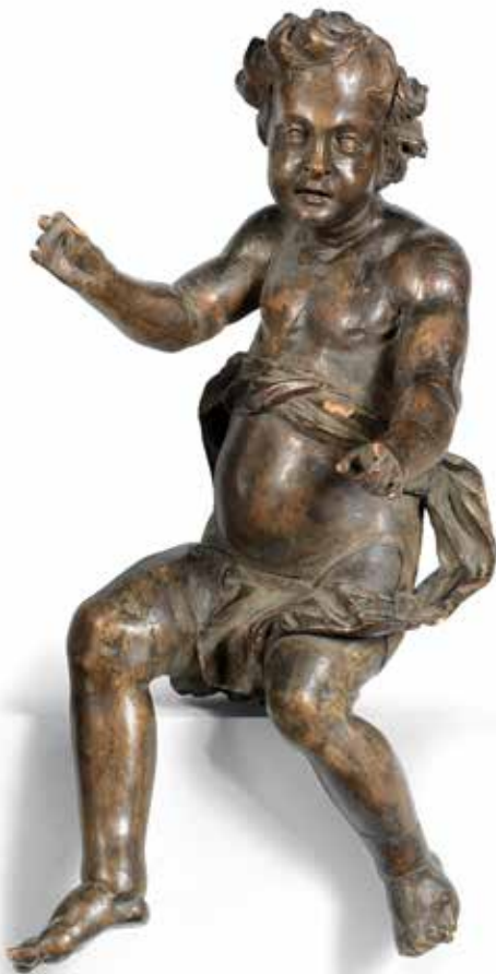
87 A LARGE AND IMPRESSIVE LATE 17TH / EARLY 18TH CENTURY CARVED AND STAINED WOOD FIGURE OF A SEATED PUTTO TP in the Baroque taste, probably English or Flemish with outstretched arms, his body clad in flowing drapery, 85cm high £1,200 - 1,800 €1,400 - 2,000