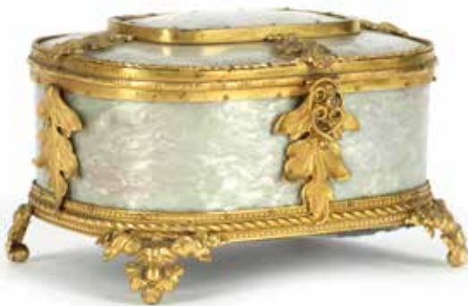
196 A LATE 19TH / EARLY 20TH CENTURY FRENCH GILT BRONZE AND SIMULATED MOTHER OF PEARL JEWELLERY CASKET of rounded rectangular form, with leafy mounts and foliate feet, 9cm high £300 - 400 €340 - 450