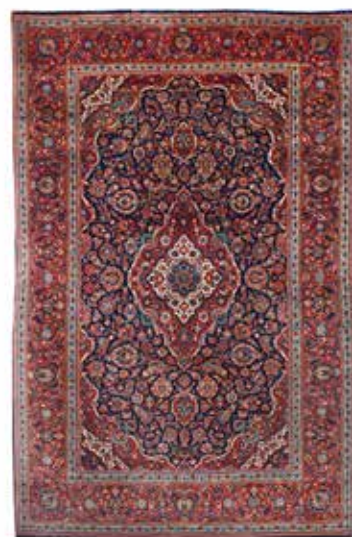
143 A KASHAN RUG