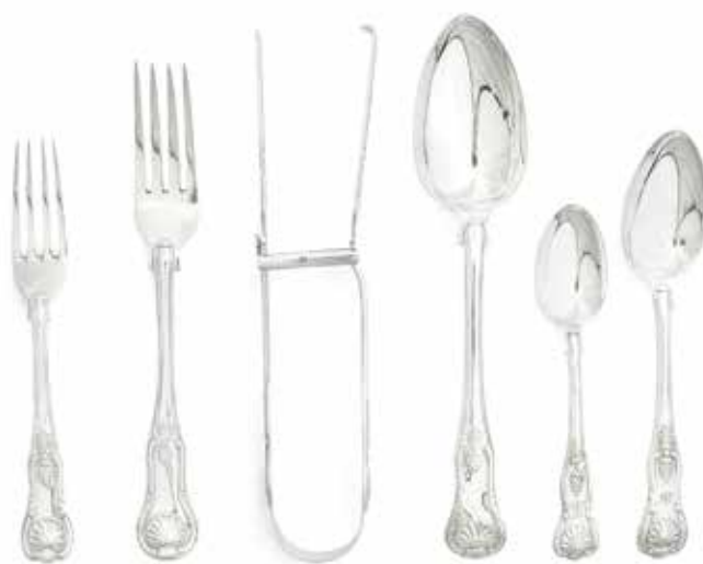
333 A MIXED SILVER KING'S PATTERN FLATWARE SERVICE various dates and makers, the majority Victorian Comprising: eleven table forks, six table knives, seven table spoons, fifteen dessert forks, five dessert knives, fourteen dessert spoons, six teaspoons, three sauce ladles, six fruit knives, asparagus tongs, eight further small serving pieces, a quantity of flatware in other patterns, weight excluding pieces with loaded handles or steel blades 138oz. (Qty) £1,500 - 2,000 €1,700 - 2,300