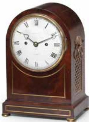
43 AN EARLY 19TH CENTURY BRASS-INLAID MAHOGANY TABLE CLOCK signed Perigal, London, the signed 6" painted Roman dial with heart shaped hands, twin wire fusee movement with shouldered and footed plates, anchor escapement striking on a bell, 32cms high £1,200 - 1,800 €1,400 - 2,000