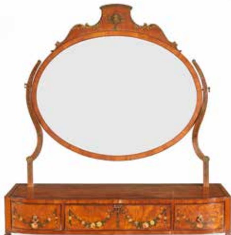
96 A LATE GEORGE III SATINWOOD, TULIPWOOD AND LATER POLYCHROME TP DECORATED BOWFRONT TOILET MIRROR With three drawers, 87cm wide x 31cm deep x 93cm high, (34in wide x 12in deep x 36 1/2in high) £700 - 900 €790 - 1,000