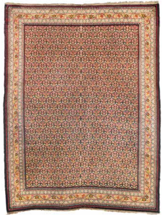
129 A JERUSALEM/MARVADIA (MARBADIA) RUG TP 155cm x 116cm £2,000 - 3,000 €2,300 - 3,400