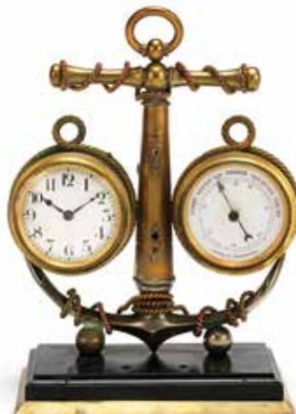
33 AN EARLY 20TH CENTURY BRASS AND SILVERED METAL NOVELTY MARINE TIMEPIECE/BAROMETER modelled as an anchor, supporting a time piece on the left side, the enamel dial with Arabic numerals, fitted with a watch time movement, and an aneroid barometer to the right side on an ebonised base, 23cm high £400 - 600 €450 - 680