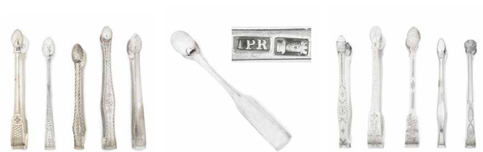
282 A COLLECTION OF EIGHTY SILVER SUGAR TONGS the majority Georgian Various patterns, weight 98oz. (80) £600 - 800 €680 - 910