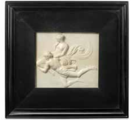
81 A LATE 19TH CENTURY CARVED IVORY FIGURAL PLAQUE DEPICTING MERCURY CARRYING PANDORA AFTER JOHN FLAXMAN (BRITISH, 1755-1826) TOGETHER WITH A CARVED ALABASTER PROFILE PORTRAIT RELIEF OF A CLASSICAL MALE the ivory mounted in a glazed ebonised rectangular frame, the alabaster mounted in a circular ebonised reeded frame, the ivory plaque, 11cm x 13cm (2) £300 - 400 €340 - 450