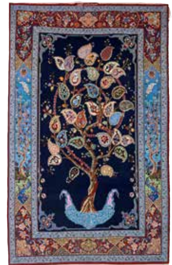
124 AN ISFAHAN TREE OF LIFE RUG

Ω Central Persia, TP 161cm x 97cm £400 - 600 €450 - 680