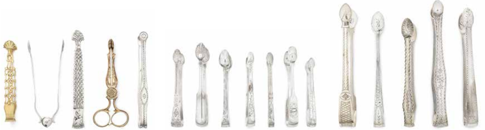
279 A COLLECTION OF TWENTY-EIGHT SILVER SUGAR TONGS AND NIPS various dates and makers Comprising eight pairs of tongs by Hester Bateman , a pair of scissor action nips, a pair of hinged tongs, and eighteen cast tongs, weight 32oz. (28) £500 - 700 €570 - 790