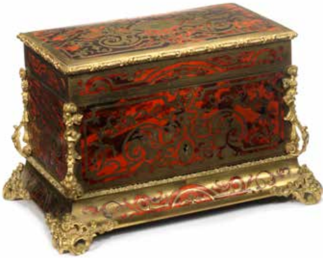
78 A LATE 19TH CENTURY FRENCH GILT-BRONZE MOUNTED CUT BRASS AND TORTOISESHELL 'BOULLE' MARQUETRY CASKET the hinged top and front opening to reveal three open compartments, the top centred by a crowned cypher MM , the sides and back with similar inlaid decoration, on a spreading base and scrolling foliate feet, 31cm wide, 20cm deep, 20cm high £500 - 800 €570 - 910