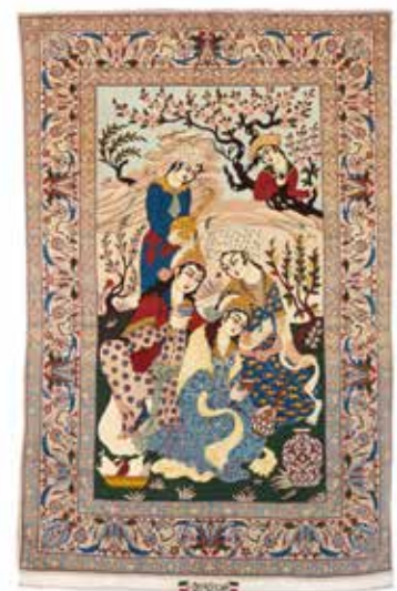
127 AN ISFAHAN CARPET

TP Central Persia, 165cm x 108cm £700 - 1,000 €790 - 1,100