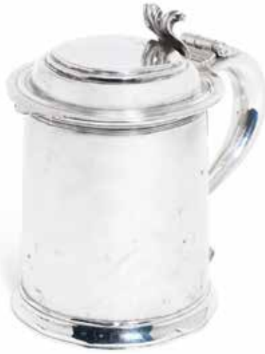
343 A QUEEN ANNE SILVER TANKARD by John Gibbons, London 1707 Straight-sided form, the lid with a ram's-horn thumb-piece, height 16cm, weight 19.5 oz. £2,000 - 3,000 €2,300 - 3,400