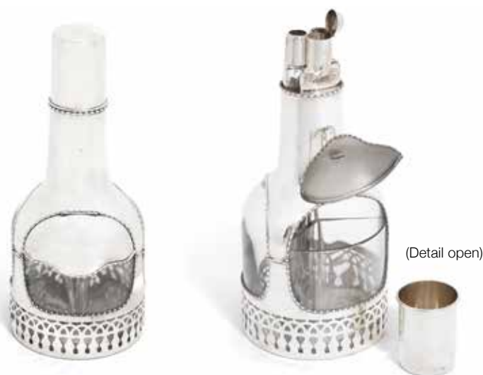
209 AN AMERICAN DRINK AND SMOKING COMPENDIUM by Black, Starr & Frost, New York circa 1900 Formed of two decanters, a cigarette holder, vesta case and beaker, mounted as one, height 28.5cm. £800 - 1,200 €910 - 1,400