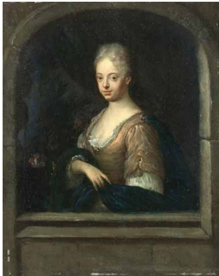
9 FOLLOWER OF CASPAR NETSCHER (HEIDELBERG 1639-1684 THE HAGUE) A woman at a window oil on panel 24.2 x 19.5cm (9 1/2 x 7 11/16in). £800 - 1,200 €910 - 1,400