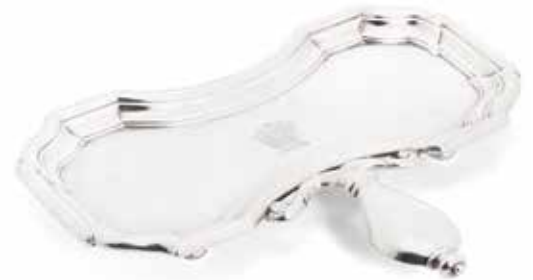
349 A GEORGE II SILVER SNUFFER TRAY by David Willaume II, London 1727 Waisted rectangular form with stepped border, with a faceted tear drop handle, on four bun feet, length 18.5cm, weight 10.5oz. £1,500 - 2,000 €1,700 - 2,300