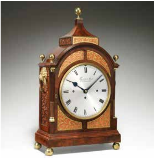
37 A 19TH CENTURY MAHOGANY TABLE CLOCK TP signed Thwaites and Reed, London, the signed silvered 9" Roman dial with strike/silent above XII, the substantial triple chain fusee movement with anchor escapement striking the hours on a single bell and chiming the quarters on a run of eight bells and hammers, 65cm high £1,500 - 2,500 €1,700 - 2,800