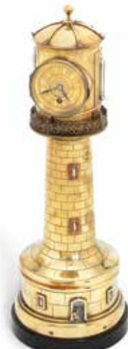
34 A 19TH CENTURY FRENCH AUTOMATA LIGHTHOUSE COMPENDIUM with a working, rotating head wound from the base and alternately showing the time dial, a thermometer, and barometer and a reamur thermometer, on a slate base, 43cms high £800 - 1,200 €910 - 1,400