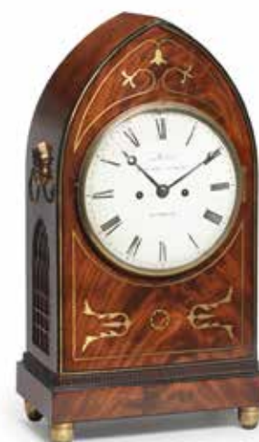
99 A GOOD EARLY 19TH CENTURY BRASS-INLAID MAHOGANY BRACKET CLOCK TP ON WALL BRACKET signed Miles, Ludgate Street, London, the lancet case with brass inlay and architectural brass side panels with silk backing, on acorn feet, the signed painted Roman dial with moon hands, the twin gut fusee movement with anchor escapement and rack strike on the bell, the backplate with engraved border; sold with a matching mahogany bracket with inlaid front panel and single strut 52cms high (2) £1,000 - 1,500 €1,100 - 1,700