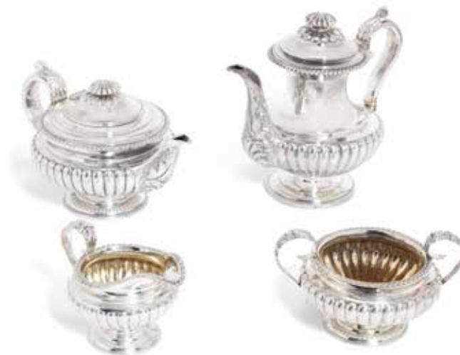
331 A WILLIAM IV FOUR-PIECE TEA AND COFFEE SERVICE Y by Charles Fox II, London 1830 / 1831 Φ Rounded form, with gadrooned sides, the pots with ivory insulators, height of coffee pot 22.5cm, weight total 73oz. (4) £1,000 - 1,500 €1,100 - 1,700