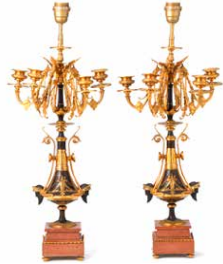
195 A PAIR OF LATE 19TH CENTURY GILT AND PATINATED BRONZE GARNITURE TP CANDELABRA in the Neo-Grec style, later converted to lamp bases the griffin and oval maskhead scrolling arms surmounted by the later fittings, raised on swept twin handled pedestal vases with bearded mask terminals and stepped pink marble footed plinths, 67cm high (2) £1,000 - 1,500 €1,100 - 1,700