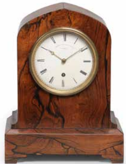
31 A GOOD LATE 19TH CENTURY ROSEWOOD MANTEL TIMEPIECE OF SMALL SIZE WITH DEADBEAT ESCAPEMENT signed Frodsham, Gracechurch Street, London, with enamel Roman dial, the movement with single chain fusee to a deadbeat escapement, 21cms high £700 - 900 €790 - 1,000