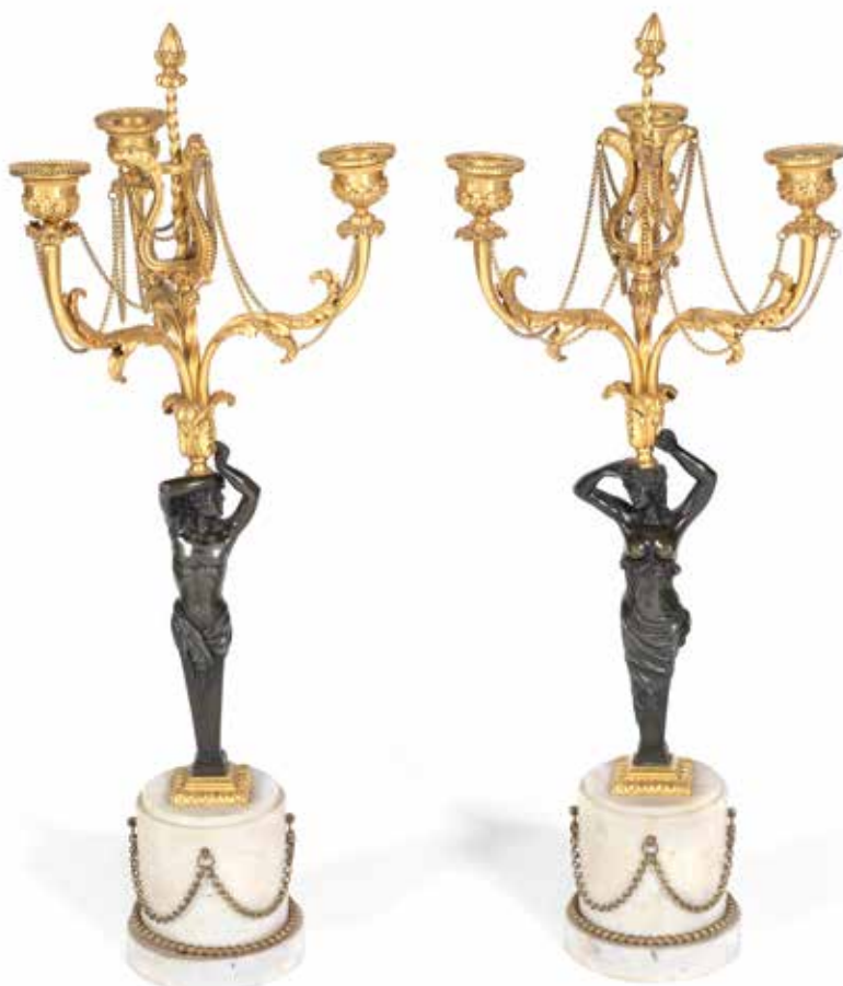
134 A PAIR OF LOUIS XVI GILT AND PATINATED BRONZE AND WHITE MARBLE TP FIGURAL THREE LIGHT CANDELABRA the chain hung acanthus wrapped scrolling arms with leaf cast nozzles and collars about central acanthus knopped spiral stems surmounted by griffins head scrolls and stylised acorn finials, supported by classical female terms on square foliate bases beaded and chain hung cylindrical plinths, 58cm high (2) £2,000 - 3,000 €2,300 - 3,400 135 no lot