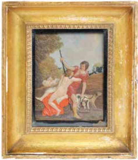
84 ATTRIBUTED GIOVANNI FRANCESCO PIERI (ITALIAN, 1699-1773): A RARE THIRD QUARTER 18TH CENTURY NEOPOLITAN RELIEF CAST COLOURED WAX FIGURAL PLAQUE DEPICTING VENUS AND ADONIS circa 1761 and after Titian (Italian, 1488-1526), the plaque mounted within a slip and set within a glazed gilt frame, the rear with paper backing with contemporary ink dated inscription, the plaque, 15cm x 19cm, the frame, 34cm x 28cm £1,000 - 1,500 €1,100 - 1,700