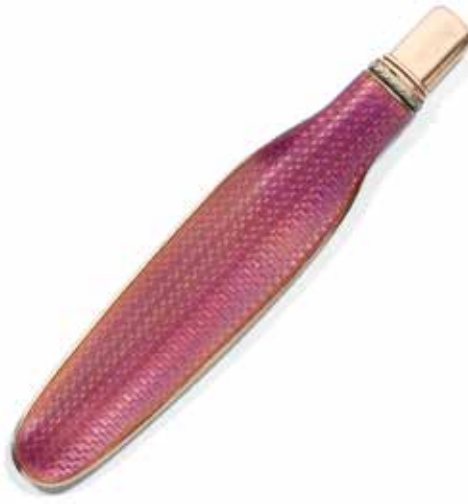
255 A RUSSIAN GOLD AND ENAMEL PENCIL HOLDER maker's mark '?C', 56 zolotnik standard, 1908 - 1927 marks The main stem with gorge-de-pigeon enamel over an engine-turned ground, the pencil held in the pull-off top, length 11cm, weight total 36gms. £1,000 - 1,500 €1,100 - 1,700