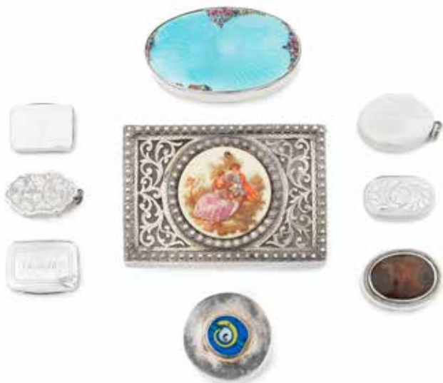
206 A COLLECTION OF FIVE GEORGIAN SILVER VINAIGRETTES various dates and makers Together with a Victorian vinaigrette, two silver boxes, and a plated box. (9) £500 - 700 €570 - 790