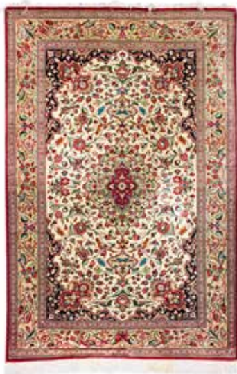
140 A SILK GHOM RUG