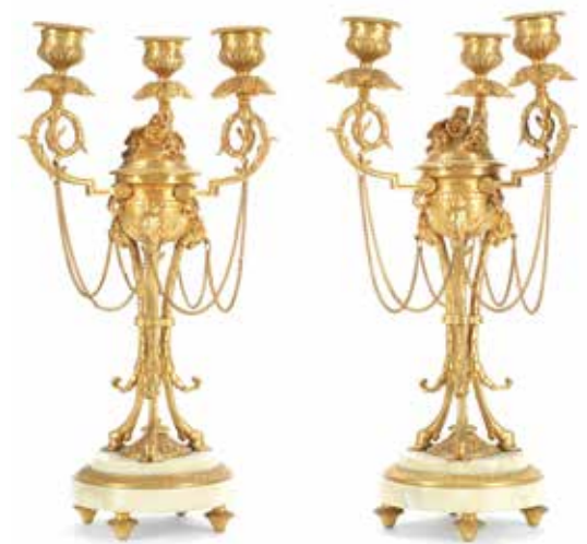
191 A PAIR OF FRENCH GILT BRONZE MOUNTED WHITE MARBLE THREE LIGHT CANDELABRA in the Louis XVI style, probably early 20th century the foliate scrolling arms with palmette cast nozzles and leafy collars issuing from central floral base sections on tripartite supports and hoof feet, raised on circular bases and toupie feet, 33cm high (2) £700 - 1,000 €790 - 1,100