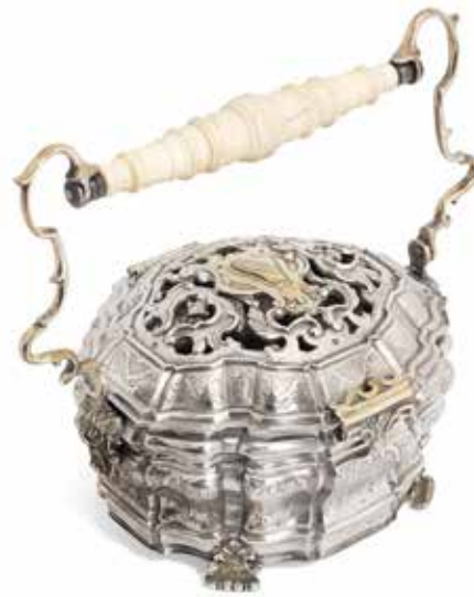
306 AN ITALIAN PARCEL-GILT SILVER HAND WARMER (SCALDINO) Y Rome, 19th century, maker's mark possibly a bell Φ Shaped-oval on four scroll cast feet, the sides and hinged cover with panels of scrolls and foliage, pierced cover centred with an armorial rococo form cartouche, the upright swing handle with ivory grip, length 25cm, weight total 30.5oz. £2,000 - 3,000 €2,300 - 3,400