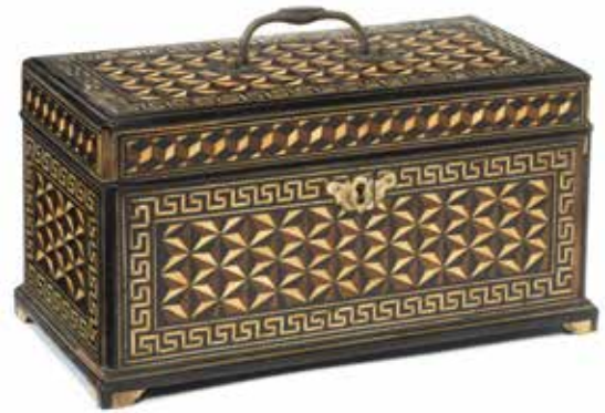
86 AN 18TH CENTURY ANGLO-INDIAN PADOUK, EBONY AND IVORY MARQUETRY AND PARQUETRY TEA CADDY Y decorated with an all over parquetry stellar design within Greek key borders, the moulded edge top with an articulated brass handle enclosing a divided interior with three lidded compartments and three divisions behind, 15cm high, 28.5cm wide, 14cm deep £400 - 600 €450 - 680