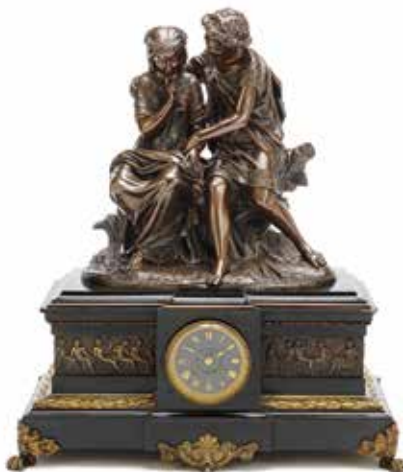
41 A LATE 19TH CENTURY FRENCH PATINATED BRONZE TP AND SLATE FIGURAL MANTEL CLOCK retailed by James Murray, Paris, the bronze cast after Moreau, the case surmounted by a seated young couple, the twin train movement striking on a bell, the backplate stamped for S. Marti and A. Lemaire. 59cms high £1,000 - 1,500 €1,100 - 1,700