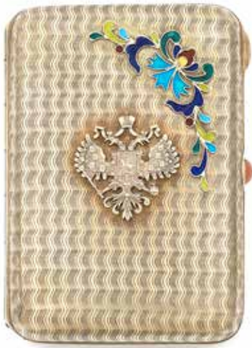
254 A RUSSIAN SILVER-GILT CIGARETTE CASE maker's mark 'AM', Moscow 1908 - 1927 Rectangular with rounded sides, with applied Imperial eagle and enamelled decoration, with a carnelian thumb-piece, length 9.5cm, weight total 6oz. £600 - 800 €680 - 910