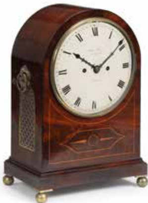
40 AN EARLY 19TH CENTURY BOXWOOD-INLAID MAHOGANY TABLE CLOCK the dial signed for John Moore, Clerkenwell, London, with 7.5 inch painted Roman dial, the twin chain fusee movement with anchor escapement to a stirrup-type pendulum with rack strike on a bell, 41cms high £800 - 1,200 €910 - 1,400