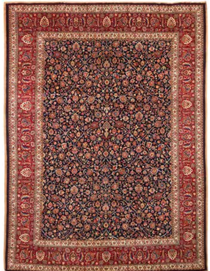
131 A SABER MASHED CARPET TP North East Persia, 394cm x 300cm £4,000 - 6,000 €4,500 - 6,800