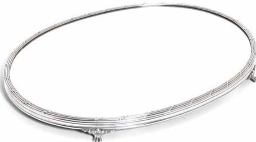
307 A FRENCH SILVER-MOUNTED MIRROR PLATEAU by Georges Falkenberg, circa 1900, first standard Paris marks Oval, with a ribbon-tied reed border, on four lion paw feet, length 60cm. £2,500 - 3,500 €2,800 - 4,000