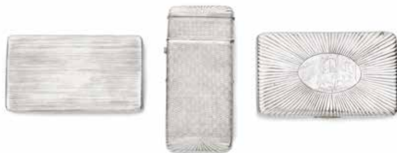
207 THREE 19TH CENTURY DUTCH SILVER BOXES various dates and makers One with an engraved scene of a man and children, length of the longest 13.5cm, weight 16oz. (3) £600 - 800 €680 - 910