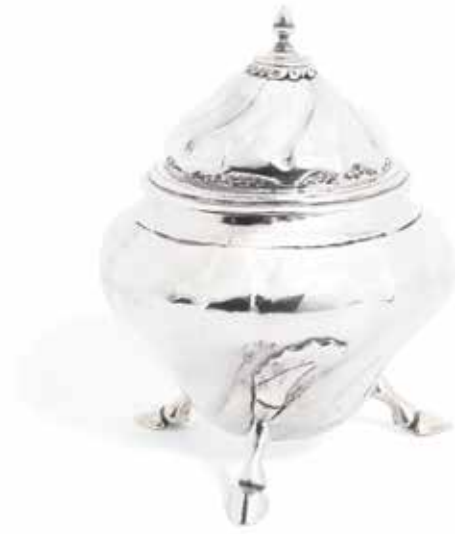
305 AN 18TH CENTURY MALTESE SILVER SUGAR BOWL AND COVER with Ferdinand von Hompesch mark (1797-1798) Pear form, with spiral flutes and three hoof feet, height 12.5cm, weight 8.5oz. £1,000 - 1,500 €1,100 - 1,700