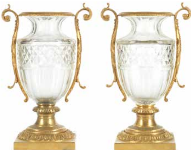
82 A PAIR OF FRENCH GILT BRONZE MOUNTED MOULDED AND CUT GLASS VASES the glass possibly Baccarat, in the Empire taste, 20th century the flared faceted and diamond cut banded urn bodies, within acanthus cast rims, with applied beaded foliate scrolling handles, on elaborate leafy and petal case circular socle pedestals, raised on integral square plinth bases, 26cm high (2) £600 - 800 €680 - 910