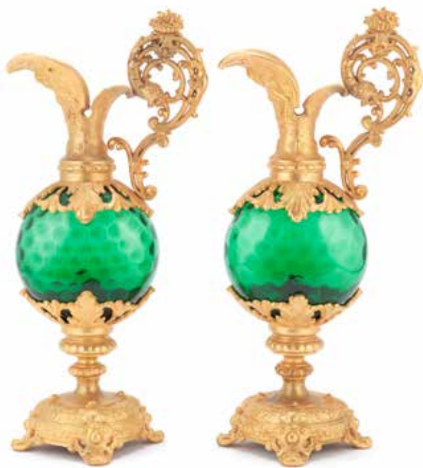
132 A PAIR OF LATE 19TH CENTURY / EARLY 20TH CENTURY GILT COPPER TP MOUNTED GREEN GLASS EWERS with floral basket and foliate high scrolling handles maskhead spouts and acanthus collars, the flattened ovoid dimpled bodies on knopped pedestal circular scroll footed, bases, 46cm high £500 - 800 €570 - 910