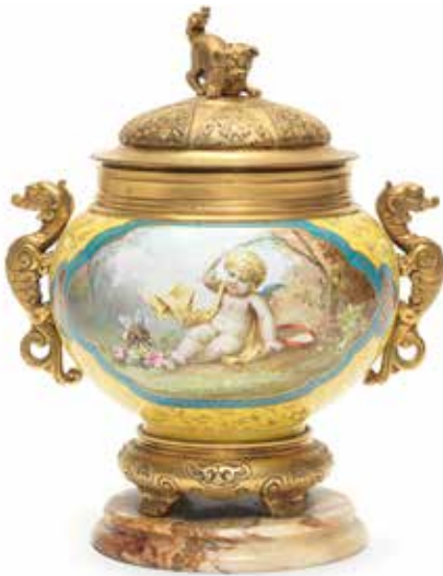
80 A FRENCH GILT BRONZE MOUNTED PORCELAIN VASE AND COVER in the Japonaisque style, probably late 19th / early 20th century the bulbous squat body applied with a pair of dragon handles and painted with two oval reserves of a putto and a song bird on a yellow ground, the cover with Buddhistic lion, on footed circular base and marble plinth, 24cm high £500 - 800 €570 - 910