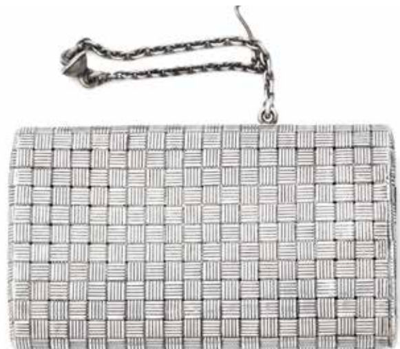
260 A RUSSIAN SILVER 'BASKET EFFECT' CIGARETTE CASE maker's mark 'OM', St Petersburg, circa 1880 Made of interwoven silver strips, with a separate vesta compartment, length 10.5cm, weight 5oz. £500 - 700 €570 - 790