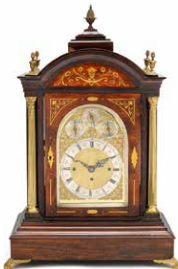
44 A LATE 19TH CENTURY BRASS-INLAID QUARTER TP CHIMING ROSEWOOD TABLE CLOCK Y the 7.25 arched dial with subsidiary dials for chime/silent, regulation and chime on 8 bells/Westminster, the triple chain fuse movement striking the hours on a gong and chiming the quarters on a run of eight bells, 74cms high £1,200 - 1,800 €1,400 - 2,000