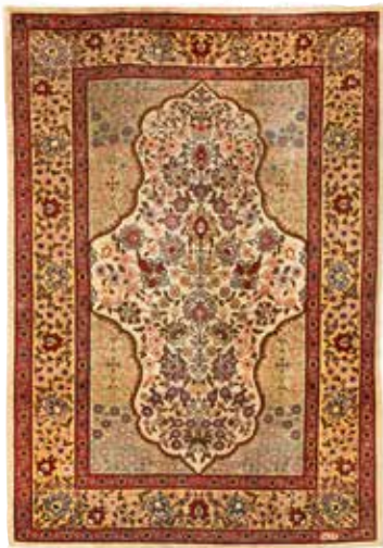
120 A SILK KAYSERI RUG

TP Central Persia, 372cm x 270cm £700 - 1,000 €790 - 1,100