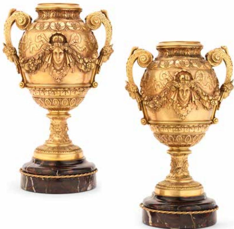
109 PAIR OF GILT BRONZE, GLASS AND ROUGE GRIOTTE MARBLE GARNITURE A URNS in the Louis XIV style, probably late 19th or early 20th century with scrolling serpent and maskhead handles, the ovoid bodies cast with shells and female maskheads united by ribbon tied fruiting garlands, on grotesque mask cast pedestals and circular bases, raised on moulded plinths, 46cm high overall £1,000 - 1,500 €1,100 - 1,700