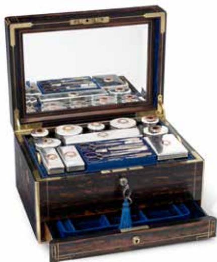
208 A VICTORIAN SILVER-MOUNTED DRESSING SET IN A COROMANDEL CASE by Thomas Johnson, London 1872 Containing silver-mounted cut glass pots with carnelian ornament and manicure implements, length 33cm. £800 - 1,200 €910 - 1,400