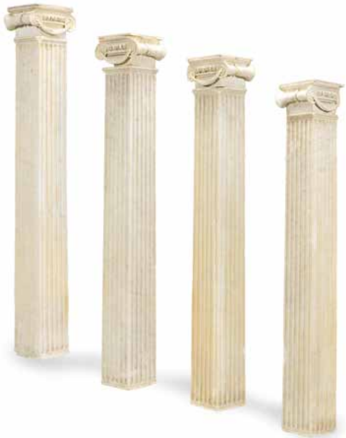
187 A SET OF FOUR ITALIAN OR FRENCH CARVED MARBLE COLUMNS TP possibly late 18th century of fluted square section form with separate draped ionic capitals each 141cm high including capitals (8) £1,200 - 1,800 €1,400 - 2,000

See Bonhams.com for further footnote on this lot