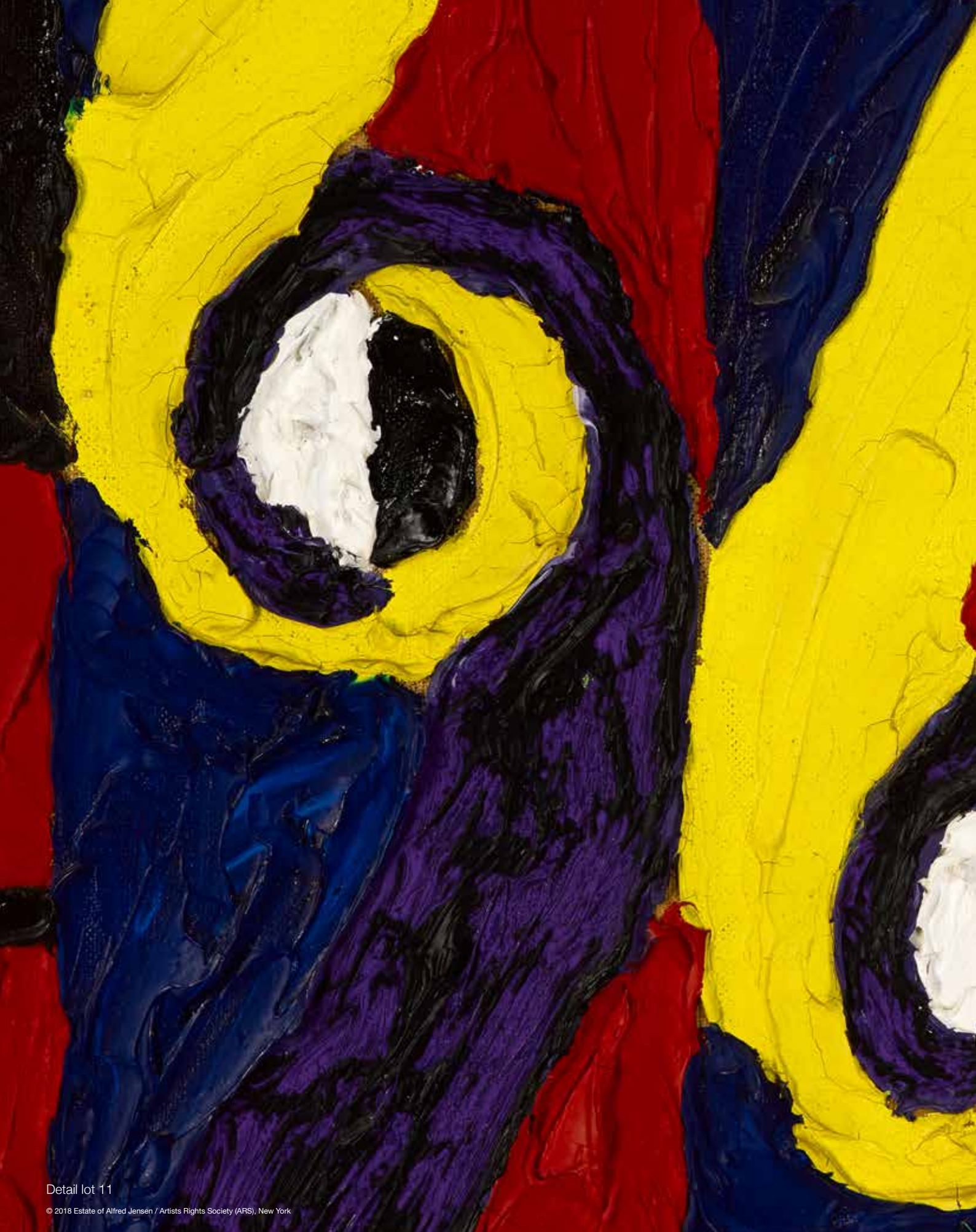
Detail lot 11