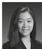
Gigi Yu Hong Kong