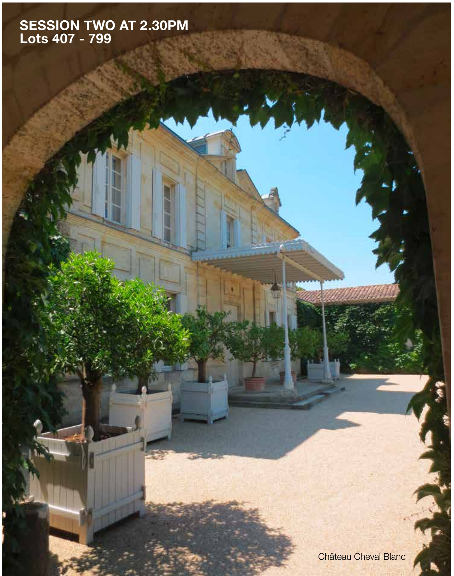
Château Cheval Blanc