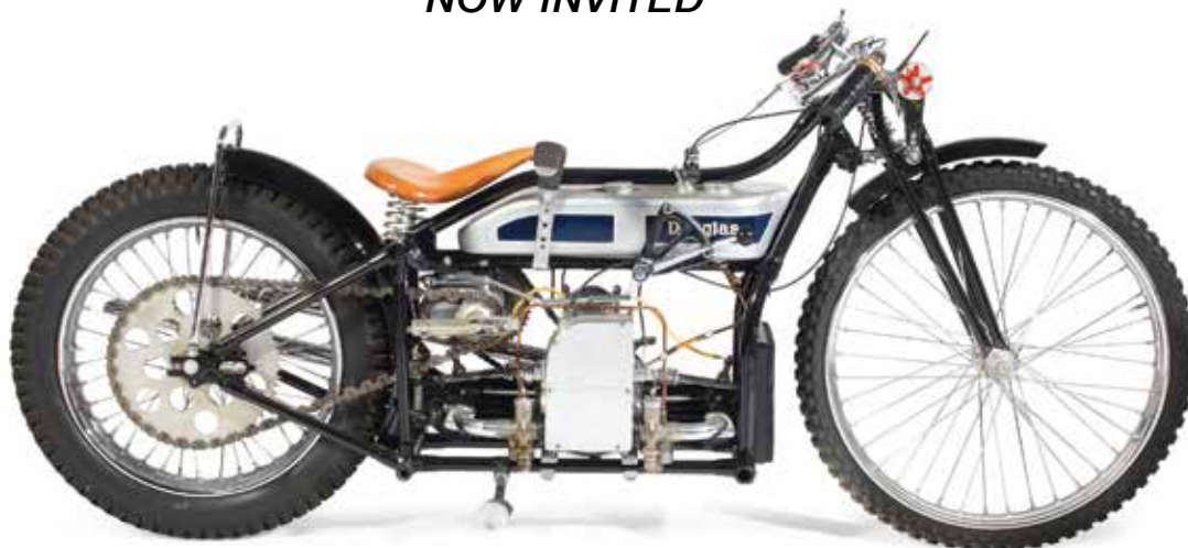
C.1928 DOUGLAS DT £7,000 - 10,000 *