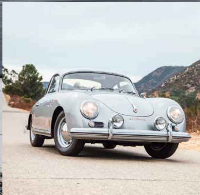
Expertly restored example Eligible for the most prestigious events worldwide 1956 PORSCHE 356A 1500 CARRERA GS COUPE Coachwork by Reutter