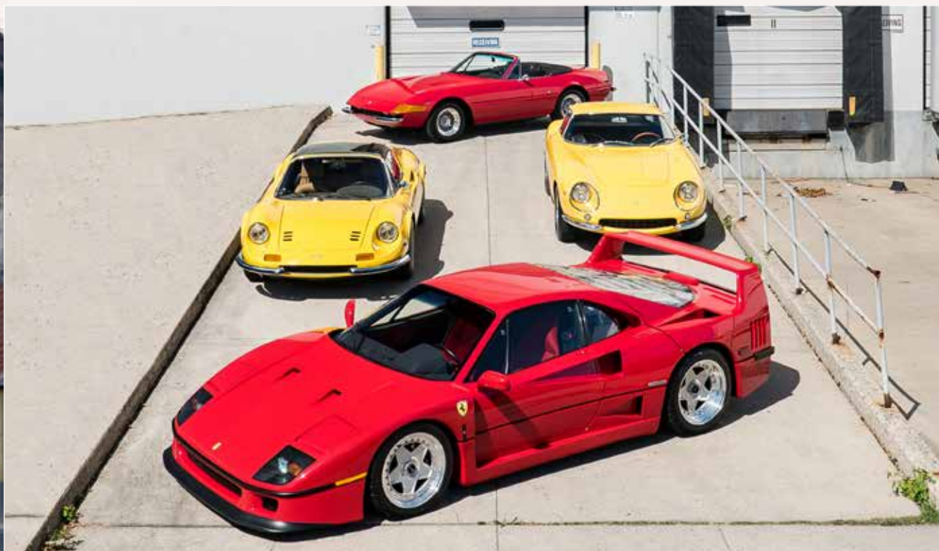
EXCEPTIONAL COLLECTION OF PININFARINA-DESIGNED FERRARIS ALL FERRARI CLASSICHE CERTIFIED

+1 (415) 391 4000, West Coast +1 (212) 461 6514, East Coast motors.us@bonhams.com