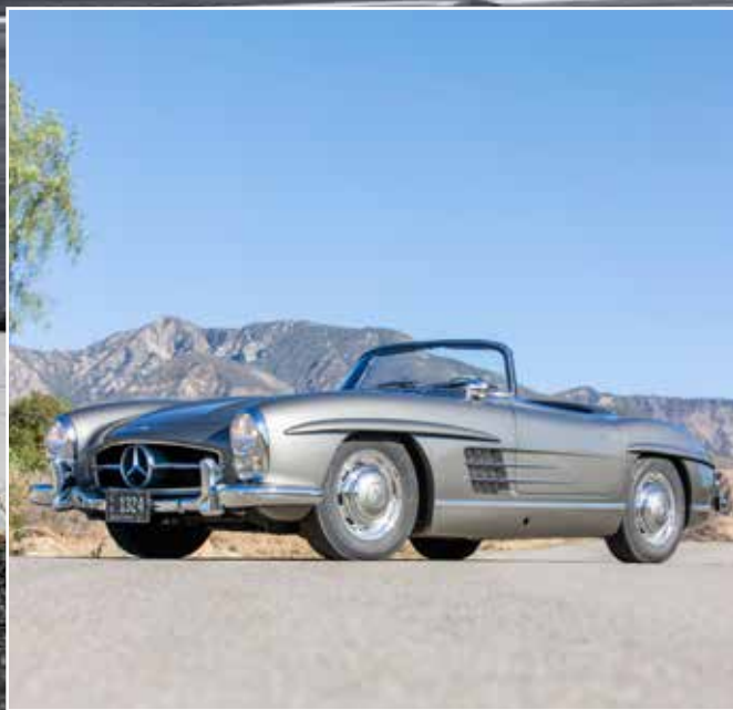
Exceptional restoration by Race Drive, Inc Prototype example and first US-market Roadster 1957 MERCEDES-BENZ 300SL ROADSTER