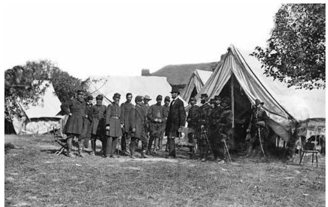
Lincoln and generals at Antietam