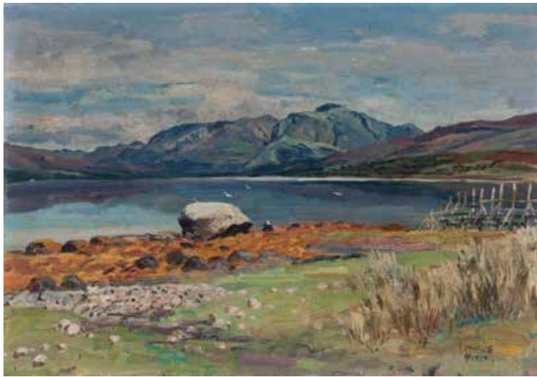
143 JAMES MCINTOSH PATRICK RSA ROI ARE LLD (BRITISH, 1907-1998)

AR Sea-wall and fish boxes signed and dated, oil on board, 30.5 x 38cm (12 x 14 15/16in). £700 - 1,000 €830 - 1,200