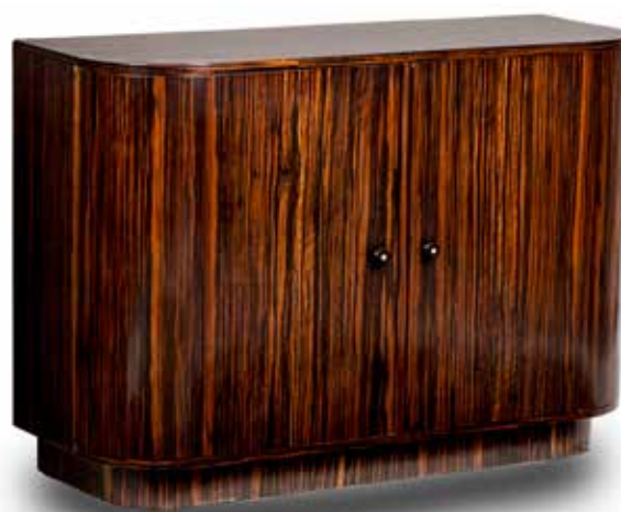
330 AN ENGLISH ART DECO CALAMANDER CABINET IN THE STYLE OF DUNHILL In the style of Dunhill Of rectangular form, with bow-fronted doors, raised on a plinth base, 69cm wide, 28cm deep, 70cm high (27in wide, 11in deep, 27 1/2in high). £400 - 600 €470 - 710