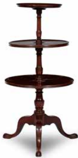
284 A GEORGE III MAHOGANY THREE TIER DUMB WAITER The graduating tiers on turned vase shaped shaft ending in triple arched cabriole supports and pointed pad feet, 124cm high. £500 - 700 €590 - 830