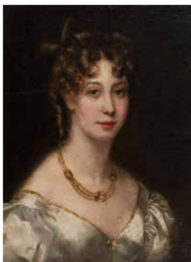
85 CIRCLE OF GEORGE HENRY HARLOW (LONDON 1787-1819) Portrait of a lady, reputed to be Princess Charlotte oil on canvas, 53 x 40cm (20 7/8 x 15 3/4in). £1,000 - 1,500 €1,200 - 1,800

See Bonhams.com for further footnote on this lot