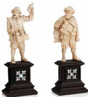
341 A PAIR OF 19TH CENTURY CARVED EUROPEAN IVORY FIGURES Y Of a hurdy gurdy player, and a wine seller, both raised on ebonised plinth bases, 8.5cm wide, 7cm deep, 25cm in diameter, (3in wide, 2 1/2in deep, (9 1/2in in diameter), (2) £800 - 1,200 €950 - 1,400