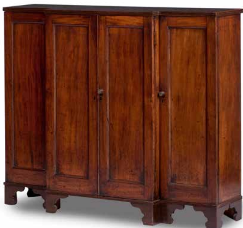
376 A SMALL 19TH CENTURY MAHOGANY BREAKFRONT CUPBOARD The top with reeded edge, the interior fitted with shelves raised on bracket feet, 120cm wide, 32cm deep, 101cm high (47in wide, 12 1/2in deep, 39 1/2in high). £600 - 700 €710 - 830