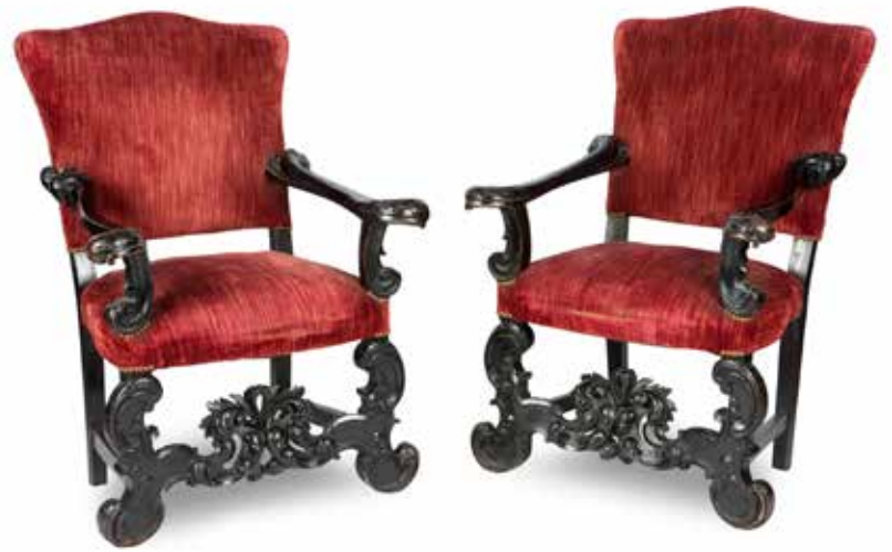
332 A PAIR OF 19TH CENTURY ITALIAN EBONISED PARADE ARMCHAIRS, IN THE BAROQUE TASTE Each with cartouche shaped back and seat upholstered in crimson velvet, the scrolling frame embellished with acanthus details, 81cm wide, 57cm deep, 114cm high (31 1/2in wide, 22in deep, 44 1/2in high). £1,000 - 1,500 €1,200 - 1,800

See Bonhams.com for further footnote on this lot