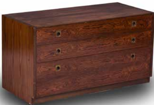
335 A PAIR OF 20TH CENTURY ROSEWOOD CHEST OF DRAWERS, BY HEALS OF Y LONDON Of rectangular form with three sliding drawers with recessed brass handles, and brass makers label to upper drawer, 100cm wide, 45cm deep, 53cm high (39in wide, 17 1/2in deep, 20 1/2in high). £300 - 400 €360 - 470