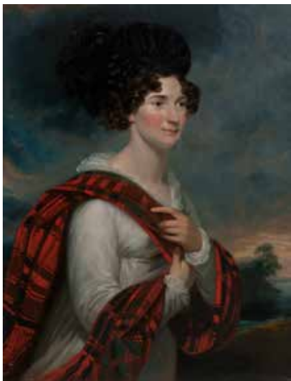
81 SCOTTISH SCHOOL, 19TH CENTURY Helen MacDougall oil on canvas, 90 x 70cm (35 7/16 x 27 9/16in). £2,000 - 3,000 €2,400 - 3,500