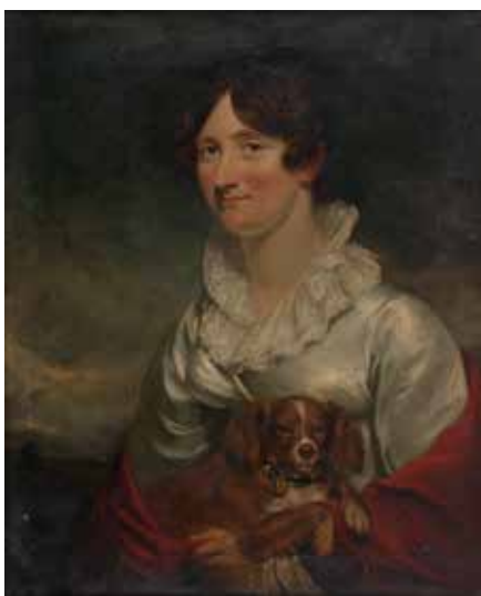
83 SCOTTISH SCHOOL, 19TH CENTURY Susannah MacDougall oil on canvas, 75 x 62.5cm (29 1/2 x 24 5/8in). £800 - 1,200 €950 - 1,400