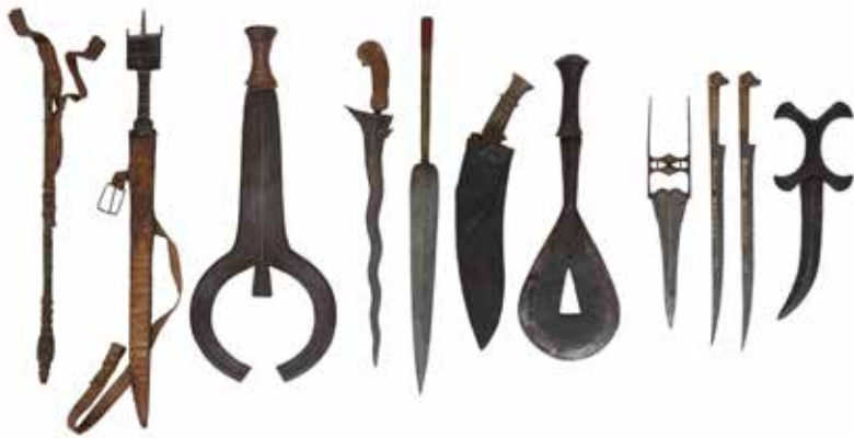
316 A GROUP OF VARIOUS EDGED WEAPONS Comprising a kukri, a kris, a katar, a pair of kard, a spear and five various other blade weapons, leather covered baton, (12). £400 - 800 €470 - 950