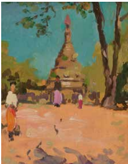
87 SIR GERALD FESTUS KELLY RA, KCVO, PRA (BRITISH, 1879-1972) AR Village Scene, Tuangdingyi oil on board, 16 x 13cm (6 5/16 x 5 1/8in). £800 - 1,200 €950 - 1,400

See Bonhams.com for further footnote on this lot