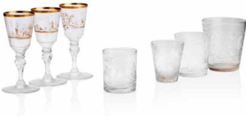
260 SEVEN VARIOUS TUMBLERS AND WINE GLASSES 19th century The tumblers with engraved decoration, the wine glasses with gilt figurative scenes, 8.4cm to 15.9cm high £300 - 500 €360 - 590

See Bonhams.com for further footnote on this lot