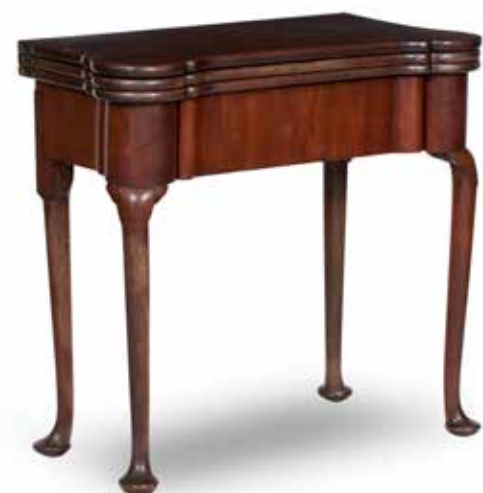
287 A GEORGE II MAHOGANY GAMES/TEA TABLE The folding top with lobed corners enclosing both a baize interior and second top later inlaid with backgammon board, raised on lapetted legs and pad feet, 79cm wide, 39cm deep, 72cm high (31in wide, 15in deep, 28in high). £500 - 700 €590 - 830