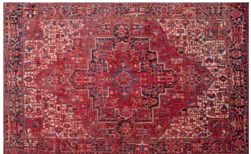
319 A HERIZ CARPET 310 x 419cm £800 - 1,200 €950 - 1,400