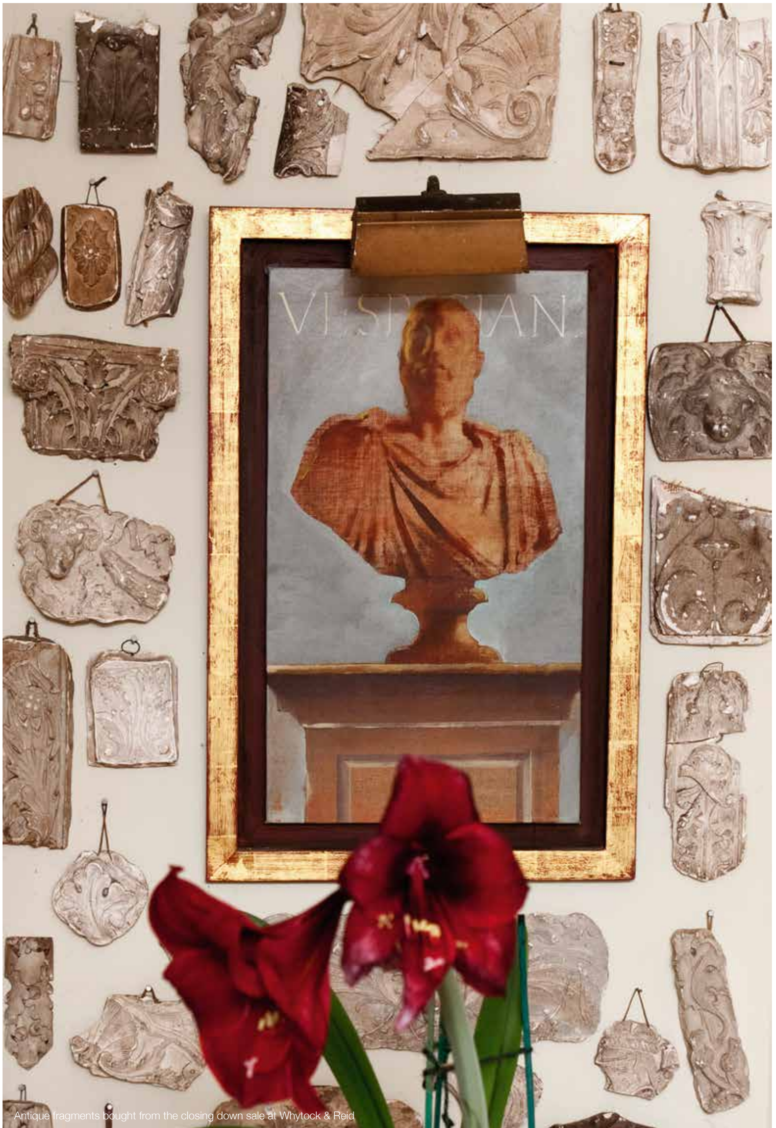
Antique fragments bought from the closing down sale at Whytock & Reid