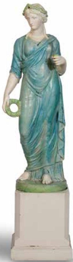
372 A 19TH CENTURY FIRECLAY FIGURE ON STAND DEPICTING THE GODDESS CERES Probably Lindsay and Anderson With painted highlights, the base with impressed mark, 42cm wide, 46cm deep, 173cm high (16 1/2in wide, 18in deep, 68in high) £2,000 - 3,000 €2,400 - 3,500

See Bonhams.com for further footnote on this lot