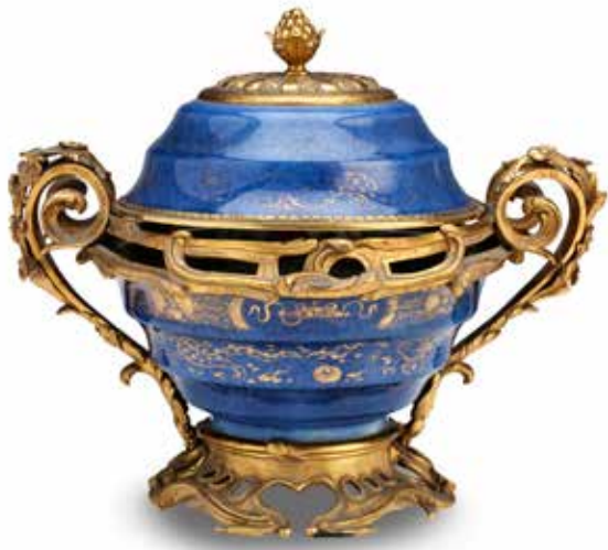
337 A 19TH CENTURY CHINESE PORCELAIN AND LATER ORMOLU-MOUNTED POT POURRI 28cm wide, 20cm deep, 24cm high (11in wide, 7 1/2in deep, 9in high) £400 - 600 €470 - 710