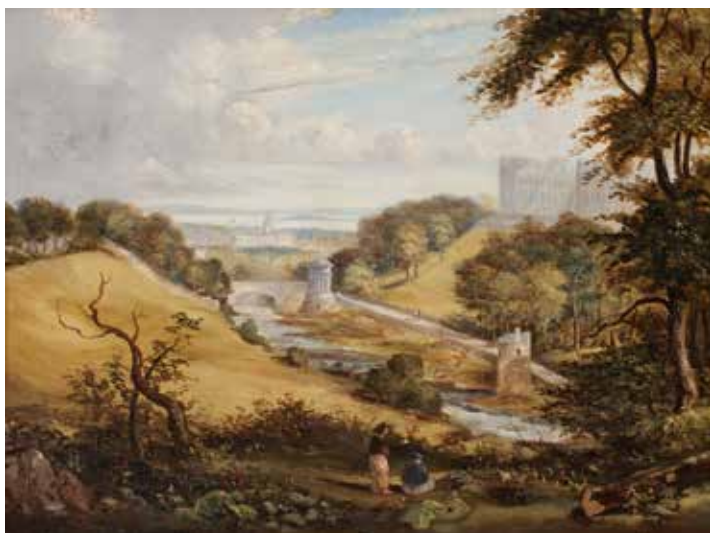
124 SCOTTISH SCHOOL, 19TH CENTURY St Bernard's Well and the Water of Leith oil on panel, 25.5 x 34cm (10 1/16 x 13 3/8in). £400 - 600 €470 - 710