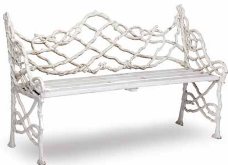
378 A PAIR OF LATE 19TH CENTURY WROUGHT IRON GARDEN BENCHES Framed with a trailing lattice design, one example with damages, 135cm wide. (2) £800 - 1,200 €950 - 1,400