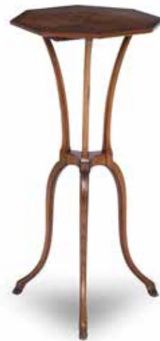
340 A LATE 18TH CENTURY SATINWOOD INLAID OCTAGONAL-TOPPED URN TABLE Fitted with a slide, raised on cabriole legs with painted decoration, 33cm wide, 33cm deep, 71cm high (12 1/2in wide, 12 1/2in deep, 27 1/2in high). £300 - 500 €360 - 590