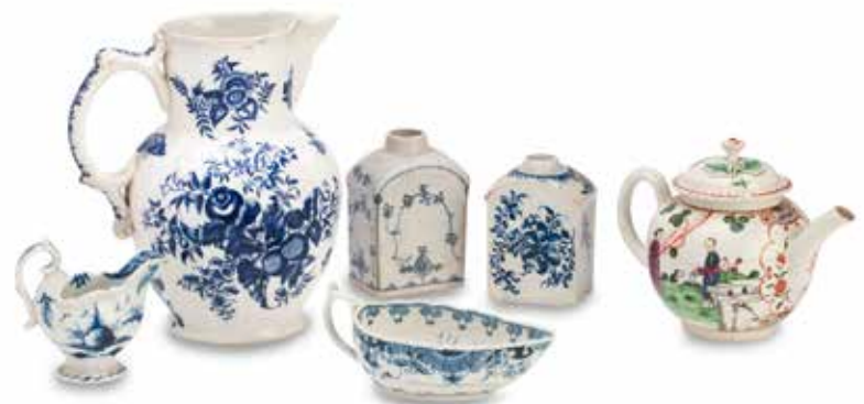
238 A GROUP OF ENGLISH PORCELAIN Circa 1760-80 Including Worcester examples, mask jug 21.6cm high, mask jug and floral caddy with crescent mark (6) £400 - 500 €470 - 590

See Bonhams.com for further footnote on this lot