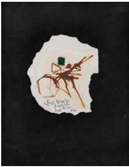
120 GEORGES MATHIEU (FRENCH, 1921-2012), 1964 AR Emeraude signed and dated, mixed media, 28.5 x 23cm (11 1/4 x 9 1/16in). £1,200 - 1,800 €1,400 - 2,100

See Bonhams.com for further footnote on this lot