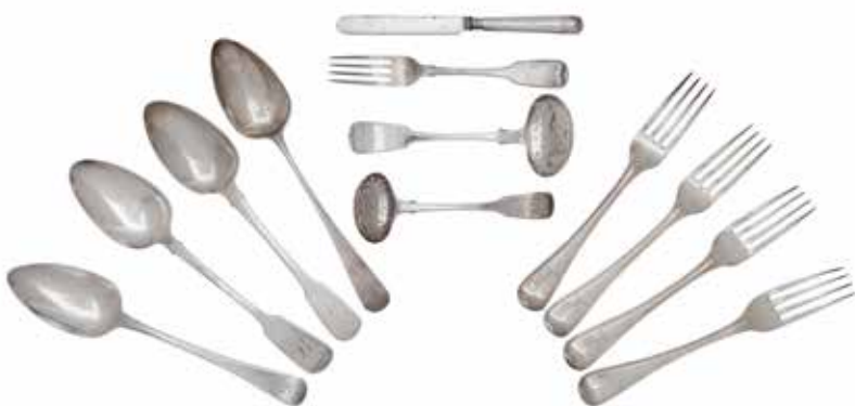
27 A COLLECTION OF 19TH CENTURY SILVER FLATWARE various makers and dates To include a set of six Old English thread pattern dinner forks, by Eley, Fearn & Chawner, London 1808, eight tablespoons, two sifter ladles, etc, weight 39.8oz. £300 - 400 €360 - 470