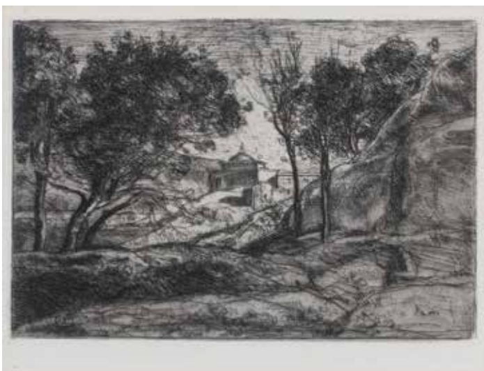
91 JEAN-BAPTISTE-CAMILLE COROT (FRENCH, 1796-1875) Souvenir de Toscane etching, 13 x 18cm (5 1/8 x 7 1/16in). £100 - 150 €120 - 180

See Bonhams.com for further footnote on this lot