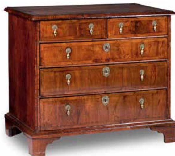
326 AN MID-18TH CENTURY WALNUT CHEST The moulded quarter veneered top with crossbanded and herringbone banding over two short and three long graduated drawers, on shaped bracket feet, 97cm wide, 57cm deep, 88cm high (38in wide, 22in deep, 34 1/2in high). £800 - 1,200 €950 - 1,400

See Bonhams.com for further footnote on this lot