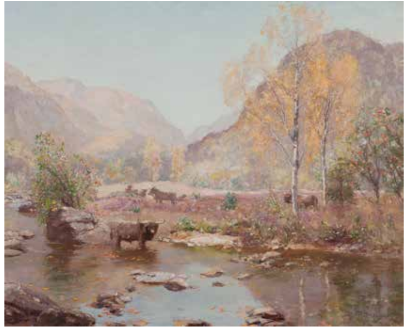
117 SIR DAVID MURRAY, R.A., R.S.A., P.R.I., R.S.W. (BRITISH, 1849-1933) Autumn Gently Tints the Glen signed, dated and inscribed, oil on canvas, 77 x 92cm (30 5/16 x 36 1/4in). £1,000 - 1,500 €1,200 - 1,800