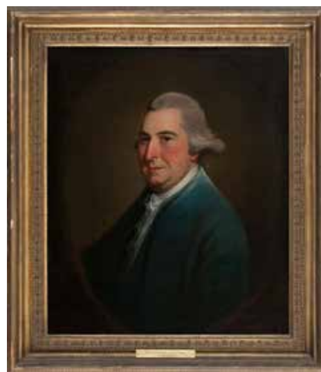
84 DAVID MARTIN (ANSTRUTHER 1737-1797 EDINBURGH) Half-length portrait of John Howard in blue coat oil on canvas, 72.5 x 60.5cm (28 9/16 x 23 13/16in) £1,000 - 1,500 €1,200 - 1,800

See Bonhams.com for further footnote on this lot