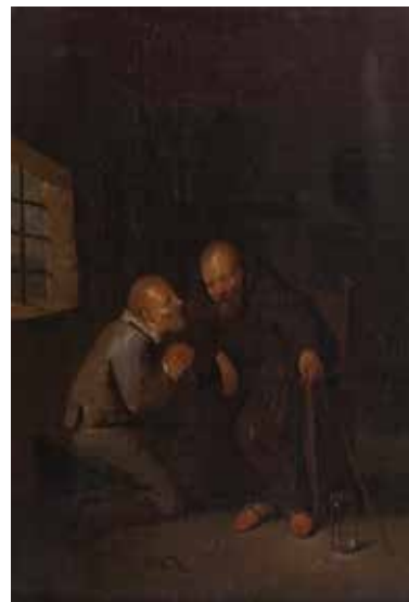
136 EGBERT VAN HEEMSKERCK (DUTCH, CIRCA 1676-CIRCA 1744) Final Confession oil on canvas laid on board, 30 x 21 cm (11 13/16 x 8 1/4 in.) £800 - 1,200 €950 - 1,400

See Bonhams.com for further footnote on this lot