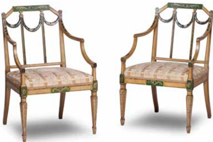
364 A PAIR OF GEORGE III PAINTED ARMCHAIRS Each decorated with floral swags, with upholstered seat, raised on square tapering front legs and spade feet, 57cm wide, 50cm deep, 90cm high (22in wide, 19 1/2in deep, 35in high). (2) £300 - 500 €360 - 590