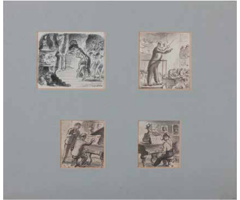
160 EDWARD ARDIZZONE (BRITISH, 1900-1979) Four vignettes of music hall scenes signed, watercolour, the largest: 10 x 9cm (3 15/16 x 3 9/16in). £1,000 - 1,500 €1,200 - 1,800