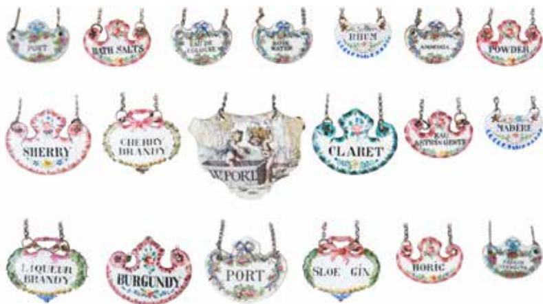
237 A COLLECTION OF ENAMEL AND PORCELAIN WINE LABELS Various dates Including a Battersea enamel bottle ticket marked for W.Port, circa 1755, (damaged), together with a variety of English and French labels, (19) £500 - 700 €590 - 830

See Bonhams.com for further footnote on this lot