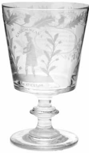
256 A LARGE CALEDONIAN WATERLOO RUMMER Circa 1821 With engraved decoration, 21cm high £500 - 800 €590 - 950

See Bonhams.com for further footnote on this lot