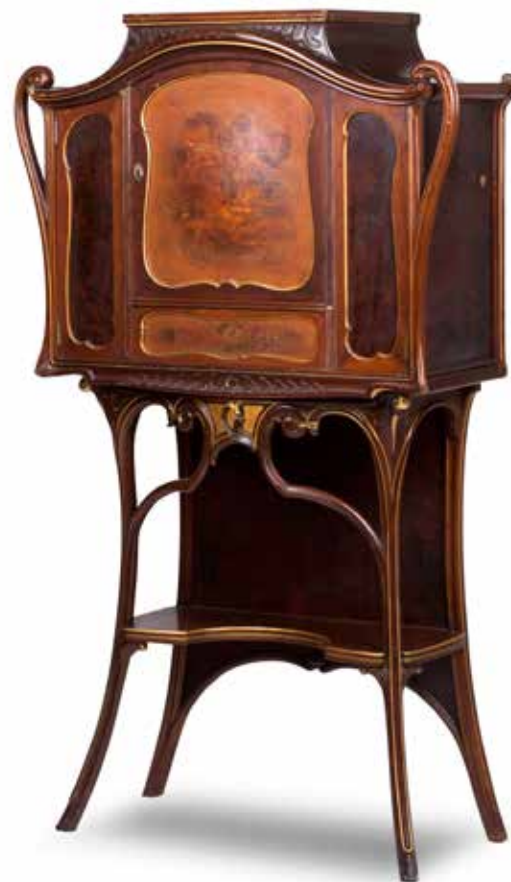
373 A PARCEL GILT MAHOGANY AND VERNIS MARTIN STYLE CABINET-ON-STAND, FIRST HALF OF THE 20TH CENTURY With single shaped door, decorated with a depiction of putti enclosing recesses raised on a stand of scrolling cabriole legs and shaped undertier, 100cm wide, 44cm deep, 185cm high (39in wide, 17in deep, 72 1/2in high). £300 - 500 €360 - 590

See Bonhams.com for further footnote on this lot