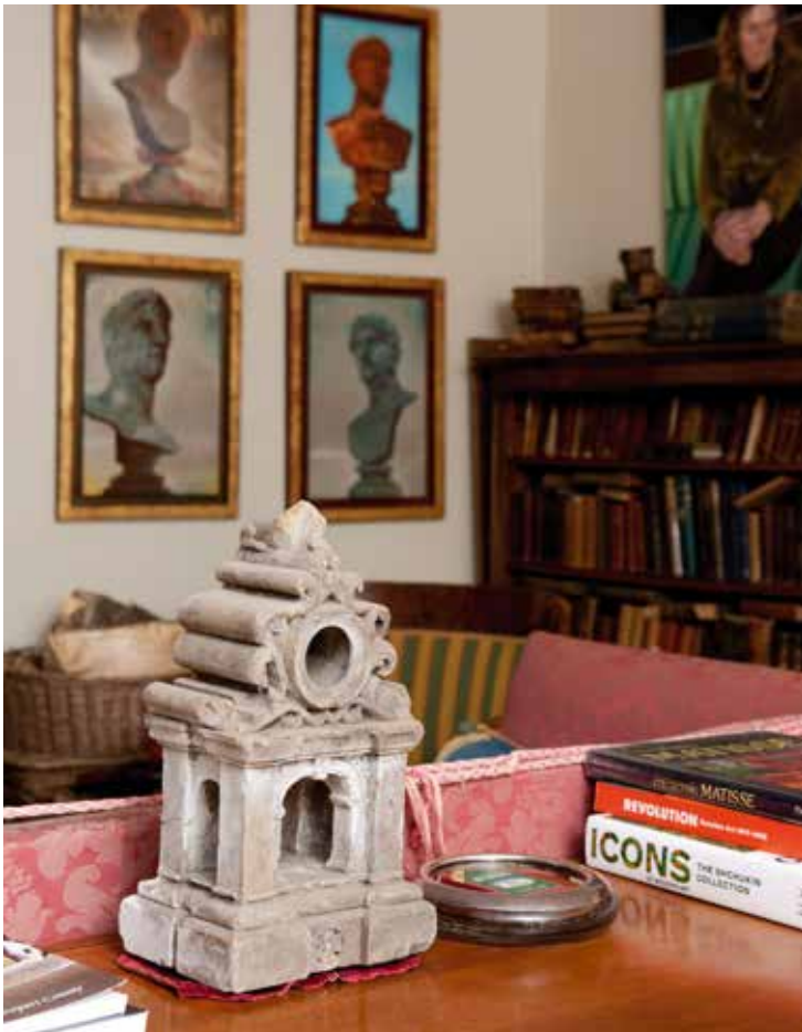
Above: The drawing room with Hugh's series of Roman emperors