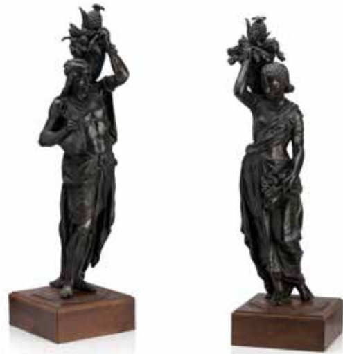
361 A PAIR OF LATE 19TH CENTURY SPELTER FIGURES Both modelled in the form of male and female African figures carrying baskets aloft with fruit each raised on a square oak base, 23cm wide, 24cm deep, 83cm high (9in wide, 9in deep, 32 1/2in high) £400 - 600 €470 - 710