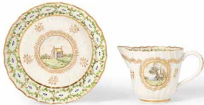
236 A CAUGHLEY POLYCHROME MILK JUG AND A SAUCER Circa 1790 Painted at the Chamberlain factory in Worcester with a version of the 'Landscape' pattern, the jug with two round landscapes, jug 8.5cm high £150 - 200 €180 - 240

See Bonhams.com for further footnote on this lot