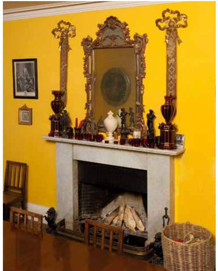
Above: The dining room painted Imperial Chinese yellow with its mahogany table

to the 40-year Buchanan rule, he estimates that by 2020, the current infatuation with modernism will peter out and we will be experiencing another burst of traditionalism.