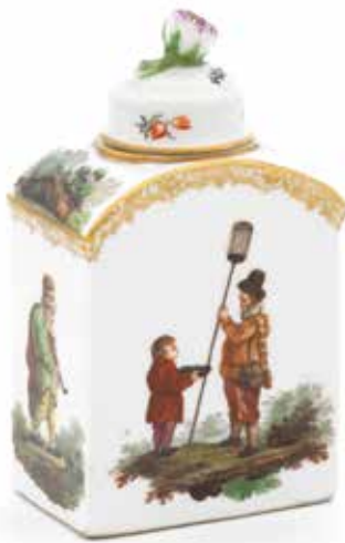
168 A MEISSEN TEA CANISTER AND COVER Circa 1760 Each side painted with a landscape vignette with large figures of peasants below a border of gilt scrollwork, 12.5cm high, blue crossed swords mark £600 - 900 €710 - 1,100

See Bonhams.com for further footnote on this lot