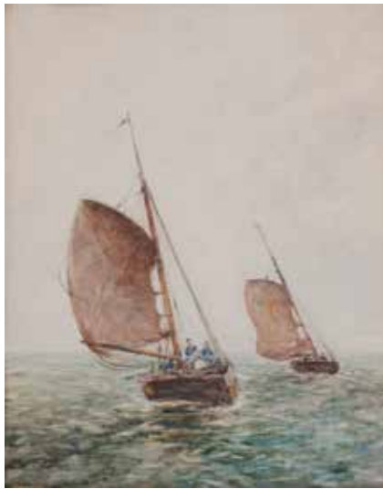
122 WILLIAM MCTAGGART RSA RSW (BRITISH, 1835-1910) Tarbert, Loch Fyne watercolour, 38 x 30.5cm (14 15/16 x 12in). £800 - 1,200 €950 - 1,400

See Bonhams.com for further footnote on this lot