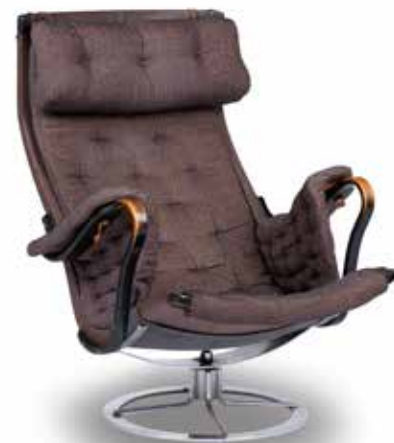
336 BRUNO MATHSSON JETSON, AN EASY CHAIR With chromed swivel base and fabric upholstered seat, 65cm wide, 71cm deep, 100cm high (25 1/2in wide, 27 1/2in deep, 39in high). £500 - 800 €590 - 950