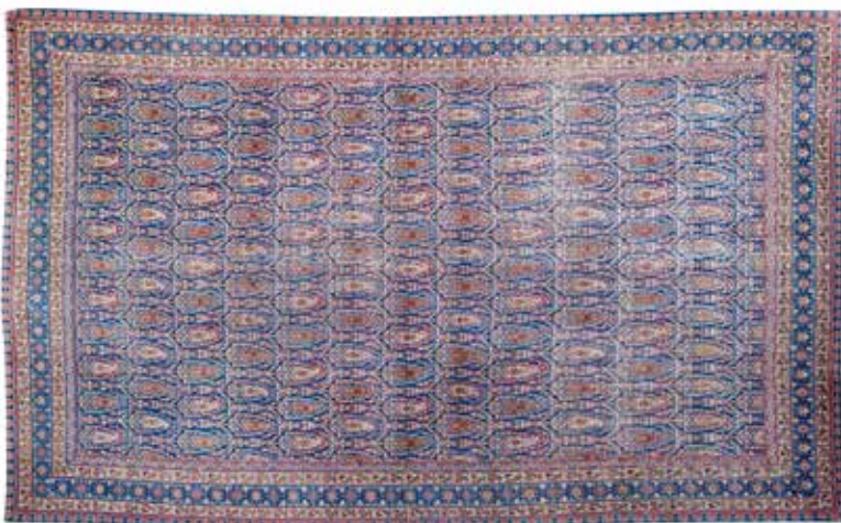
318 AN AFSHAR STYLE CARPET 371cm x 266cm £200 - 300 €240 - 360