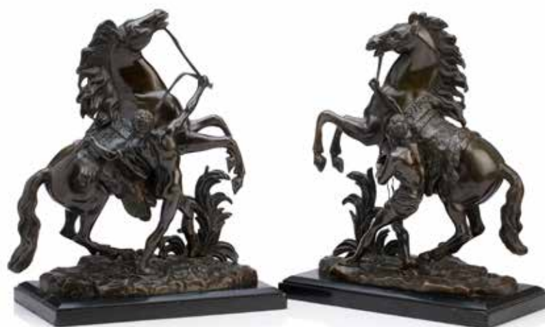
377 AFTER GUILLAUME COUSTOU (FRENCH, 1677-1746): A PAIR OF LARGE LATE 19TH CENTURY PATINATED BRONZE MODELS OF 'THE MARLEY HORSES' Raised on naturalistic oval bases, inscribed 'Coustou' on rectangular slate plinths, 38cm wide, 18cm deep, 42cm high (14 1/2in wide, 7in deep, 16 1/2in high) £1,000 - 1,500 €1,200 - 1,800