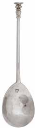
23 A CHARLES I SILVER SEAL TOP SPOON with maker's mark of R.C, pellets above and star below, London 1634 Of conventional form, length 17cm, weight 1.6oz. £600 - 800 €710 - 950