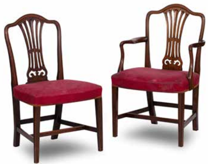
283 A SET OF EIGHT MAHOGANY GEORGE III DINING CHAIRS The yoke-shaped top rail above a pierced splat, the seat upholstered in red damask and raised on channel-moulded tapering legs united by stretchers, including two carvers, 59cm wide, 50cm deep, 96cm high (23in wide, 19 1/2in deep, 37 1/2in high). (8) £500 - 800 €590 - 950