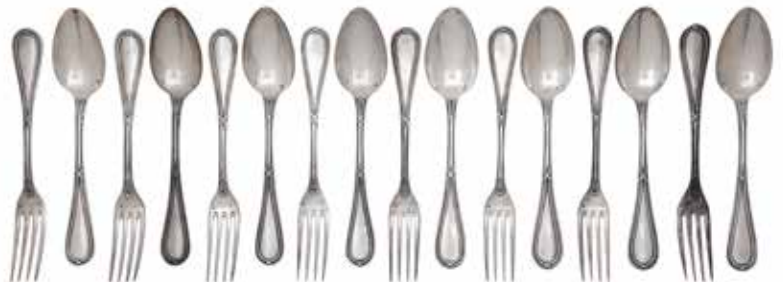
26 A SET OF EIGHT EARLY 20TH CENTURY SILVER TABLESPOONS AND DINNER FORKS by Olier & Caron, Paris Of reeded and cross pattern, weight 43.2oz. (16) £300 - 500 €360 - 590 See Bonhams.com for further footnote on this lot