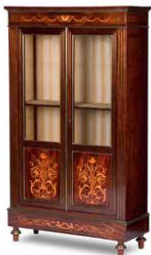
327 A 19TH CENTURY MAHOGANY MARQUETRY AND BRASS INLAID DISPLAY CABINET With twin cupboard door fitted with adjustable shelves raised on bun feet, 91cm wide, 35cm deep, 157cm high (35 1/2in wide, 13 1/2in deep, 61 1/2in high). £600 - 800 €710 - 950