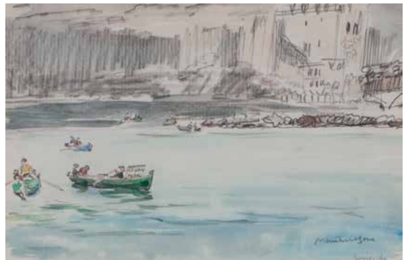
162 SIR MUIRHEAD BONE HRSA HRWS HARIBA HRE LLB D LITT (BRITISH, 1867-1953) AR Sorrento signed and inscribed, watercolour and pencil, 13 x 20.5cm (5 1/8 x 8 1/16in). £200 - 300 €240 - 360