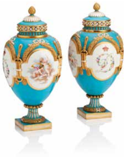
233 A PAIR OF MINTON PORCELAIN POT POURRI VASES WITH COVERS Circa 1860 With turquoise ground, the panels decorated with putti and floral swags forming the letter D, with pierced covers, 30.2cm high, puce printed factory marks £500 - 600 €590 - 710