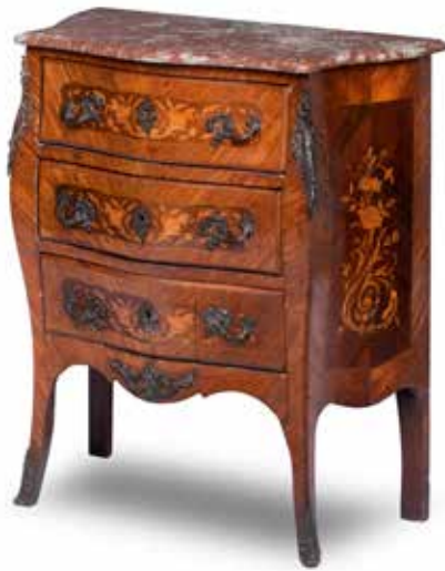
333 A LATE 19TH CENTURY FRENCH KINGWOOD, ROSEWOOD AND MARQUETRY Y PETITE COMMODOE With shaped moulded red marble top, with three drawers on cabriole legs, 75cm wide, 41cm deep, 86cm high (29 1/2in wide, 16in deep, 33 1/2in high). £500 - 800 €590 - 950

See Bonhams.com for further footnote on this lot