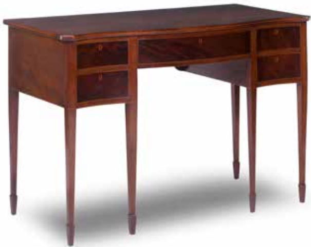
339 A GEORGE III STYLE MAHOGANY SERPENTINE WRITING DESK, 19TH CENTURY Fitted with five drawers raised on square tapering legs with spade feet, 105cm wide, 52cm deep, 75cm in diameter, (41in wide, 20in deep, (29 1/2in in diameter), £300 - 400 €360 - 470