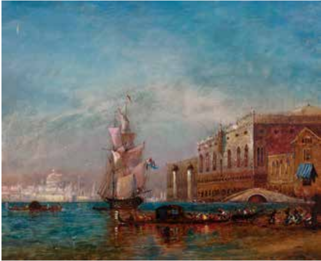
96 MANNER OF FÉLIX FRANÇOIS GEORGES PHILIBERT ZIEM Ships by St Marks, Venice oil on canvas, 62 x 75cm (24 7/16 x 29 1/2in). £500 - 700 €590 - 830