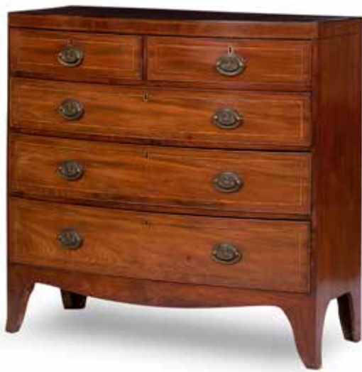
331 A REGENCY MAHOGANY, ROSEWOOD CROSSBANDED AND BOXWOOD LINE Y INLAID BOWFRONT CHEST The frieze fitted with two short above two long graduated drawers, on splayed bracket feet, 150cm wide, 51.5cm deep, 145cm high (59in wide, 20in deep, 57in high). £300 - 500 €360 - 590