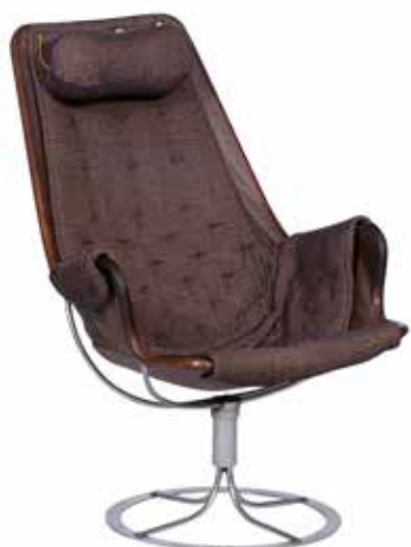
329 BRUNO MATHSSON JETSON AN EASY CHAIR With chromed swivel base and fabric upholstered seat, 86cm wide, 85cm deep, 97cm high (33 1/2in wide, 33in deep, 38in high). £500 - 800 €590 - 950