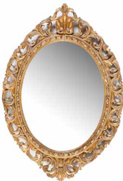
One of a pair