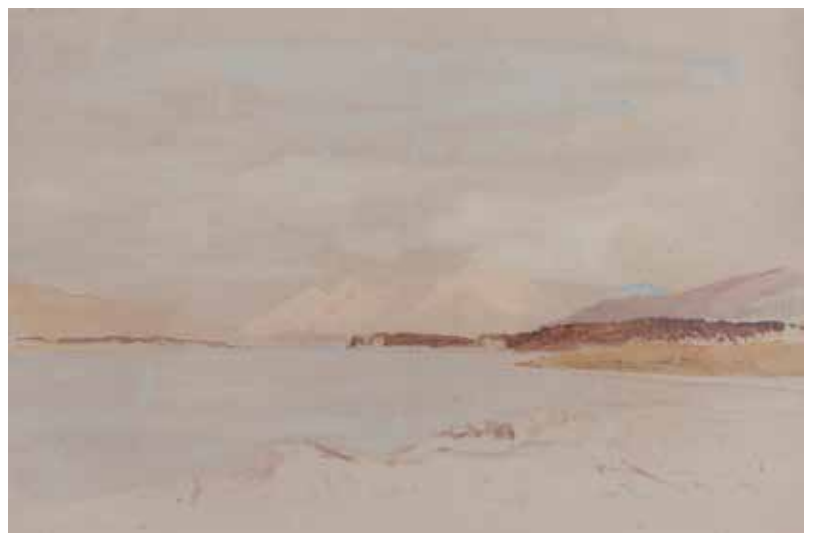
110 SIR DAVID YOUNG CAMERON RA RSA RWS RSW RE (BRITISH, 1865-1945) Loch Leven and Paps of Glencoe signed, watercolour, 34 x 51cm (13 3/8 x 20 1/16in). £400 - 600 €470 - 710

See Bonhams.com for further footnote on this lot