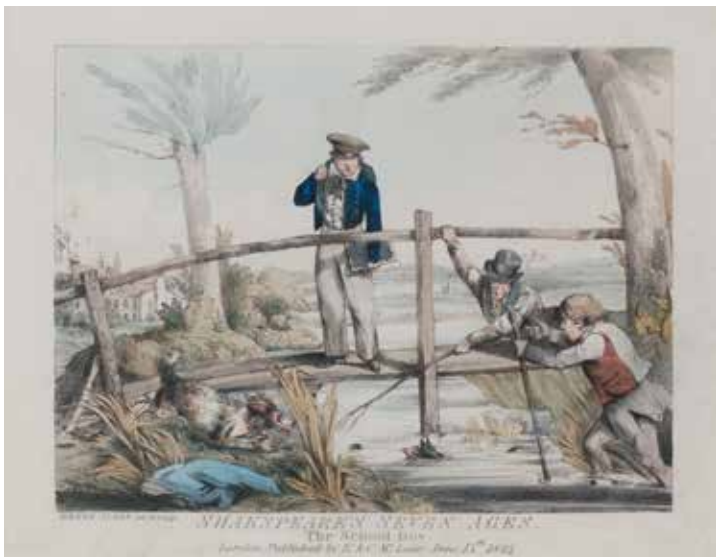
163 HENRY ALKEN (BRITISH 1785-1851) Seven Ages of Man engravings, each: 24 x 29cm (9 7/16 x 11 7/16in). (8) £800 - 1,000 €950 - 1,200