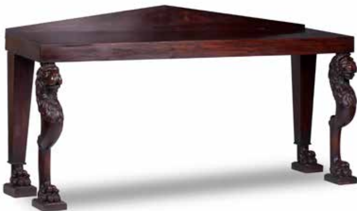
286 A MAHOGANY SCOTTISH REGENCY SERVING TABLE With angular backboard raised on lion carved front legs with block supports, 206cm wide, 110cm deep, 57cm high (81in wide, 43in deep, 22in high). £3,000 - 5,000 €3,500 - 5,900