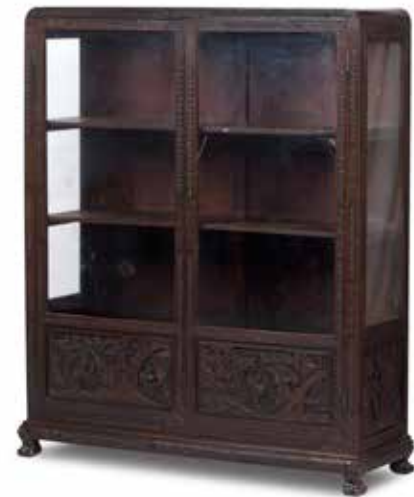
334 AN ORIENTAL HARDWOOD DISPLAY CABINET, POSSIBLY BURMESE With carved decoration fitted with two shelves within glazed side, on bracket feet, 122cm wide, 41cm deep, 152cm high (48in wide, 16in deep, 59 1/2in high). £300 - 400 €360 - 470