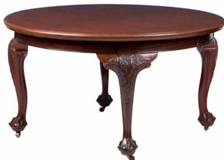
379 A LATE VICTORIAN MAHOGANY TELESCOPIC DINING TABLE The rounded top with moulded edge, raised on carved cabriole legs, ball and claw feet and brass castors, with three additional leaves, 300cm wide, 134cm deep, 75cm high (118in wide, 52 1/2in deep, 29 1/2in high). £400 - 600 €470 - 710