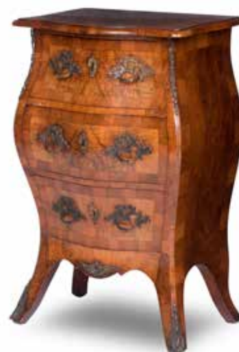
328 A LATE 19TH/EARLY 20TH CENTURY FRENCH WALNUT GILT METAL MOUNTED PETITE COMMUNE With three drawers raised on played legs, 54cm wide, 42cm deep, 85cm high (21in wide, 16 1/2in deep, 33in high). £400 - 600 €470 - 710