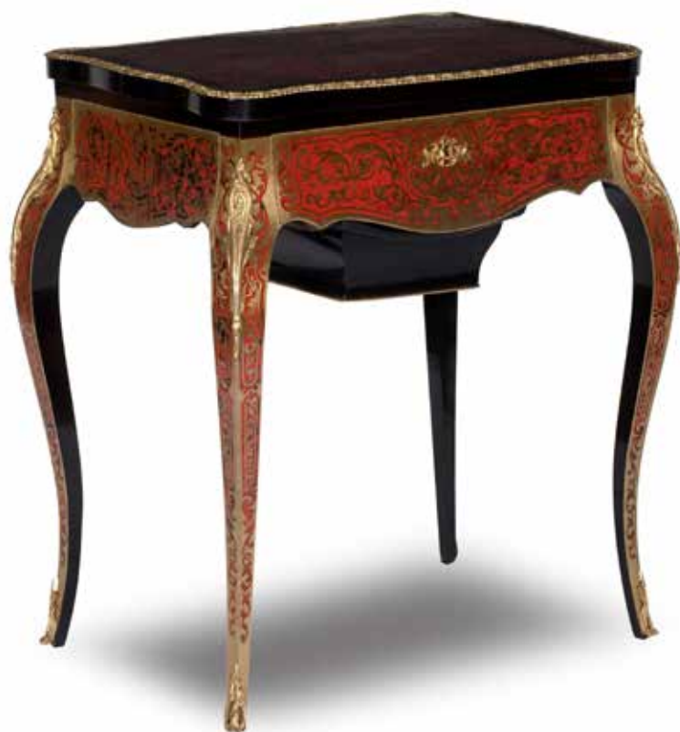
374 A FRENCH LATE 19TH CENTURY/EARLY 20TH CENTURY TORTOISESHELL AND BOULLE WORK DESK Φ The ebonised undulating rectangular hinged top with boulle work and tortoiseshell inlay, the fitted interior with mirror and pull out work slide and applied brass mounts raised on cabriole legs together with a 20th century tortoiseshell and cut brass boulle three-tier etagere with raised brass gallery, finials and cabriole legs, 63.5cm wide, 44cm deep, 75cm high (25in wide, 17in deep, 29 1/2in high). £800 - 1,200 €950 - 1,400