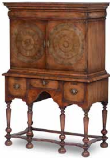
362 AN EARLY 20TH CENTURY OYSTER VENEERED WALNUT CABINET-ON-STAND With moulded cornice above a single and pair of cupboard doors each inlaid with radiating veneers, with fitted interior, the base fitted with three drawers raised on turned legs, with shaped stretchers, 94cm wide, 47cm deep, 140cm high (37in wide, 18 1/2in deep, 55in high). £400 - 600 €470 - 710