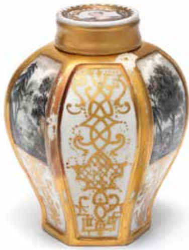
165 A MEISSEN HAUSMALER TEA CANISTER AND A COVER Circa 1730 Decorated in Augsburg, the cover with a lady's portrait, 10.3cm high £600 - 800 €710 - 950

See Bonhams.com for further footnote on this lot