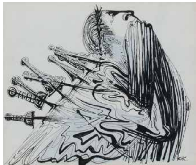
88 CHARLES KEEPING (1924-1988) AR Heathcliff signed with initials, lithograph, 12 x 12cm (4 3/4 x 4 3/4in). together with another by the same hand. (2) £800 - 1,200 €950 - 1,400

See Bonhams.com for further footnote on this lot