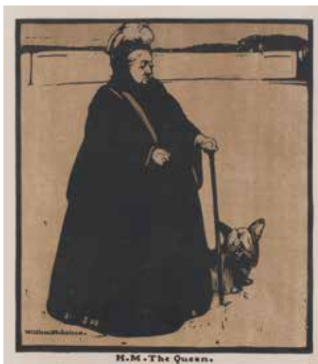
164 AFTER SIR WILLIAM NICHOLSON Queen Victoria and Prince Albert lithographs, 26.5 x 25cm (10 7/16 x 9 13/16in). (2) £100 - 150 €120 - 180