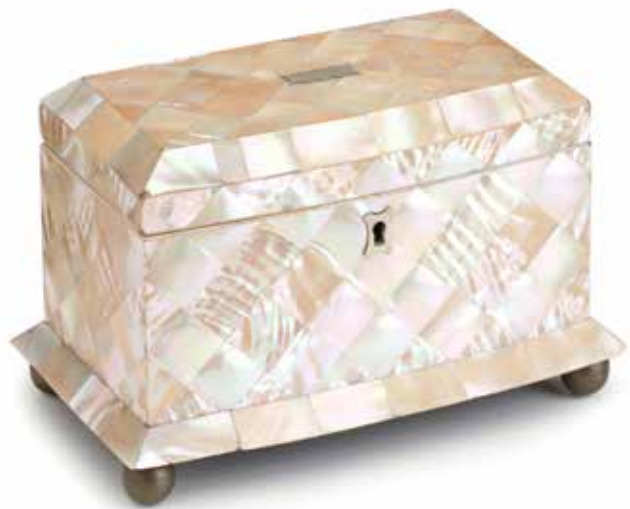
338 A LATE 19TH CENTURY MOTHER-OF-PEARL TEA CADDY Y Of rectangular form the interior with twin lidded compartments raised on a plinth with bun feet, 20cm wide, 12cm deep, 13cm high (7 1/2in wide, 4 1/2in deep, 5in high) £300 - 400 €360 - 470