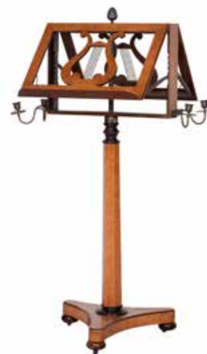
285 A 19TH CENTURY BURR WALNUT ADJUSTABLE DUET MUSIC STAND Raised on a hexagonal column, on shaped base with bun feet and castors, 50cm wide, 50cm deep, 118cm high (19 1/2in wide, 19 1/2in deep, 46in high). £600 - 800 €710 - 950