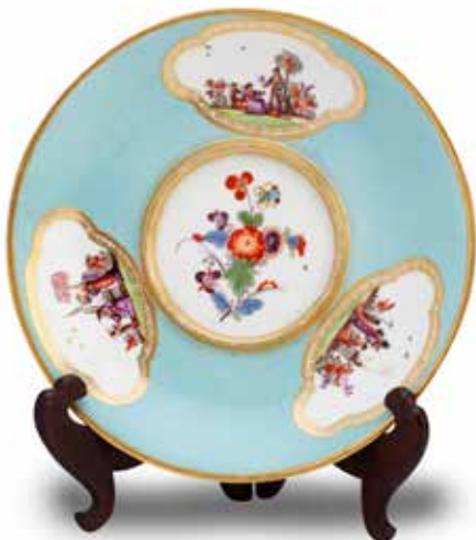
169 A MEISSEN CELADON GROUND STAND Circa 1740 The three quatrelobe reserves painted with chinoiserie figurative scenes, the well with a floral spray, 17cm diameter, underglaze blue crossed swords £400 - 600 €470 - 710

See Bonhams.com for further footnote on this lot