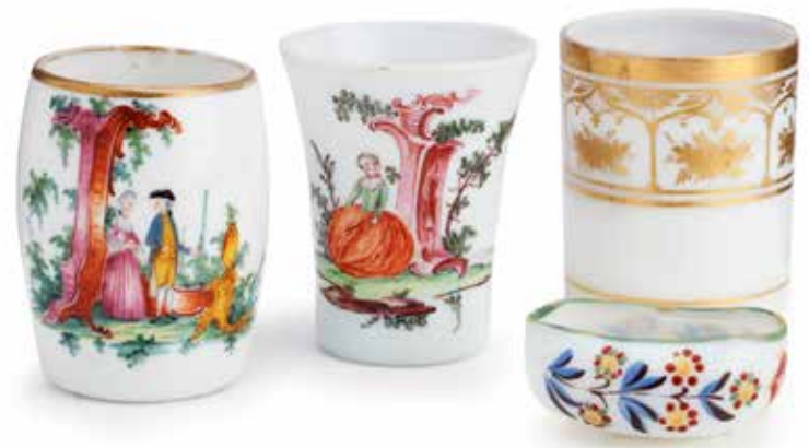
261 FOUR PIECES OF MILCHGLAS 18th century Comprising a tumbler and small tankard, circa 1780, a small bowl or 'maigelein', and a gilt decorated tumbler, tankard 9.7cm high, bowl 8cm wide £300 - 500 €360 - 590

See Bonhams.com for further footnote on this lot