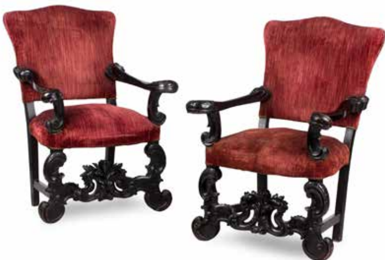
325 A PAIR OF 19TH CENTURY ITALIAN EBONISED PARADE ARMCHAIRS, IN THE BAROQUE TASTE Each with cartouche shaped back and seat upholstered in crimson velvet, the scrolling frame embellished with acanthus details, 73cm wide, 56cm deep, 103cm high (28 1/2in wide, 22in deep, 40 1/2in high). (2) £1,000 - 1,500 €1,200 - 1,800

See Bonhams.com for further footnote on this lot