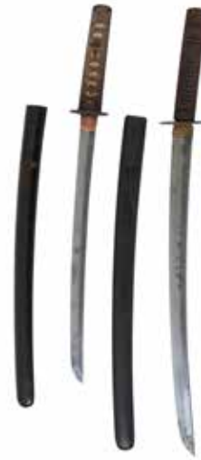
317 A LATE 19TH/EARLY 20TH CENTURY WAKIZASHI In black lacquered saya, together with another similar example, (2). £400 - 600 €470 - 710