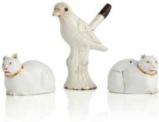
235 A CREAMWARE BIRD WHISTLE, CIRCA 1760-80, TOGETHER WITH A PAIR OF DERBY MODELS OF CATS The whistle in the shape of a bird on a stump, 9.2cm high, the reclining cats with gilt collars, 6.2cm long (3) £250 - 350 €300 - 410

See Bonhams.com for further footnote on this lot