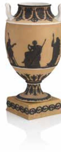
234 A WEDGWOOD JASPERWARE TWIN HANDLED VASE 19th century The mustard yellow ground with a relief moulded brown classical frieze, with further anthemion and foliate motifs, (no cover), 34cm high, impressed WEDGWOOD £100 - 200 €120 - 240