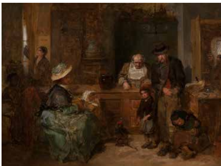
137 THOMAS FAED RA HRSA (BRITISH, 1826-1900) From Hand to Mouth signed and dated, oil on canvas, 44.5 x 57.5 cm. (17 1/2 x 22 5/8 in.) £2,000 - 3,000 €2,400 - 3,500

See Bonhams.com for further footnote on this lot