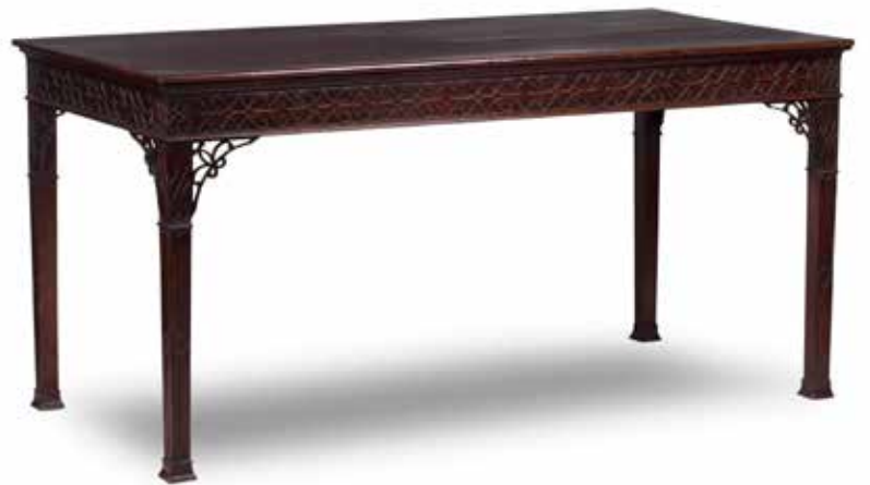
363 A 19TH CENTURY MAHOGANY SERVING TABLE The rectangular top above a blind fretwork carved frieze, and square tapering legs with spade feet, 181cm wide, 89cm deep, 90cm high (71in wide, 35in deep, 35in high). £800 - 1,200 €950 - 1,400