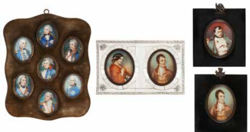
342 A GROUP OF LATE 19TH EARLY 20TH CENTURY PORTRAIT MINIATURES Y To include seven portraits of Nelson and his admirals mounted as a group, a pair of Robert Burns and a female subject mounted together, and a pair of images of Robert Burns and Napoleon, (4) £300 - 400 €360 - 470