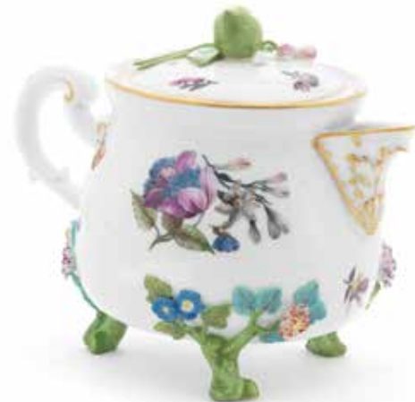
170 A MEISSEN CREAM POT AND COVER Circa 1745 On three branch feet with flower terminals, painted with flower sprigs, cover with flower bud finial, 12.5cm high, blue crossed swords £800 - 1,200 €950 - 1,400

See Bonhams.com for further footnote on this lot