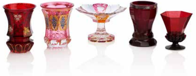
259 FIVE VARIOUS BOHEMIAN GLASSES 19th century Including tumblers, a jelly glass and a small tazza, tazza 9.5cm high, 15.5cm diameter (5) £300 - 500 €360 - 590

See Bonhams.com for further footnote on this lot