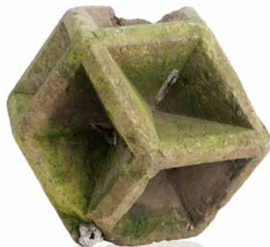
375 A MULTI-FACETED SANDSTONE SUNDIAL, NORTH-EAST SCOTLAND Of dodecagon form, the inset areas forming dials, weathered and algaed, 34cm wide, 36cm deep, 44cm high (13in wide, 14in deep, 17in high) £300 - 500 €360 - 590

See Bonhams.com for further footnote on this lot