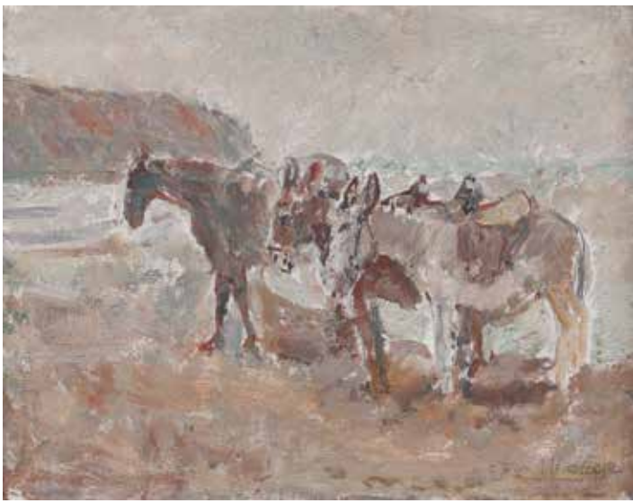
141 DAME ETHEL WALKER ARA RBA RP DBE (BRITISH, 1861-1951)

AR Donkeys on the Sand signed, oil on panel, 29 x 36.5cm (11 7/16 x 14 3/8in). £800 - 1,200 €950 - 1,400