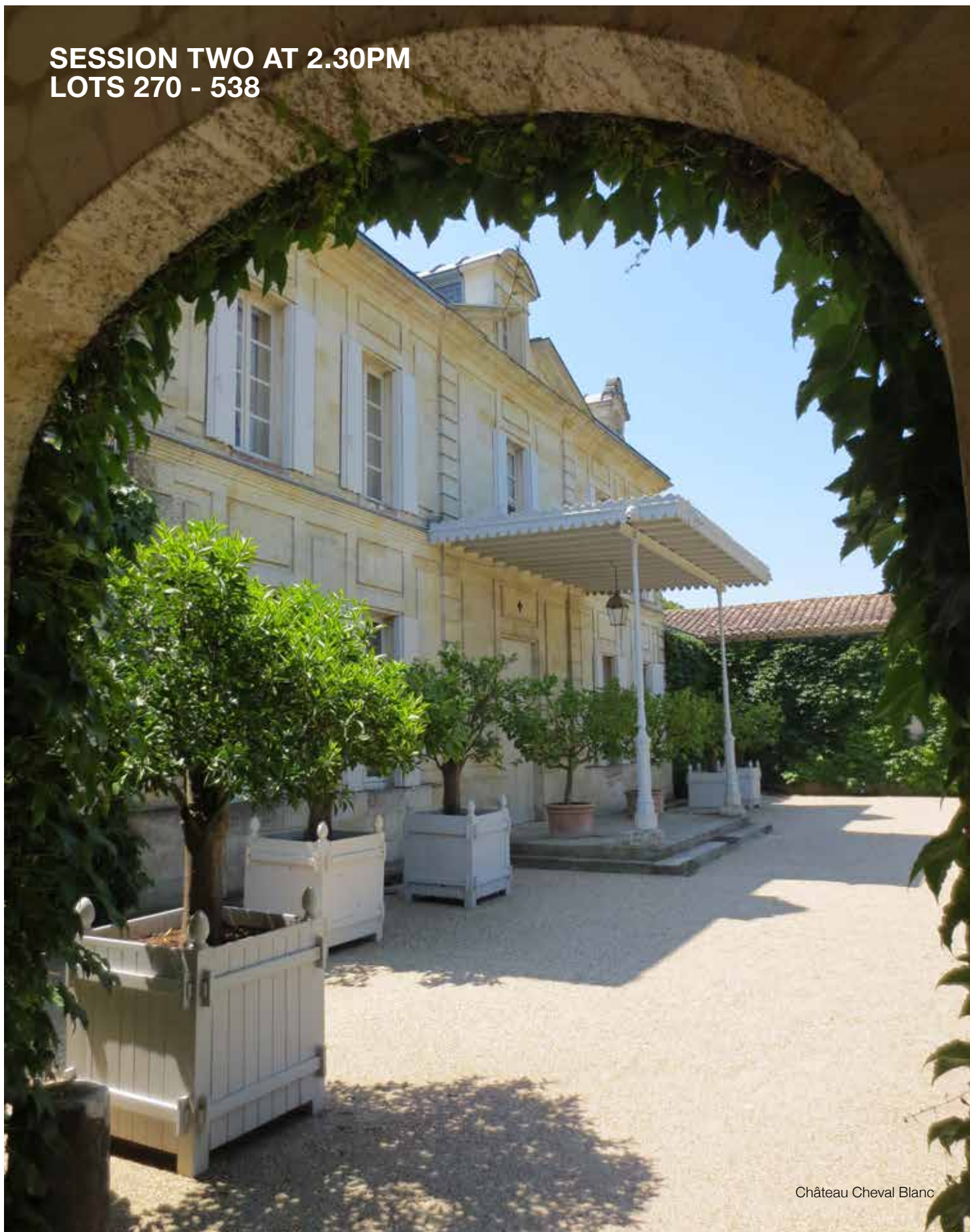
Château Cheval Blanc