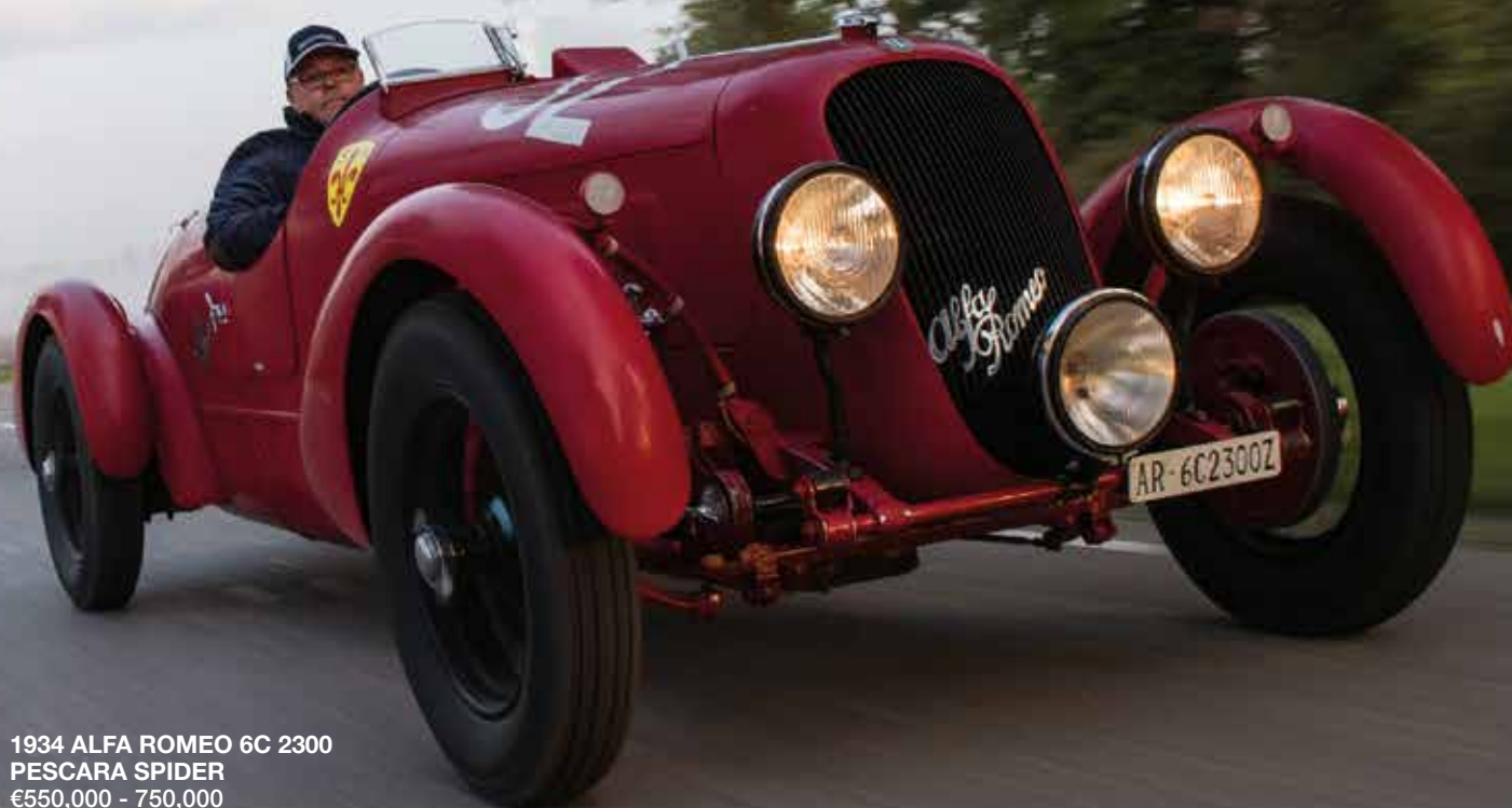
1934 ALFA ROMEO 6C 2300 PESCARA SPIDER €550,000 - 750,000