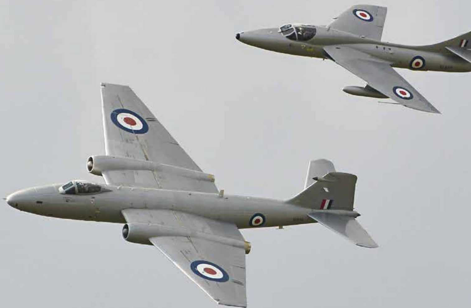
The Midair Squadron perform a masterful air display at the Goodwood Revival Meeting, 2014