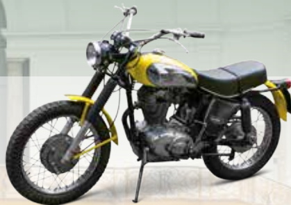
1972 DUCATI SCRAMBLER 450 €9,800 - 14,000

Europe +33 (0) 142 611 011 eumotorcycles@bonhams.com