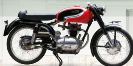
1956 PARILLA 175CC €5,600 - 7,000