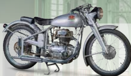
1949 MONDIAL 125CC SPORT €7,000 - 10,000