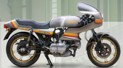
1983 DUCATI 900 S2 €7,000 - 9,700