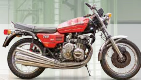
1976 BENELLI 750CC SEI €14,000 - 19,000