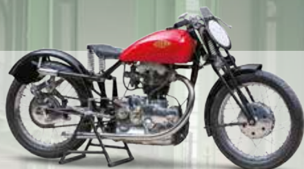
1948 GILERA SATURNO €11,000 - 16,000