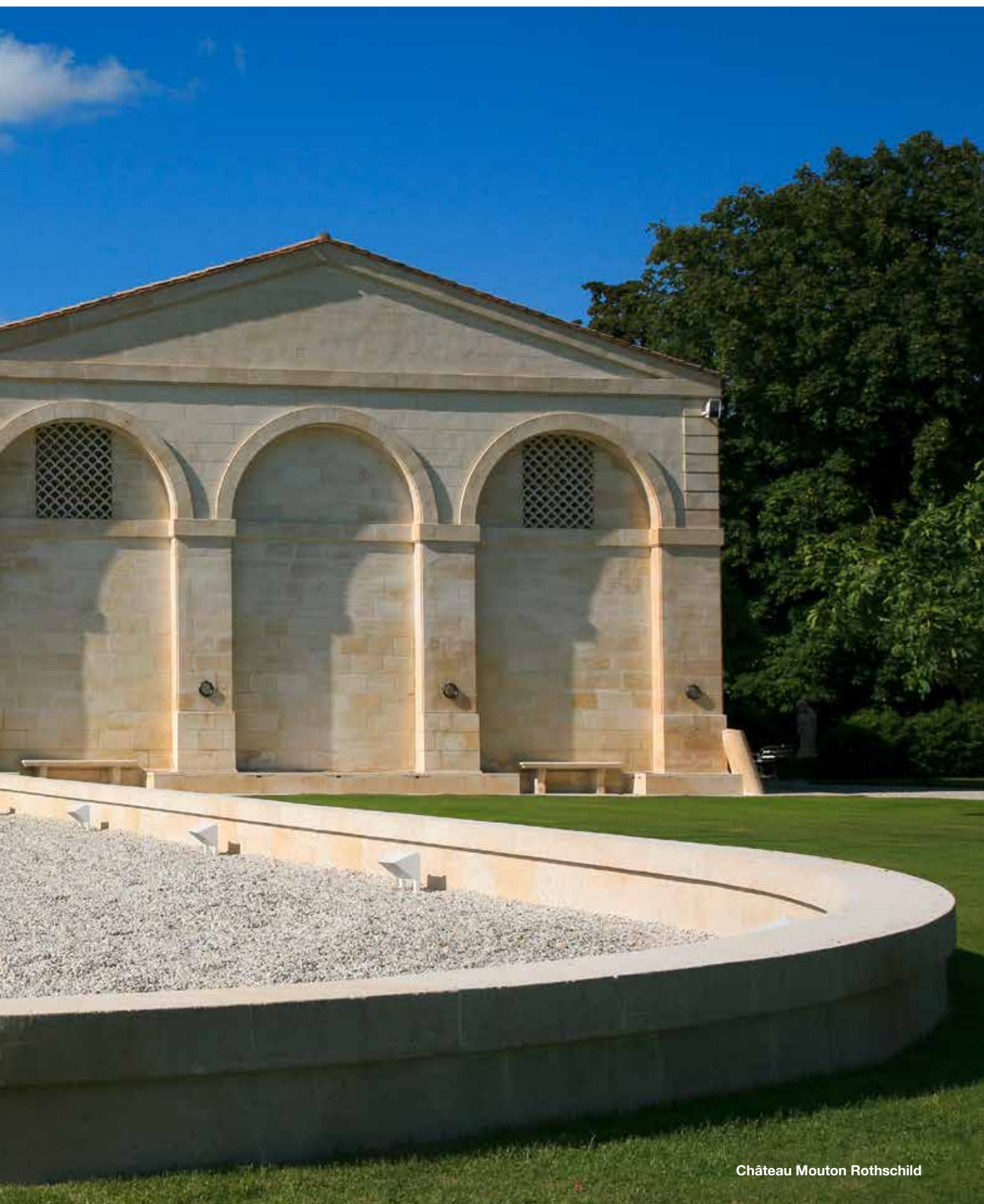
Château Mouton Rothschild