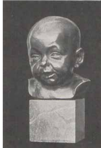
Bronze bust of Baby, the first of Kämmer & Reinhardt's character dolls.