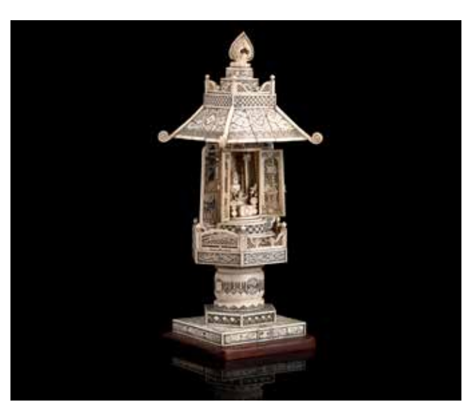
21 (part lot)