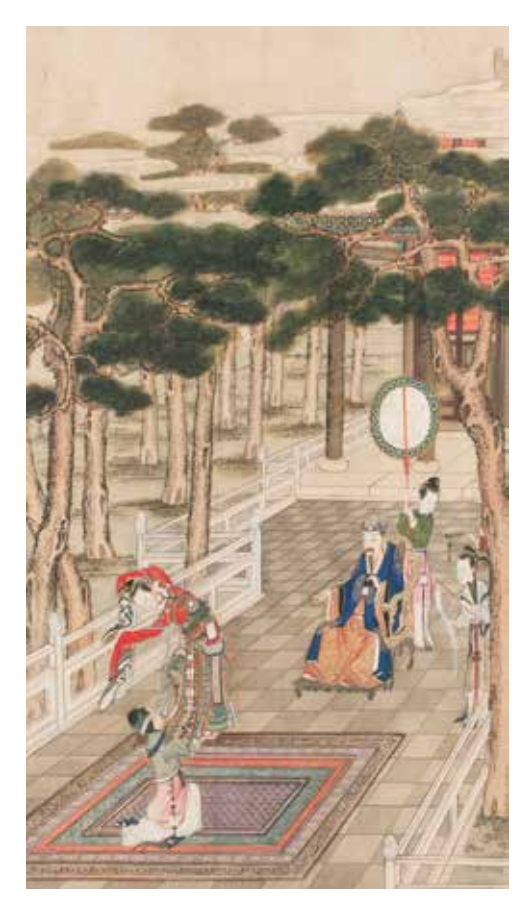
335 (part lot)