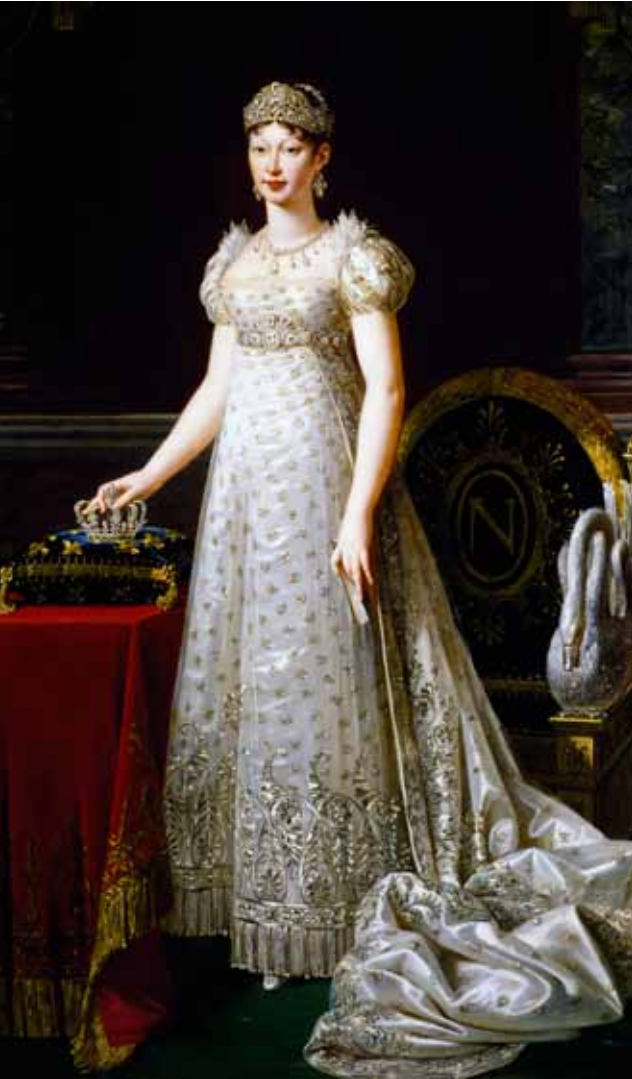
Portrait of Marie-Louise, Empress of France by Robert Lefevre.

A very fine, rare and historically important gold, enamel and split pearl decorated pocket watch bearing the cipher ML within a laurel crown. Presented by Empress Marie-Louise at the opening of Cherbourg harbour in 1813 to Emilie de Pellepra. Gilt full plate verge movement, pierced and engraved balance cock, silver regulation, white enamel dial with Arabic numerals and winding through the dial, blued steel Breguet moon hands, gold full hunter case numbered 61 over 16 on the inside case with translucent light blue enamel front cover, decorated with the cipher "ML" Marie-Louise surmounted by the Royal Crown and framed by laurel leaves in a half circle of pearls. With translucent blue enamel background, decorated with a Bee set with pearls and framed with laurel leaves and bordered by further split pearls, attributed to Francois-Regnault Nitot 35mm. £25,000 - 35,000 €30,000 - 43,000 US$42,000 - 59,000