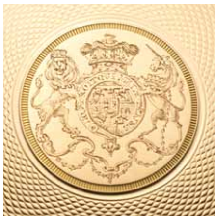
(detail) Royal Coat of Arms