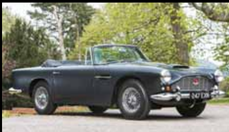
Works Service Restored, 20 years in current ownership, 1963 Aston Martin DB4 Convertible £700,000 - 900,000