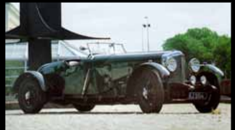
Matching numbers 1930 Bentley 8-Litre Two-Seat Open Tourer Coachwork by Hoffman & Burton £600,000 - 700,000