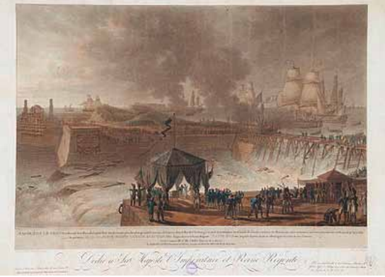
The opening of Cherbourg Harbour (1813) by Empress Marie-Louise