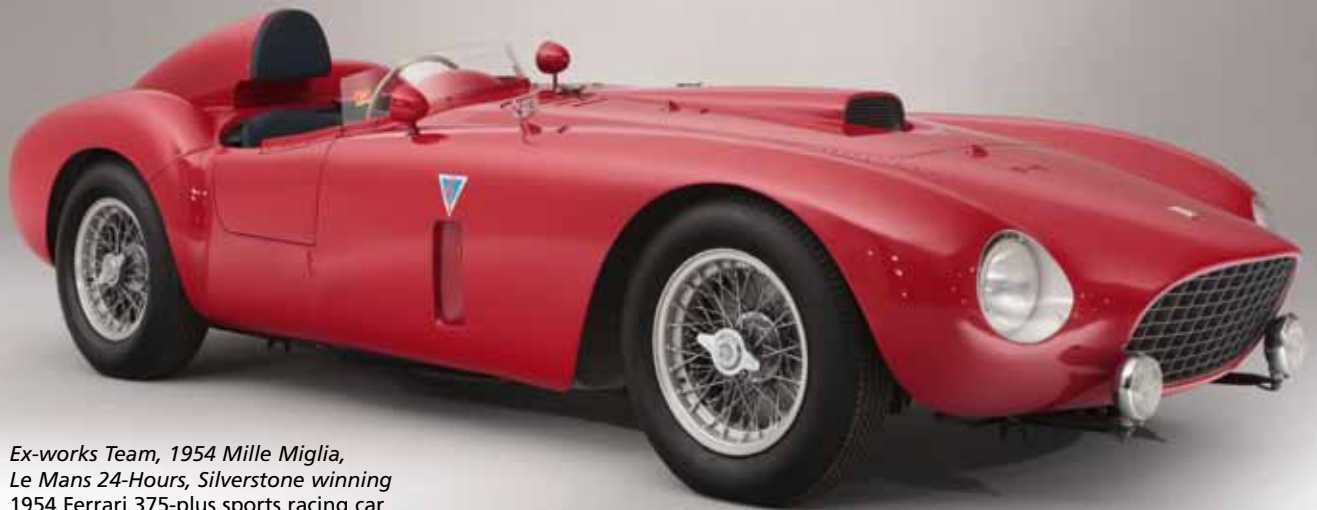
Ex-works Team, 1954 Mille Miglia, Le Mans 24-Hours, Silverstone winning 1954 Ferrari 375-plus sports racing car Chassis: 0384 AM Refer Department