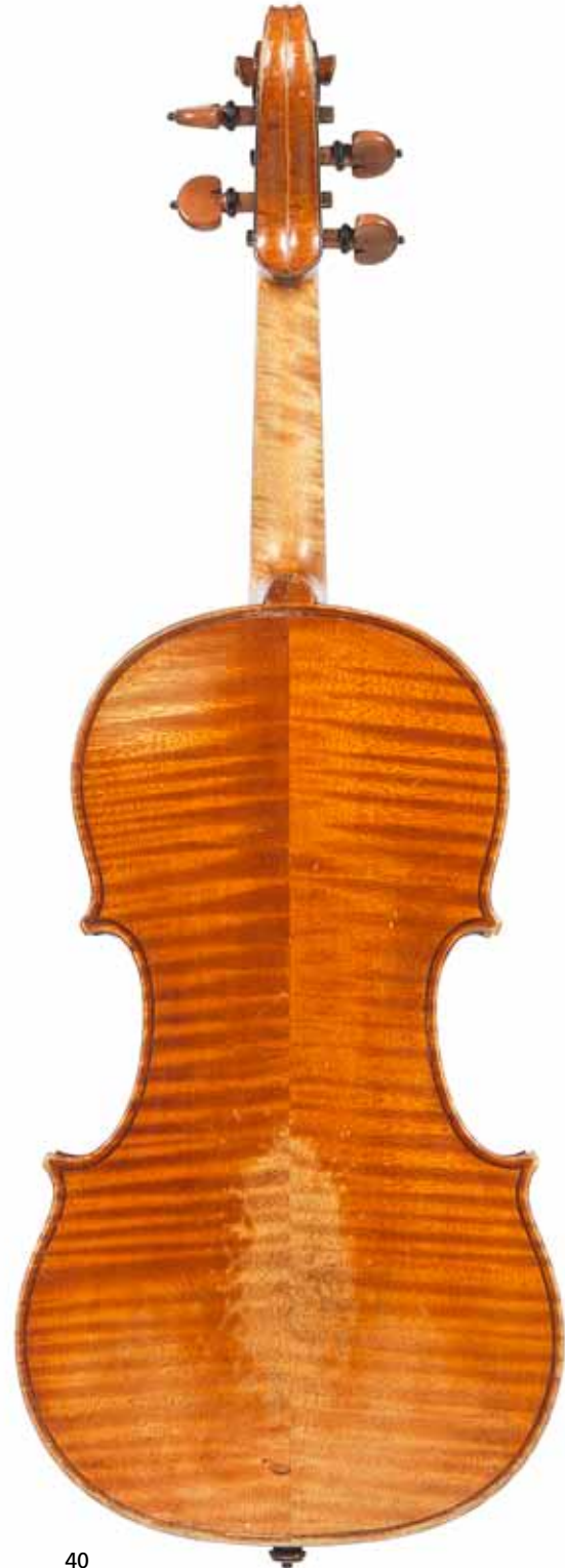
40 A French Violin, T.A. Barbe School after del Gesu, circa 1880 Labelled Barbe d'Avallon Length of back 357mm (14 1/16in) varnish of a golden orange colour, in the manner of JBV, bold scroll of medium curl, use and wear, in case. (2) £6,000 - 8,000