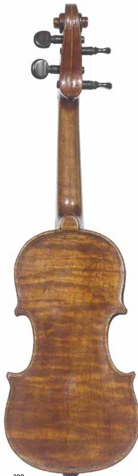
298 A dancing master's Violin Pochette attributed to John Betts, London, circa 1800 Stamped Betts, London on upper back Length of back 238mm (9 3/8in) of a brown colour, use wear and restoration, in fitted wooden case. (2) £800 - 1,200