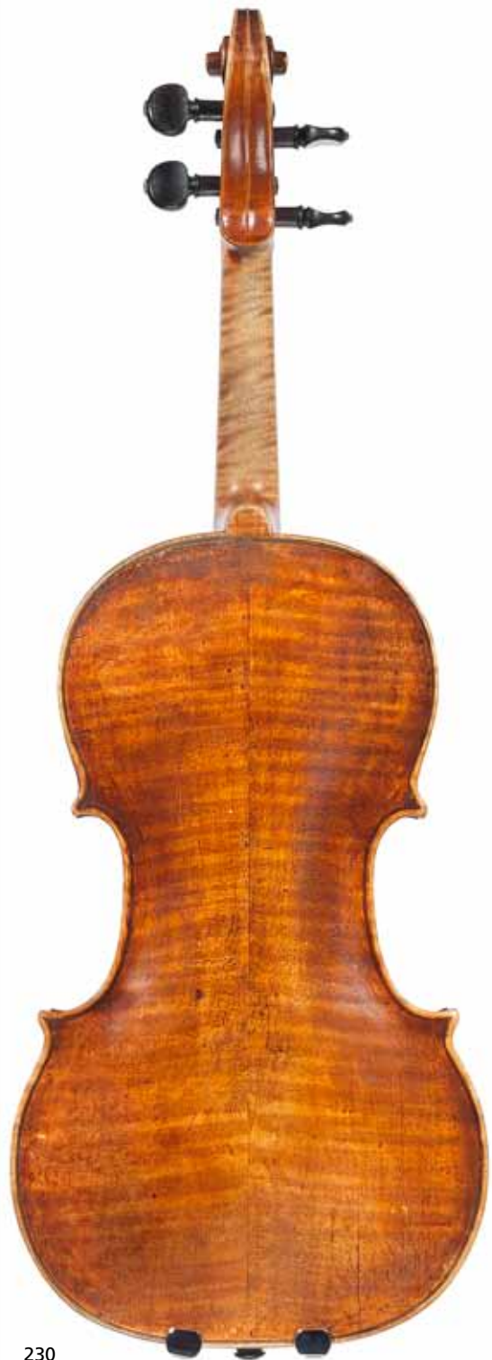
230 A Violin of the Pierray School, circa 1750 Length of back 358mm (14 1/8in) of an aged red golden brown colour, use wear and restorations, in case. (2) £10,000 - 15,000