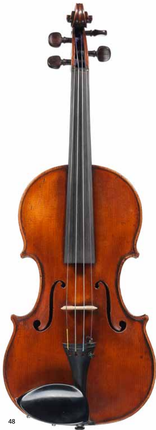
48 A Violin by F.W. Chanot, London, 1905 Labelled F.W. Chanot, London, fecit A.D. 1905, C FW, A., Nicola Amati , Length of back 356mm (14in) of a red golden orange brown colour, minor use and wear, in case. (2) £4,000 - 6,000