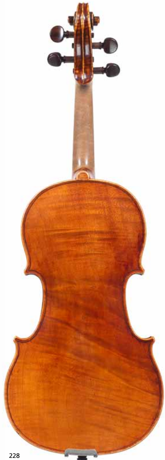
228 A French Violin attributed to Jean Gosselin, Paris, Labelled fait par Gosselin amateur, Paris, Annee, 1829 Length of back 360mm (14 3/16in) of a red amber brown colour, use and wear, in case. (2) £3,000 - 4,000