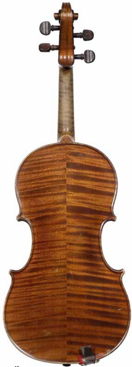
42 A French Violin by Ch.J.B. Collin Mezin, 1911 Labelled Ch.J.B. Collin-Mezin, Lutier, Grand Prix Exposition Universelle 1900, Paris Length of back 360mm (14 3/16in) of an amber brown colour, after del Gesu, with two bows in case. (4) £4,000 - 6,000