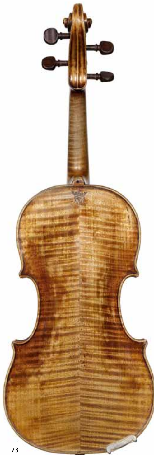
73 A Violin of the Viennese School circa 1800 Labelled Antonius & Hieronymus. frat Amati, Cremonen: And: fil: 1670 Length of back 356mm (14in) of a golden red brown colour, restorations, in a W.E. Hill & Sons case. (2) £3,000 - 4,000