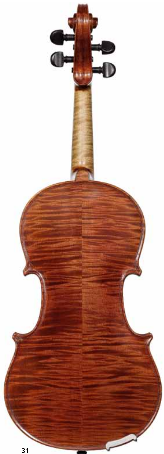
31 A Violin probably by Bruno Barbieri, Mantova, 1978 Labelled Barbieri Bruno, Luitaio in Mantova, 1978, No. 235 Length of back 357mm (14 1/16in) of a red orange brown colour, with bow, in case. (3) £4,000 - 6,000