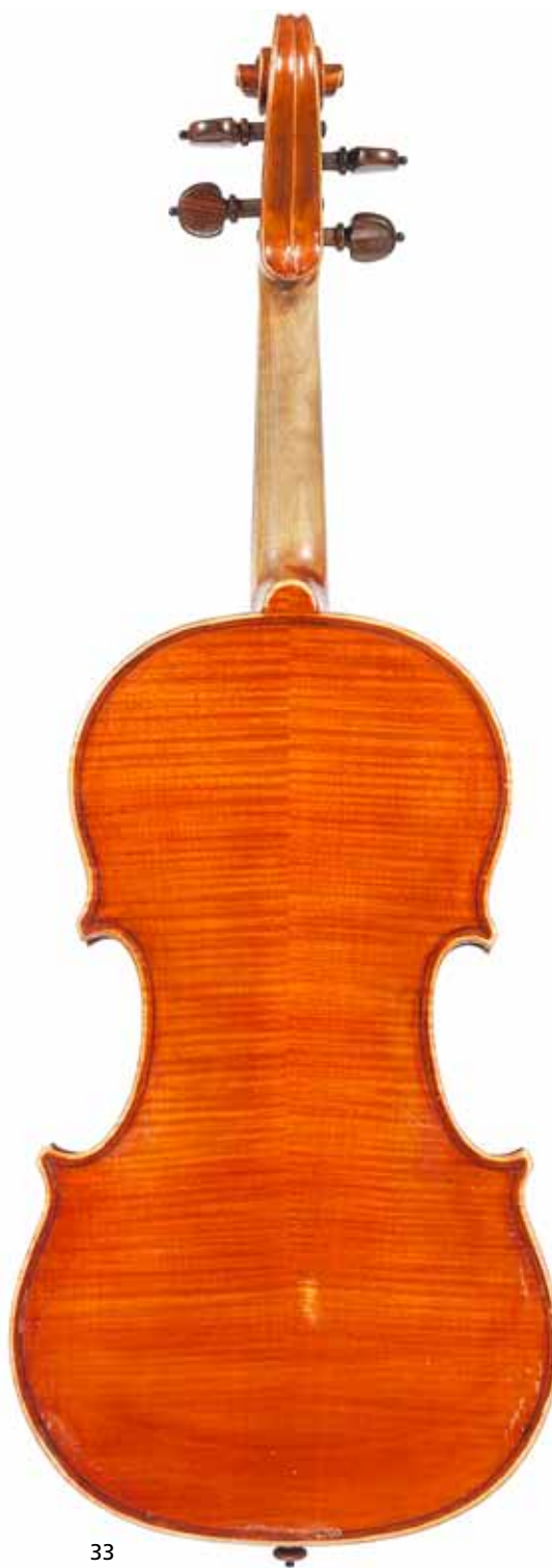
33 A Violin of the Italian School attributed to Lorenzo Marconi, Cremona, 1949 Labelled Marconi, Lorenzo, Cremona 1949 , and signed on label Length of back 357mm (14 1/16in) of a golden orange colour, use and wear, in case. (2) £3,000 - 4,000