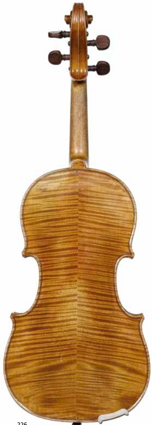
226 A French Violin attributed to A.D. Dieudonne, Mirecourt, 1948 Labelled Fait a Mirecourt No. 4098 par le Maitre-Luthier Amedee Dieudonne en 1948 , and signed internally on back plate, Length of back 356mm (14in) of a golden orange brown colour, with a Violin Bow stamped A.Hoyer, in case. (3) £3,000 - 4,000