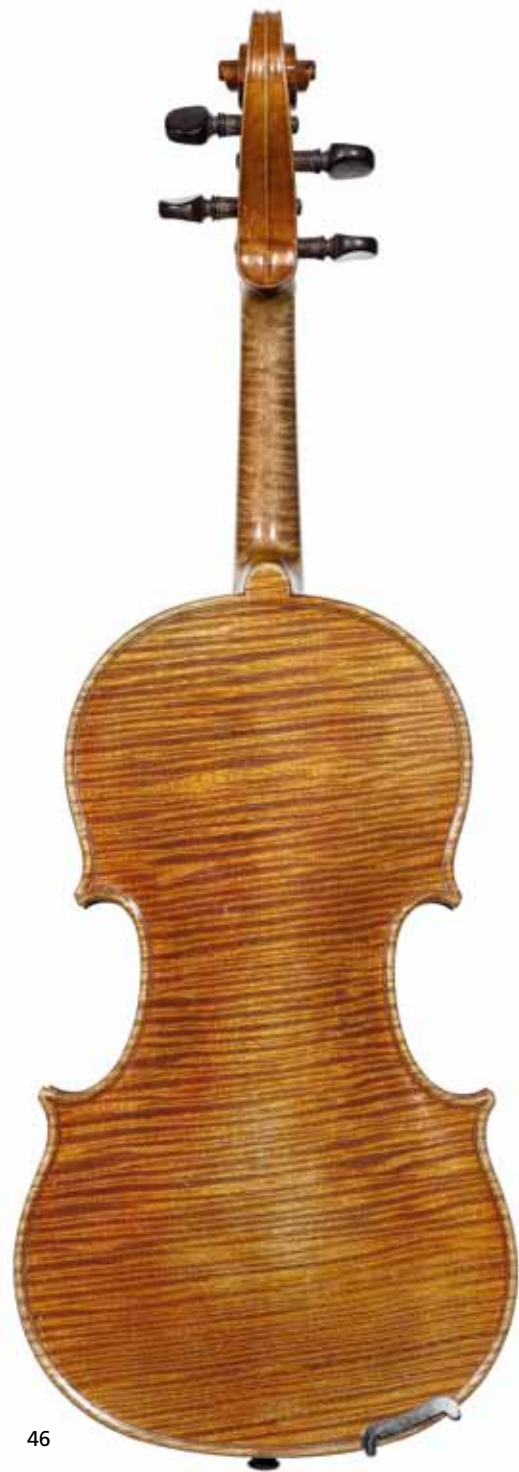
46 A Violin by Victor Audinot, Paris, circa 1910 Labelled Vor Audinot - Mourot, Maître Luthier. Paris No. 231 and signed the same internally on back plate . Length of back 354mm (13 15/16in) of a golden amber brown colour, use and wear, in case. (2) £3,000 - 4,000