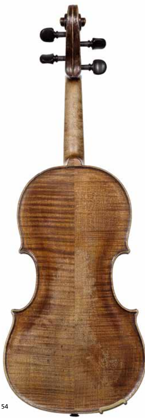
54 An English Violin of quality, attributed to Peter Walmsley, London circa 1760 Labelled Jacobus Stainer ... Length of back 355mm (14in) of a light brown colour, use, wear and restoration, with a bow in case. (3) £5,000 - 7,000