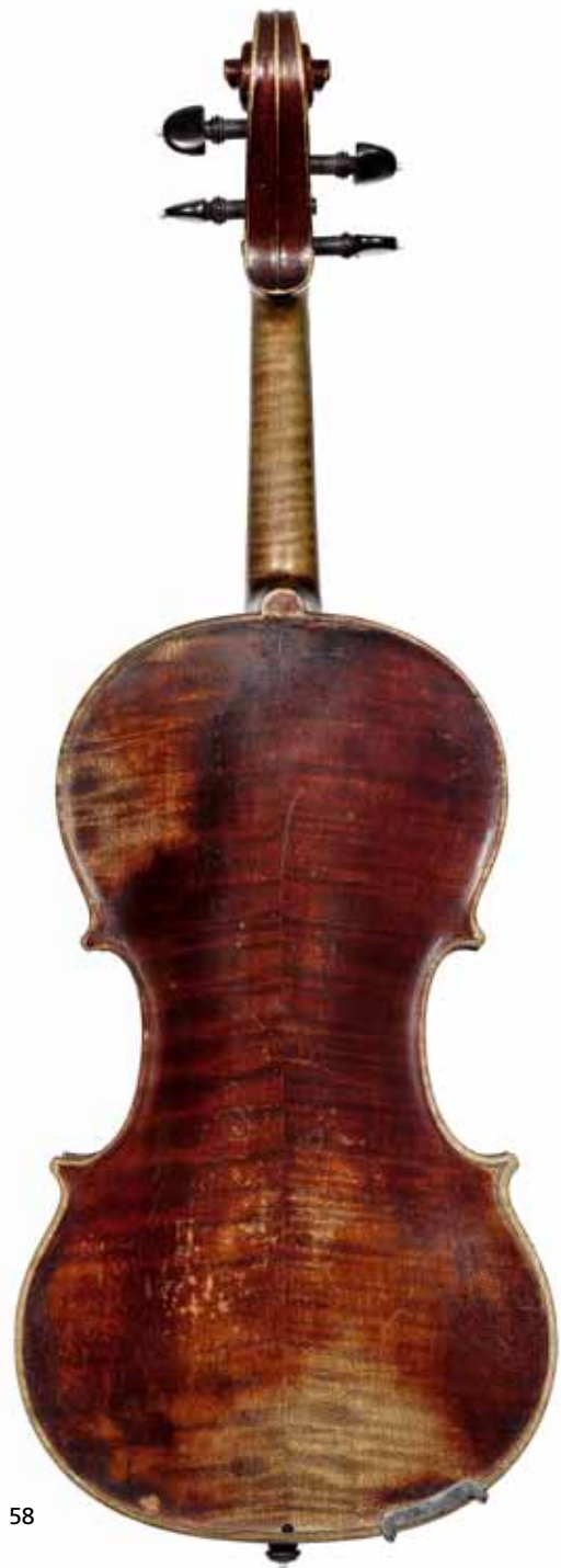
58 A Violin by George Hudson, circa 1900 Branded G. Hudson on upper back, and internally 1887? , Repaired by R. Claridge Oxford , 1992, and Rep by FW.CN , 1947, Length of back 359mm (14 1/8in) of a red brown colour, use wear and restoration, with two bows in case. (4) £3,000 - 4,000