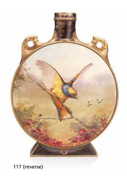
117 A large Minton moon flask by S.H.Ellis Circa 1875

Of circular form with two ring handles moulded with bound feathers, painted to one side with a finely dressed lady wearing pearls and a plumed hat with a rose, and to the reverse with a bird perching on a flowering branch alongside two butterflies, impressed mark and date mark 43.5cm high