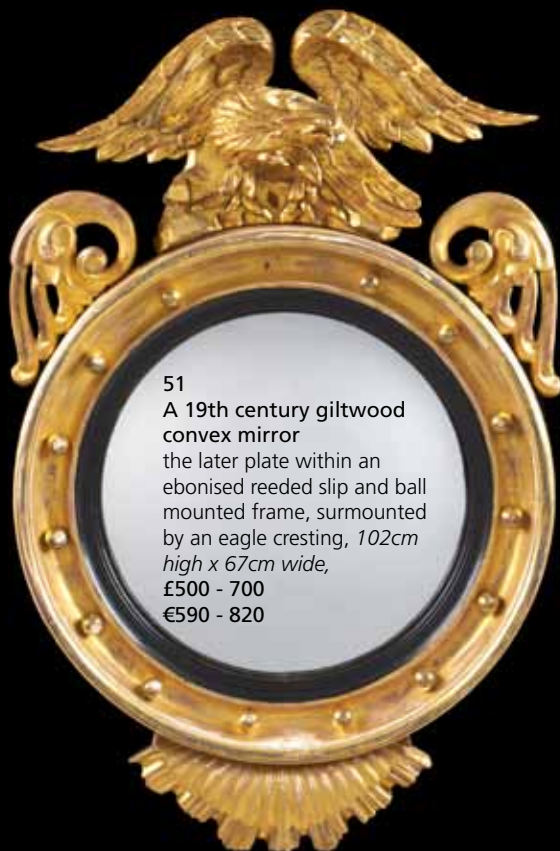
51 A 19th century giltwood convex mirror the later plate within an ebonised reeded slip and ball mounted frame, surmounted by an eagle cresting, 102cm high x 67cm wide, £500 - 700 €590 - 820