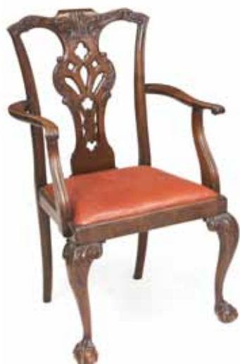
292 (two from a set of eight)