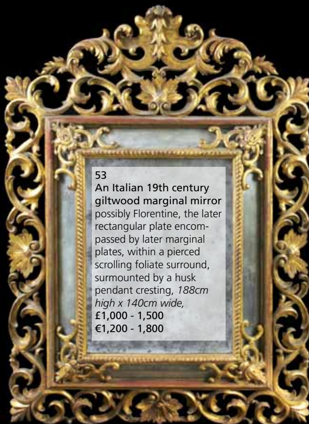
53 An Italian 19th century giltwood marginal mirror possibly Florentine, the later rectangular plate encompassed by later marginal plates, within a pierced scrolling foliate surround, surmounted by a husk pendant cresting, 188cm high x 140cm wide, £1,000 - 1,500 €1,200 - 1,800