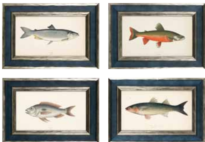
133 (four from set of twenty four)