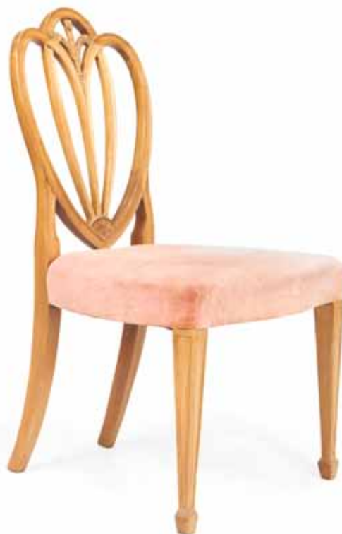
270 (two from a set of twelve)