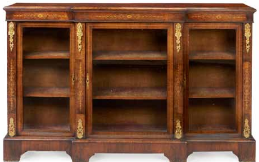
145 A Victorian walnut and fruitwood inlaid side cabinet of breakfront form, with stylised foliate inlay, the three glazed panelled doors enclosing six shelves, 167cm wide x 34cm deep x 104cm high, (65.5" wide x 13" deep x 40.5" high) £600 - 900 €700 - 1,100