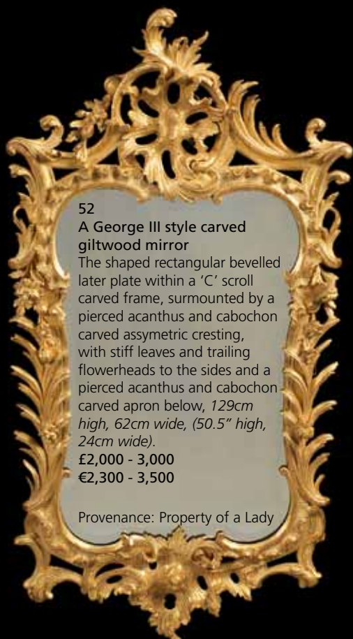
52 A George III style carved giltwood mirror The shaped rectangular bevelled later plate within a 'C' scroll carved frame, surmounted by a pierced acanthus and cabochon carved assymetric cresting, with stiff leaves and trailing flowerheads to the sides and a pierced acanthus and cabochon carved apron below, 129cm high, 62cm wide, (50.5" high, 24cm wide). £2,000 - 3,000 €2,300 - 3,500