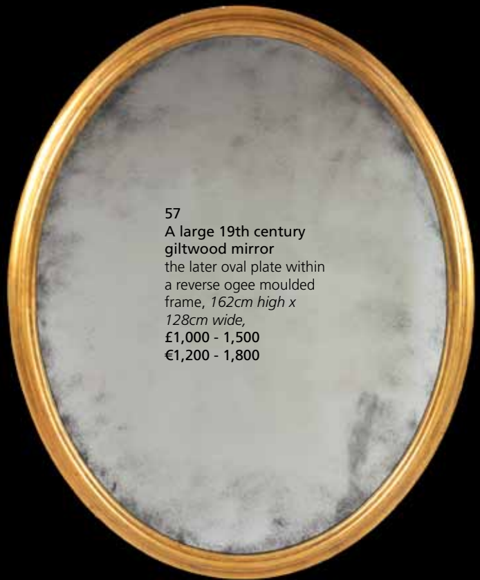
57 A large 19th century giltwood mirror the later oval plate within a reverse ogee moulded frame, 162cm high x 128cm wide, £1,000 - 1,500 €1,200 - 1,800