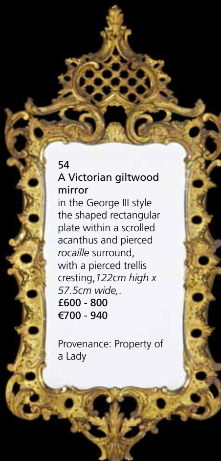
54 A Victorian giltwood mirror in the George III style the shaped rectangular plate within a scrolled acanthus and pierced rocaille surround, with a pierced trellis cresting, 122cm high x 57.5cm wide, £600 - 800 €700 - 940