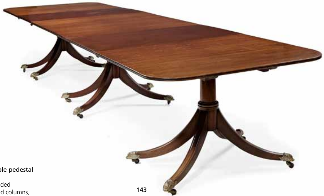
143 A George III style mahogany triple pedestal dining table comprising three tilt-tops, the rounded rectangular top on three ring turned columns, terminating in twelve outswept legs and brass acanthus scrolled palmette feet with castors, including two additional leaves, 428cm wide x 117.5cm deep x 76cm high, (168.5" wide x 46" deep x 29.5" high) £1,500 - 2,000 €1,800 - 2,300