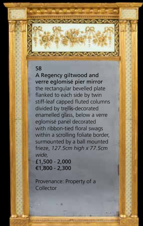
58 A Regency giltwood and verre eglomisé pier mirror the rectangular bevelled plate flanked to each side by twin stiff-leaf capped fluted columns divided by trellis-decorated enamelled glass, below a verre egglomisé panel decorated with ribbon-tied floral swags within a scrolling foliate border, surmounted by a ball mounted frieze, 127.5cm high x 77.5cm wide, £1,500 - 2,000 €1,800 - 2,300