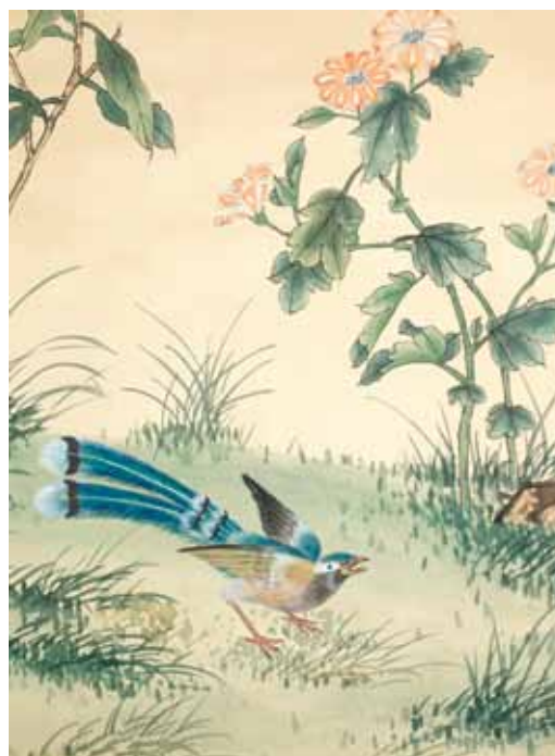
137 (one of twelve rolls of wallpaper)