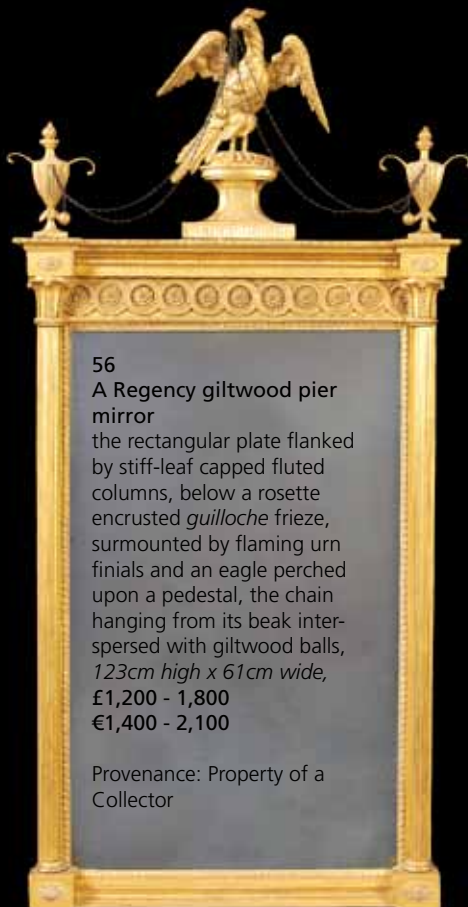
56 A Regency giltwood pier mirror the rectangular plate flanked by stiff-leaf capped fluted columns, below a rosette encrusted guilloche frieze, surmounted by flaming urn finials and an eagle perched upon a pedestal, the chain hanging from its beak inter- spersed with giltwood balls, 123cm high x 61cm wide, £1,200 - 1,800 €1,400 - 2,100