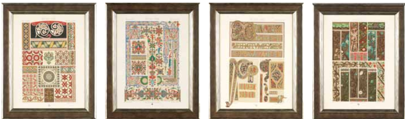
132 (four from set of twelve)