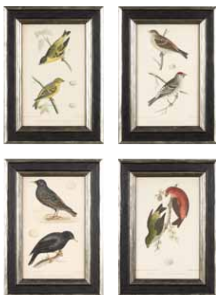
134 (four from set of twenty four)