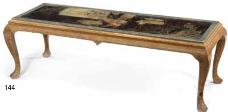
144 A giltwood and coromandel lacquer rectangular low/coffee table Incorporating a section from a late 19th century lacquer screen decorated with figures within a landscape setting under a glass protector, within a pale blue moulded border on a stand with cabriole legs and pad feet, 136cm wide, 49cm deep, 43cm high (53.5" wide, 19" deep, 16.5" high). £700 - 900 €820 - 1,100