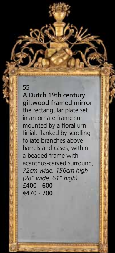
55 A Dutch 19th century giltwood framed mirror the rectangular plate set in an ornate frame sur- mounted by a floral urn finial, flanked by scrolling foliate branches above barrels and cases, within a beaded frame with acanthus-carved surround, 72cm wide, 156cm high (28" wide, 61" high). £400 - 600 €470 - 700