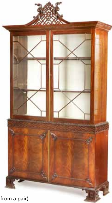
28 (one from a pair)