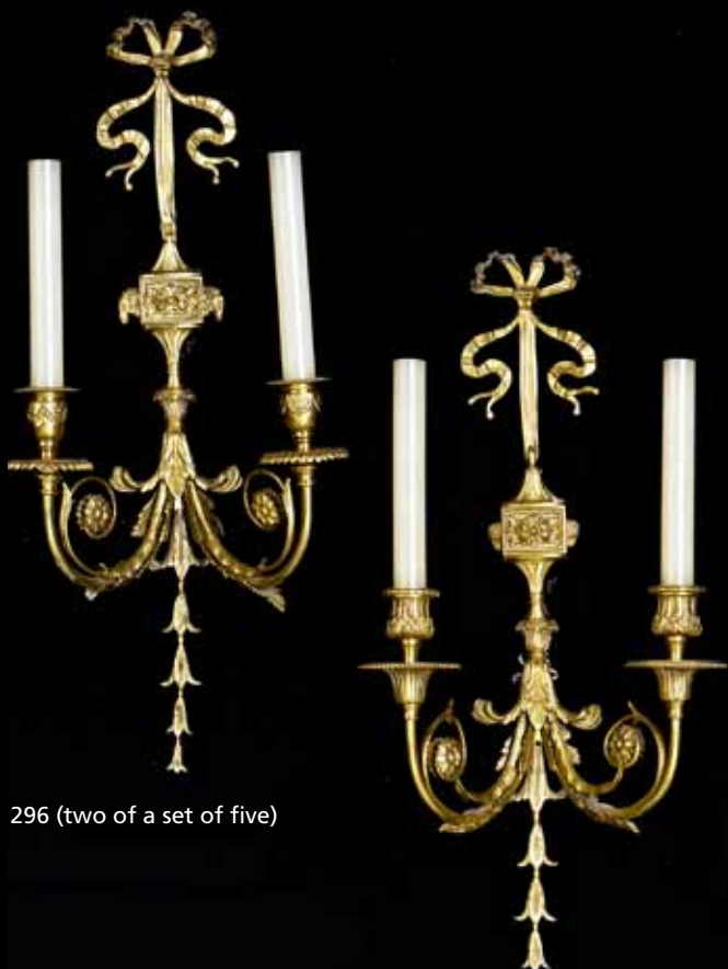
296 (two of a set of five)