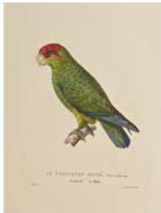
275 (two of a set of five)