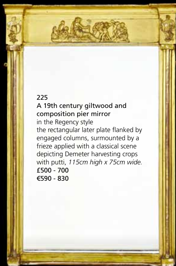
225 A 19th century giltwood and composition pier mirror in the Regency style the rectangular later plate flanked by engaged columns, surmounted by a frieze applied with a classical scene depicting Demeter harvesting crops with putti, 115cm high x 75cm wide. £500 - 700 €590 - 830