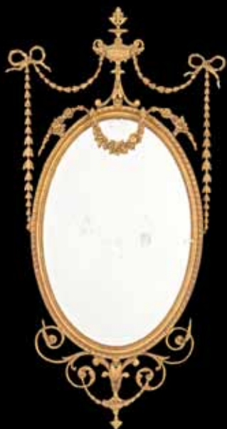
224 A pair of late 19th/early 20th century giltwood and composition mirrors in the George III style each with an oval bevelled plate within a gadrooned surround, surmounted by a ribbon tied husk and floral swagged flaming urn cresting, 111cm high x 58cm wide, (2) £600 - 800 €710 - 950