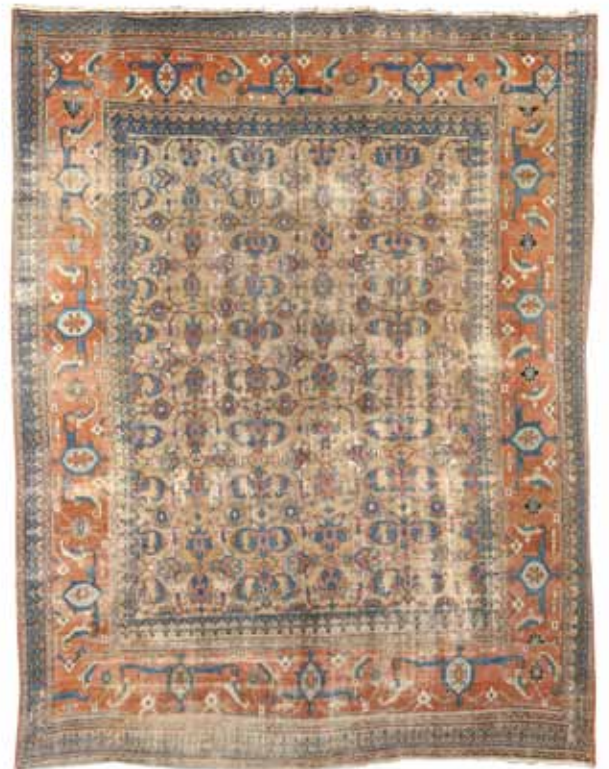
88 A Kashan carpet, Central Persia, 375cm x 284cm £700 - 1,000 €830 - 1,200