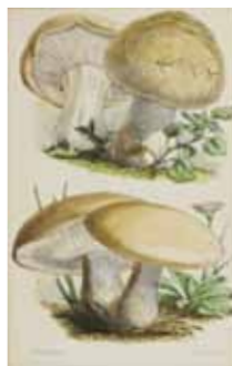
277 (four of a set of twelve)