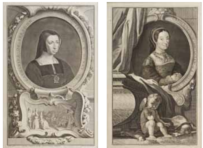
280 (four of a set of twenty four)