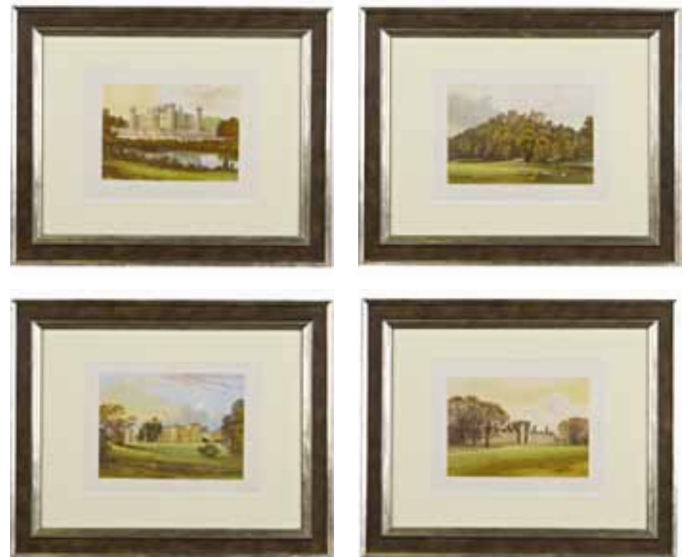
279 (four of a set of twelve)

A late 17th century oil on oak armorial panel the central banner with three black swans, the shield flanked by red and white foliage, within a moulded rectangular frame, 43cm wide x 43cm high overall £400 - 600 €470 - 710