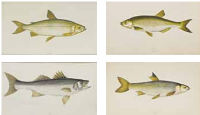
278 (four of a set of twenty four)