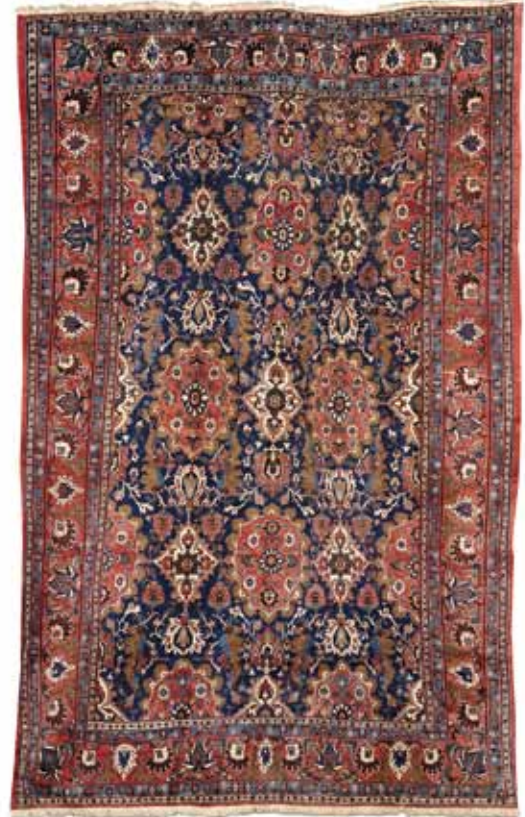
52 A Kashan carpet, Central Persia, 405cm x 320cm £2,000 - 3,000 €2,400 - 3,600