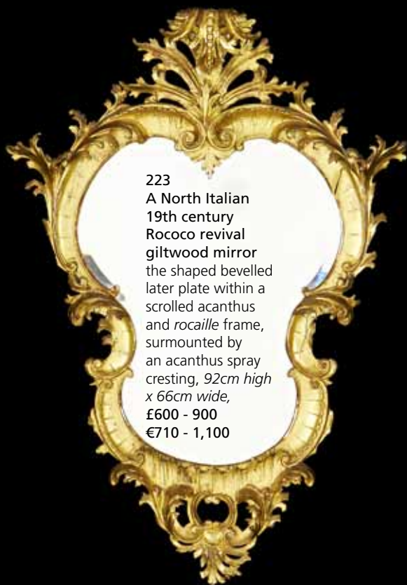
223 A North Italian 19th century Rococo revival giltwood mirror the shaped bevelled later plate within a scrolled acanthus and rocaille frame, surmounted by an acanthus spray cresting, 92cm high x 66cm wide, £600 - 900 €710 - 1,100