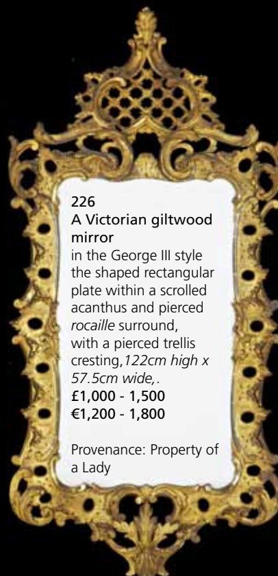
226 A Victorian giltwood mirror in the George III style the shaped rectangular plate within a scrolled acanthus and pierced rocaille surround, with a pierced trellis cresting, 122cm high x 57.5cm wide, £1,000 - 1,500 €1,200 - 1,800