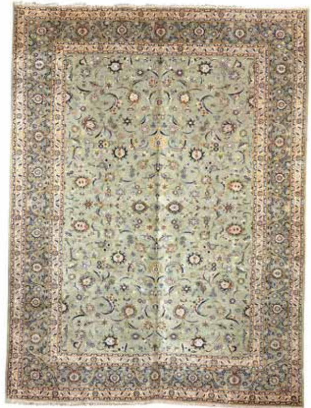
87 A Feraghan carpet, West Persia, 562cm x 419cm £3,000 - 5,000 €3,600 - 5,900