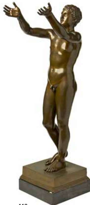
118 After the Antique: An early 20th century bronze Neapolitan nude figure cast by Sabatino de Angelis Foundry, Naples mid brown patination, on a square base, signed Sab. DE ANGELIS & FILS NAPLES 1905 , on a square slate plinth, 76cm high £1,500 - 2,000 €1,800 - 2,400