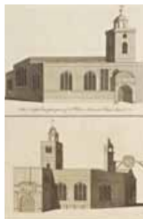
274 (four of a set of twelve)