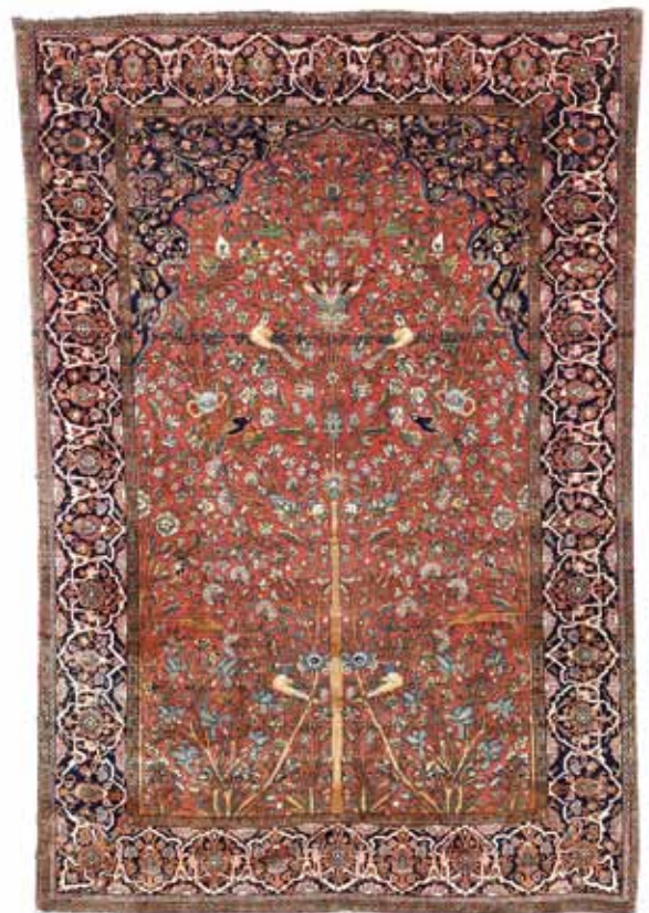
53 A Veramin carpet, Central Persia, 340cm x 204cm £800 - 1,200 €950 - 1,400