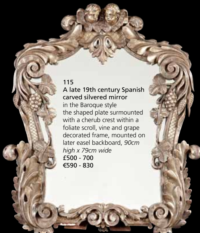
115 A late 19th century Spanish carved silvered mirror in the Baroque style the shaped plate surmounted with a cherub crest within a foliate scroll, vine and grape decorated frame, mounted on later easel backboard, 90cm high x 79cm wide £500 - 700 €590 - 830