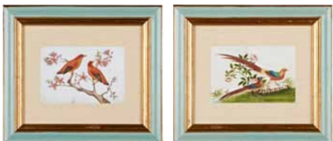
120 (four from a set of twelve)