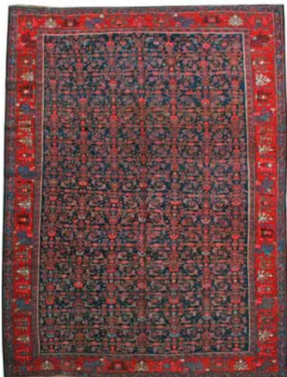
58 A Bidjar carpet, Persian/Kurdistan, 430cm x 280cm £1,500 - 2,000 €1,800 - 2,400