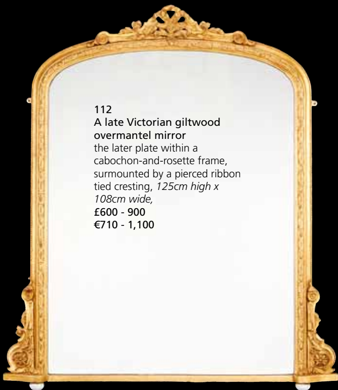
112 A late Victorian giltwood overmantel mirror the later plate within a cabochon-and-rosette frame, surmounted by a pierced ribbon tied cresting, 125cm high x 108cm wide, £600 - 900 €710 - 1,100