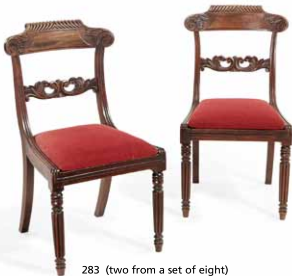
283 (two from a set of eight)