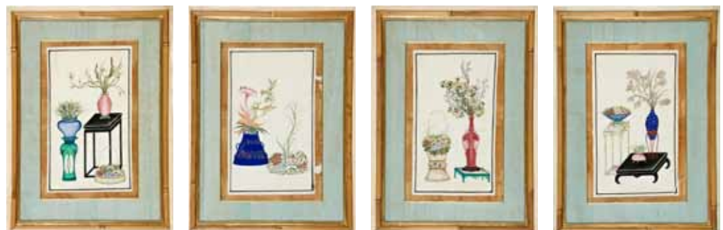
126 (four from a set of five)