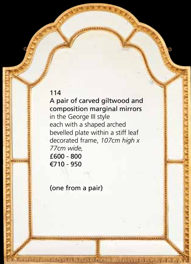
114 A pair of carved giltwood and composition marginal mirrors in the George III style each with a shaped arched bevelled plate within a stiff leaf decorated frame, 107cm high x 77cm wide, £600 - 800 €710 - 950