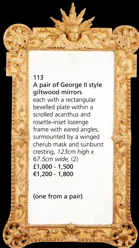
113 A pair of George II style giltwood mirrors each with a rectangular bevelled plate within a scrolled acanthus and rosette-inset lozenge frame with eared angles, surmounted by a winged cherub mask and sunburst cresting, 123cm high x 67.5cm wide, (2) £1,000 - 1,500 €1,200 - 1,800