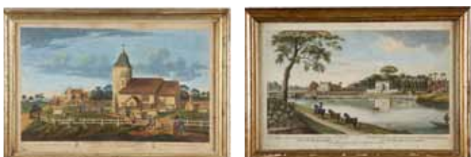
122 (four from a set of eight)