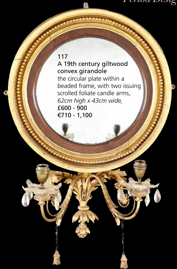
117 A 19th century giltwood convex girandole the circular plate within a beaded frame, with two issuing scrolled foliate candle arms, 62cm high x 43cm wide, £600 - 900 €710 - 1,100