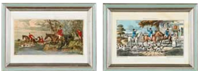
121 (four from a set of twelve)