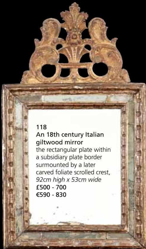
118 An 18th century Italian giltwood mirror the rectangular plate within a subsidiary plate border surmounted by a later carved foliate scrolled crest, 92cm high x 53cm wide £500 - 700 €590 - 830