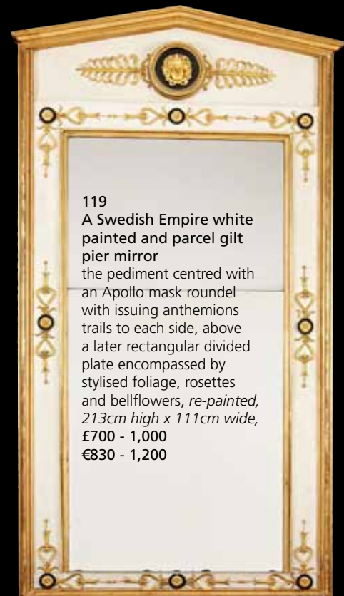
119 A Swedish Empire white painted and parcel gilt pier mirror the pediment centred with an Apollo mask roundel with issuing anthemions trails to each side, above a later rectangular divided plate encompassed by stylised foliage, rosettes and bellflowers, re-painted, 213cm high x 111cm wide, £700 - 1,000 €830 - 1,200