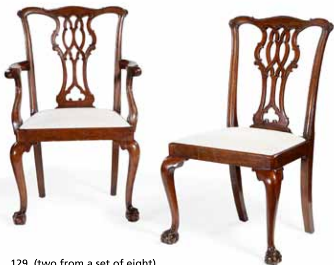
129 (two from a set of eight)