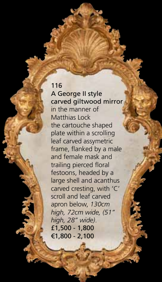
116 A George II style carved giltwood mirror in the manner of Matthias Lock the cartouche shaped plate within a scrolling leaf carved asymmetric frame, flanked by a male and female mask and trailing pierced floral festoons, headed by a large shell and acanthus carved cresting, with 'C' scroll and leaf carved apron below, 130cm high, 72cm wide, (51" high, 28" wide). £1,500 - 1,800 €1,800 - 2,100