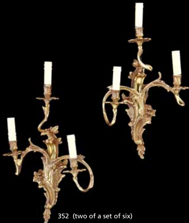
352 (two of a set of six)