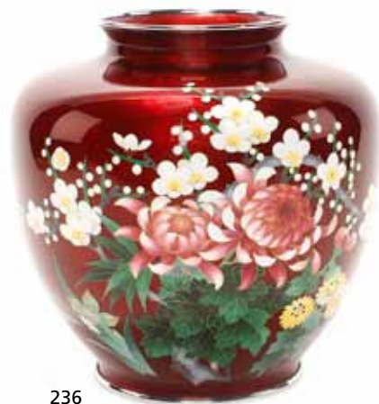
236 A Chinese cloisonné vase, 20th century Decorated with flower sprays on a red ground, white metal mounts to rim and base, 23cm high £500 - 550