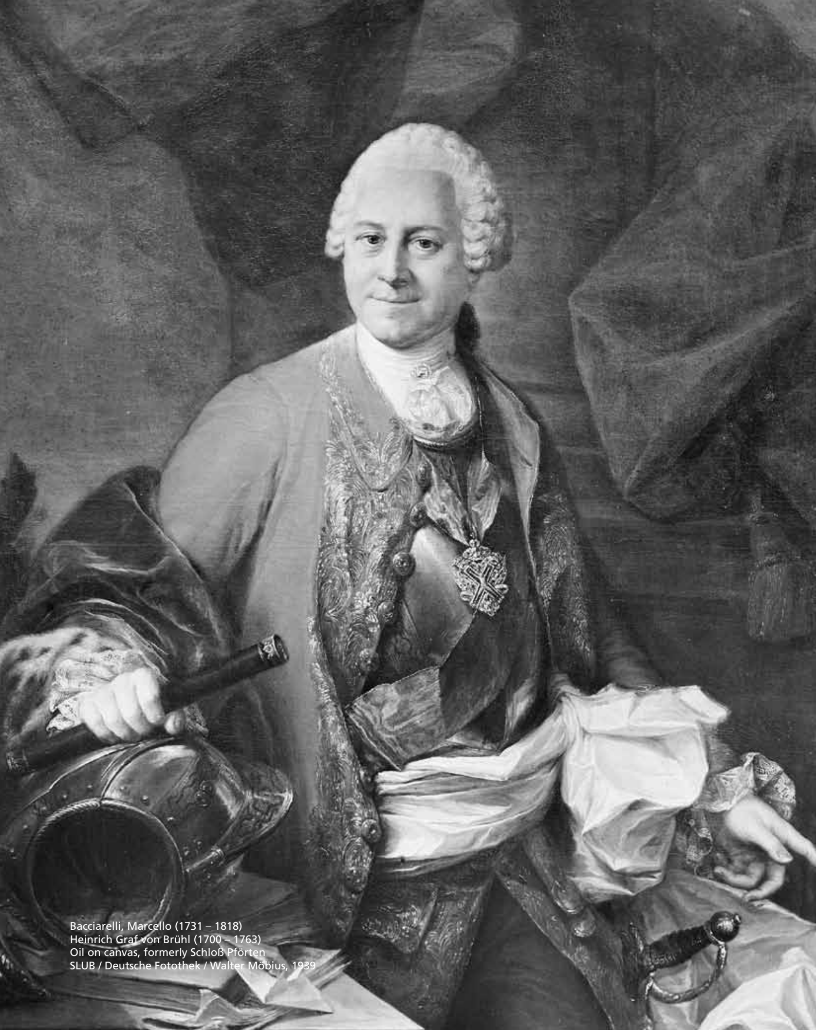
Bacciarelli, Marcello (1731 – 1818) Heinrich Graf von Brühl (1700 – 1763) Oil on canvas, formerly Schloß Pforten