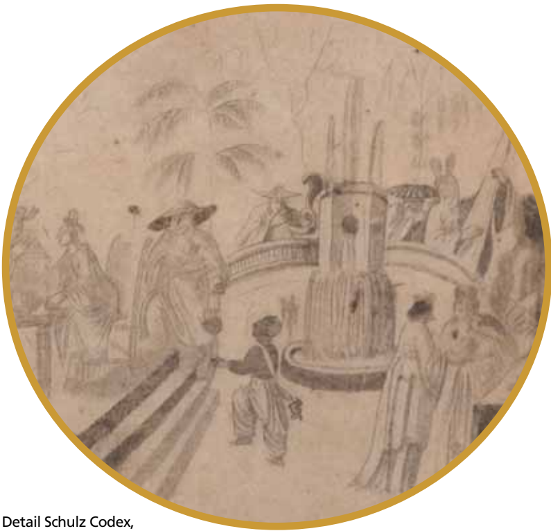
Detail Schulz Codex, plate 52