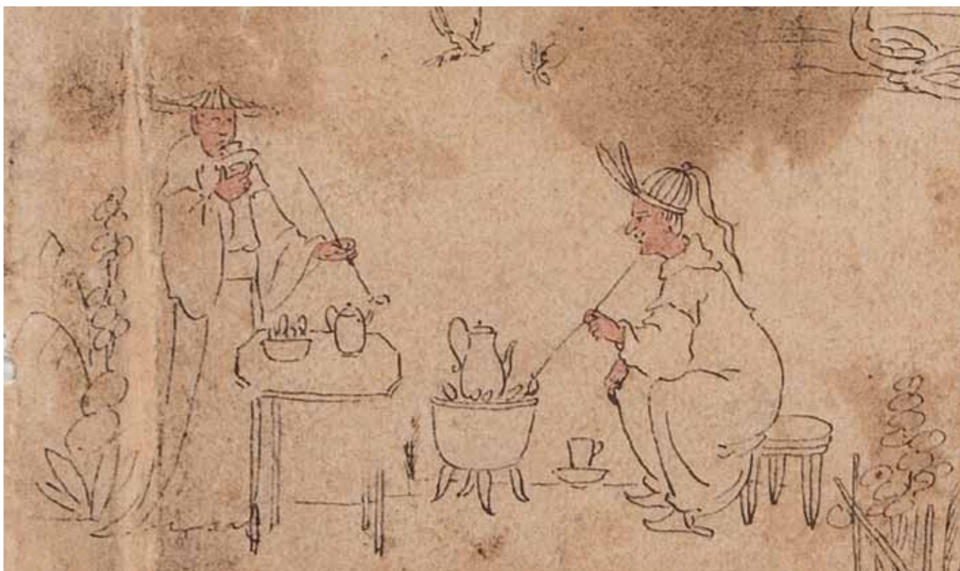
Schulz Codex, Plate 3 (detail)