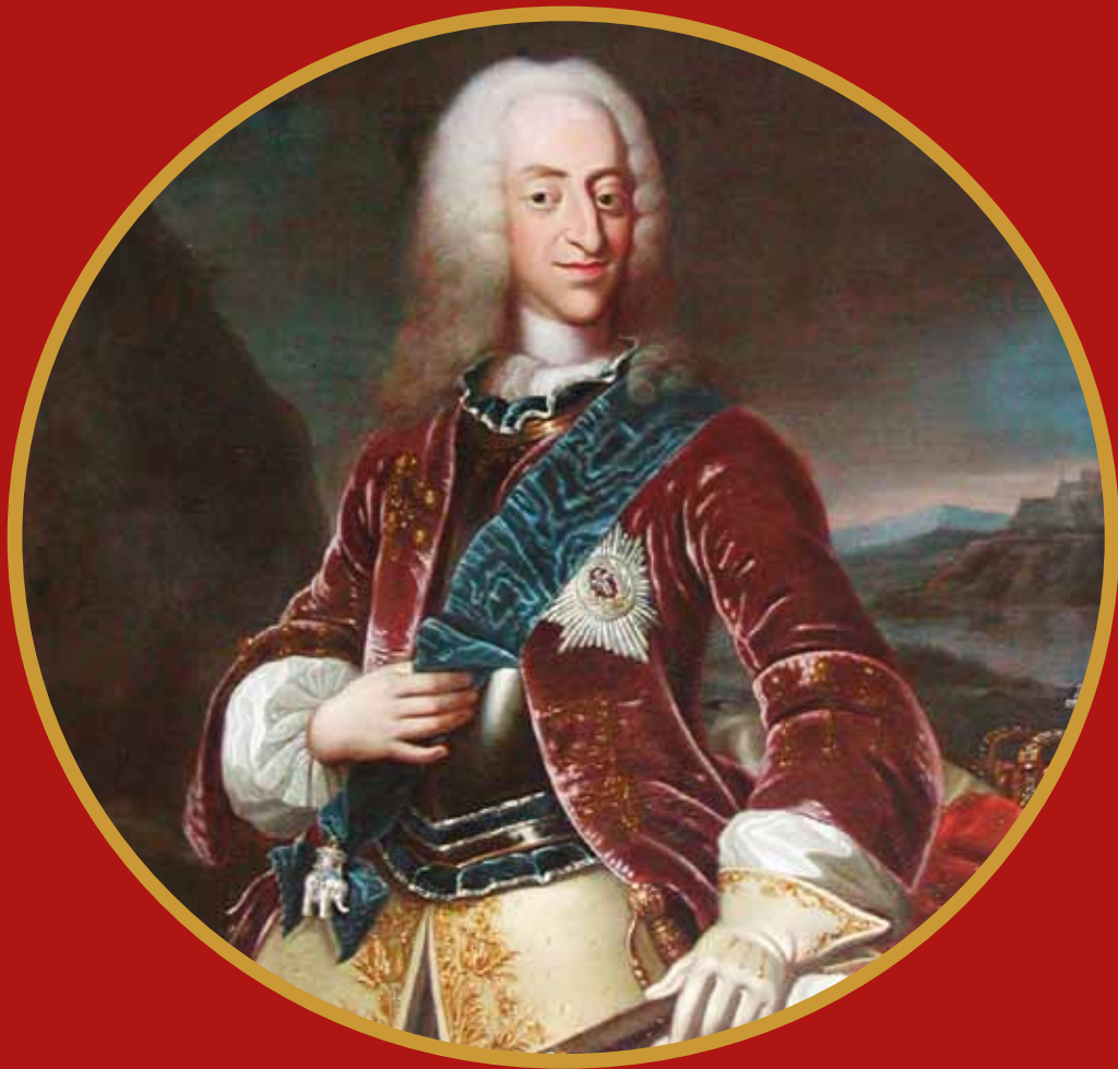
King Christian VI of Denmark (1699-1746) Johan Salomon Wahl, 1740