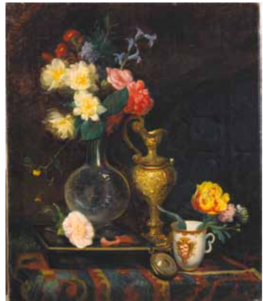
A flower still life by Massimo d’Azeglio showing a chocolate beaker from the service, 1843