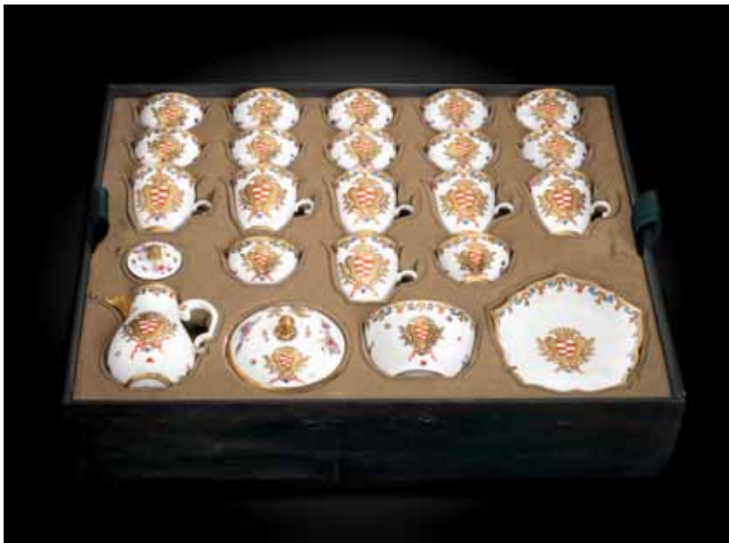
(Detail of the first layer of the service in its case)