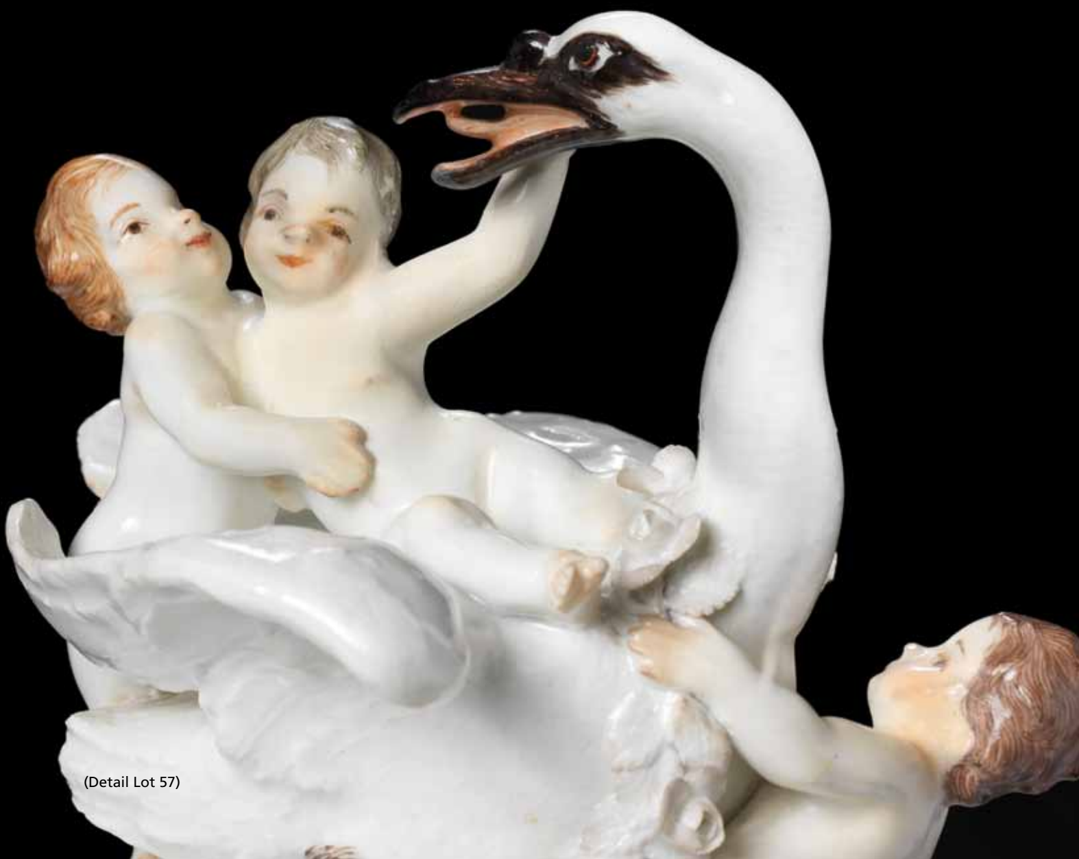
(Detail Lot 57)