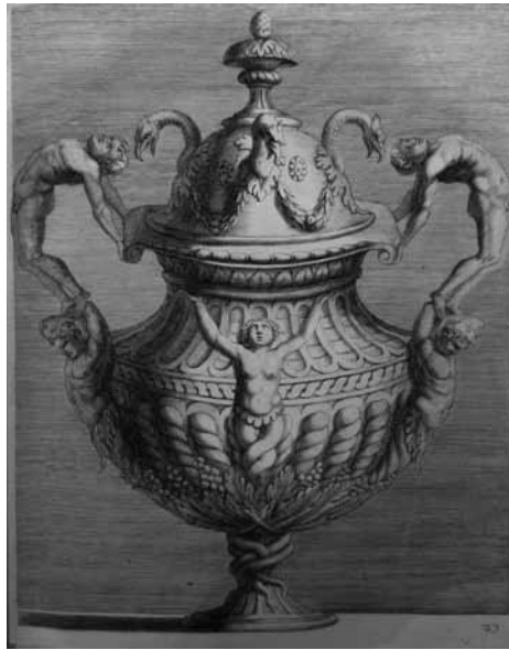
Jacques Stella, 'Livre des Vases' 1667 (details)