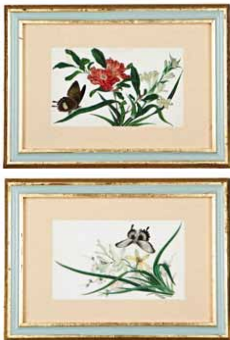
356 (two from a set of twelve)