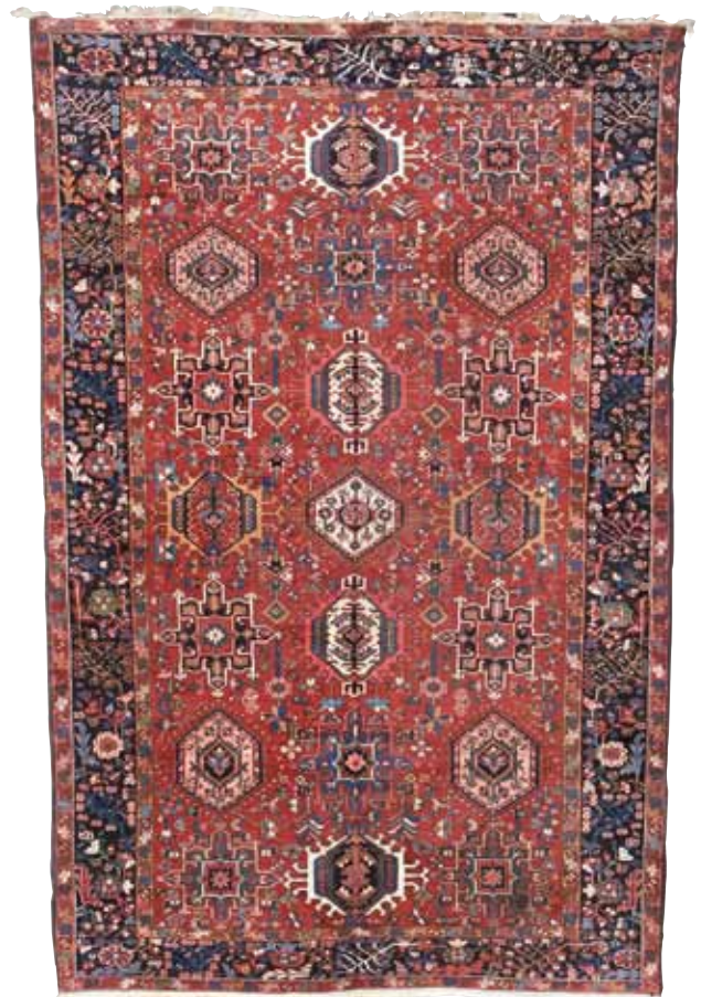
166* A Heriz carpet, North West Persia, 313cm x 201cm £500 - 700 €580 - 810