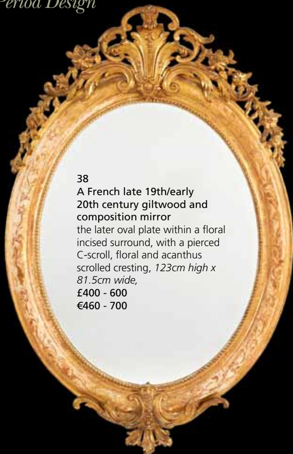
38 A French late 19th/early 20th century giltwood and composition mirror the later oval plate within a floral incised surround, with a pierced C-scroll, floral and acanthus scrolled cresting, 123cm high x 81.5cm wide, £400 - 600 €460 - 700