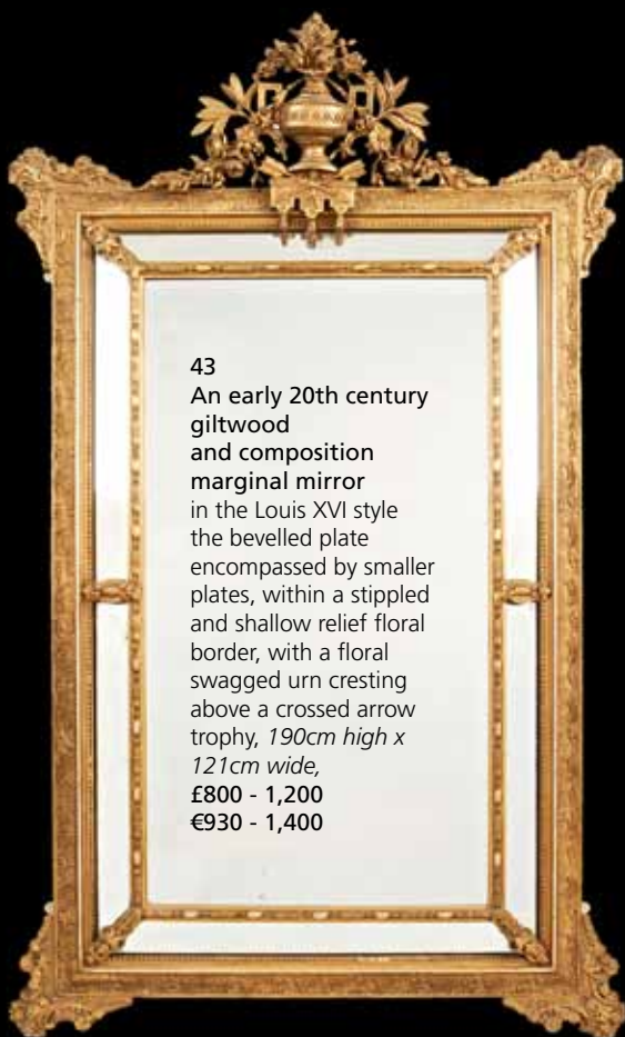
43 An early 20th century giltwood and composition marginal mirror in the Louis XVI style the bevelled plate encompassed by smaller plates, within a stippled and shallow relief floral border, with a floral swagged urn cresting above a crossed arrow trophy, 190cm high x 121cm wide, £800 - 1,200 €930 - 1,400