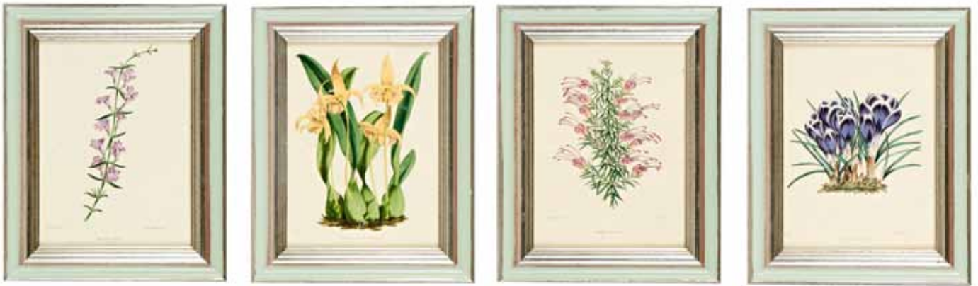
358 (four from a set of twelve)