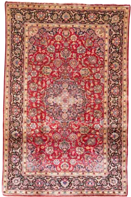
68 A Feraghan rug, West Persia, 190cm x 126cm £1,500 - 2,000 €1,700 - 2,300