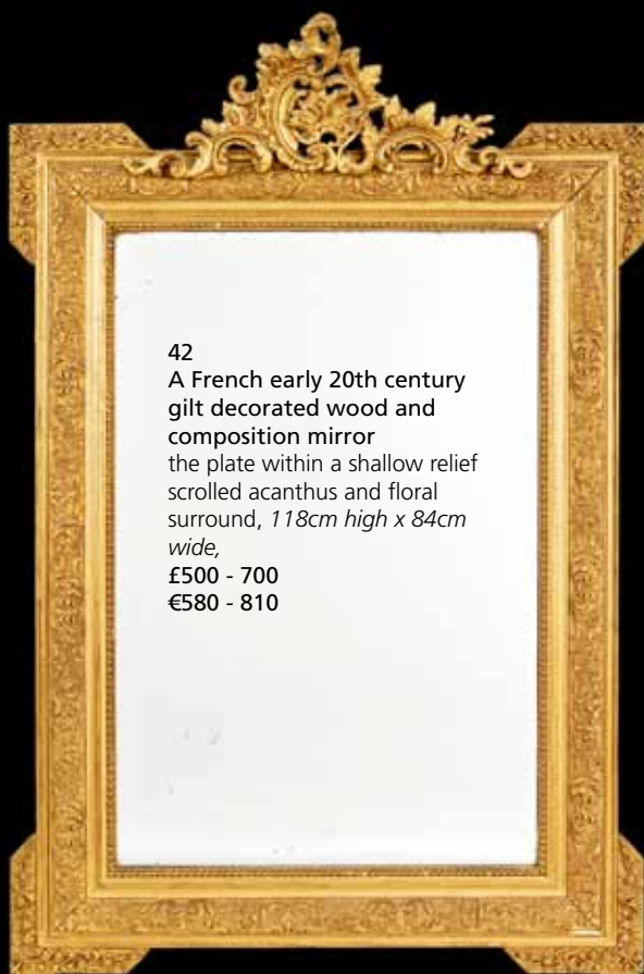
42 A French early 20th century gilt decorated wood and composition mirror the plate within a shallow relief scrolled acanthus and floral surround, 118cm high x 84cm wide, £500 - 700 €580 - 810