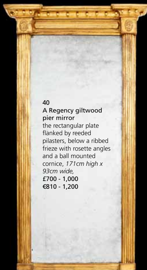
40 A Regency giltwood pier mirror the rectangular plate flanked by reeded pilasters, below a ribbed frieze with rosette angles and a ball mounted cornice, 171cm high x 93cm wide, £700 - 1,000 €810 - 1,200