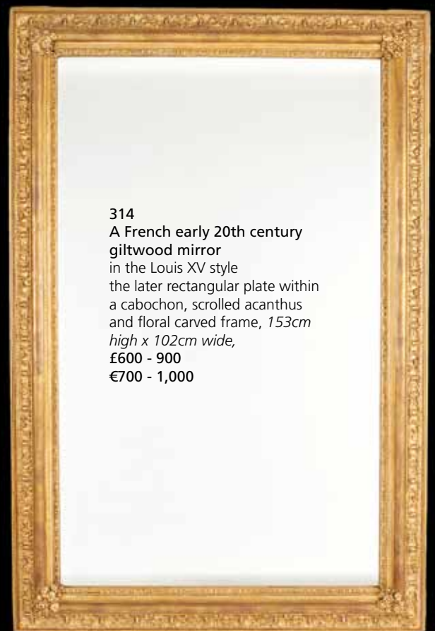
314 A French early 20th century giltwood mirror in the Louis XV style the later rectangular plate within a cabochon, scrolled acanthus and floral carved frame, 153cm high x 102cm wide, £600 - 900 €700 - 1,000