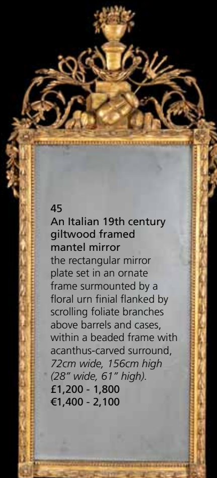
45 An Italian 19th century giltwood framed mantel mirror the rectangular mirror plate set in an ornate frame surmounted by a floral urn finial flanked by scrolling foliate branches above barrels and cases, within a beaded frame with acanthus-carved surround, 72cm wide, 156cm high (28" wide, 61" high). £1,200 - 1,800 €1,400 - 2,100