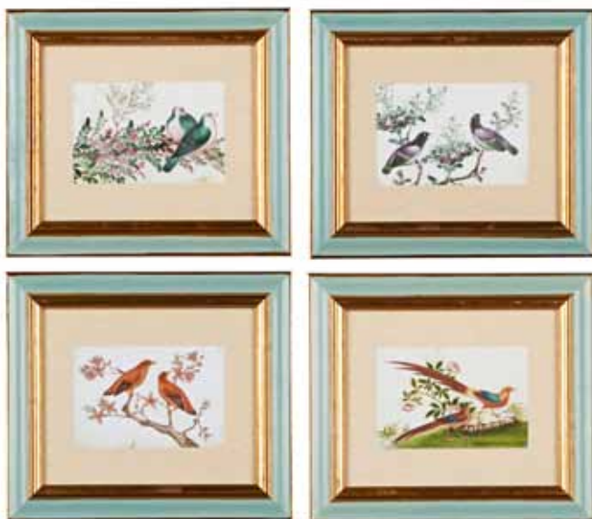
355 (four from a set of twelve)