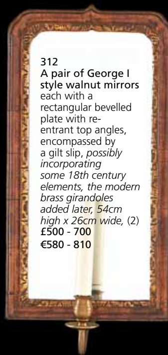
312 A pair of George I style walnut mirrors each with a rectangular bevelled plate with re-entrant top angles, encompassed by a gilt slip, possibly incorporating some 18th century elements, the modern brass girandoles added later, 54cm high x 26cm wide, (2) £500 - 700 €580 - 810