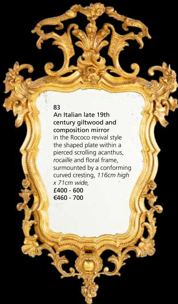
83 An Italian late 19th century giltwood and composition mirror in the Rococo revival style the shaped plate within a pierced scrolling acanthus, rocaille and floral frame, surmounted by a conforming curved cresting, 116cm high x 71cm wide, £400 - 600 €460 - 700