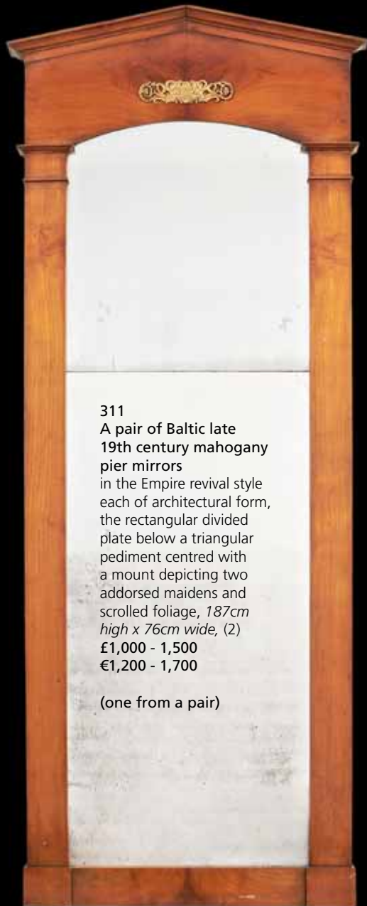
311 A pair of Baltic late 19th century mahogany pier mirrors in the Empire revival style each of architectural form, the rectangular divided plate below a triangular pediment centred with a mount depicting two addorsed maidens and scrolled foliage, 187cm high x 76cm wide, (2) £1,000 - 1,500 €1,200 - 1,700