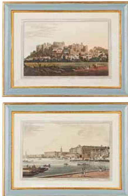
357 (two from a set of six)