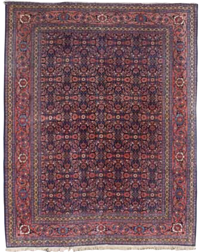
163 An Amritsar carpet, North India, 480cm x 355cm £1,500 - 2,000 €1,700 - 2,300