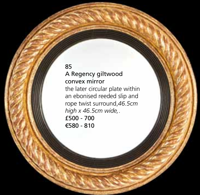
85 A Regency giltwood convex mirror the later circular plate within an ebonised reeded slip and rope twist surround, 46.5cm high x 46.5cm wide, £500 - 700 €580 - 810