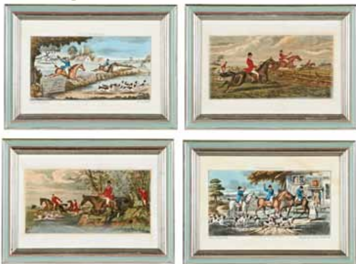
354 (four from a set of twelve)