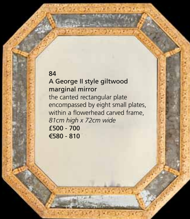
84 A George II style giltwood marginal mirror the canted rectangular plate encompassed by eight small plates, within a flowerhead carved frame, 81cm high x 72cm wide £500 - 700 €580 - 810