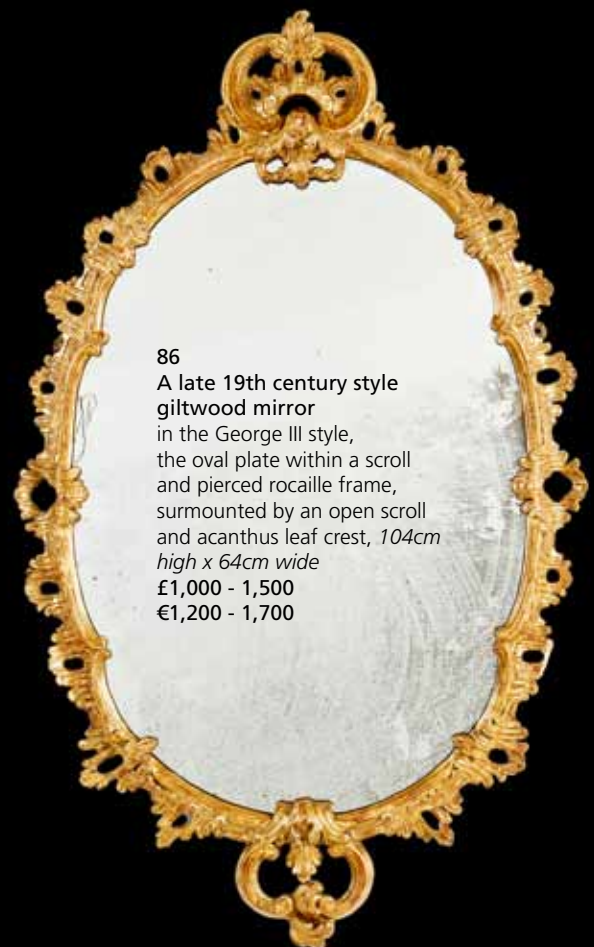
86 A late 19th century style giltwood mirror in the George III style, the oval plate within a scroll and pierced rocaille frame, surmounted by an open scroll and acanthus leaf crest, 104cm high x 64cm wide £1,000 - 1,500 €1,200 - 1,700