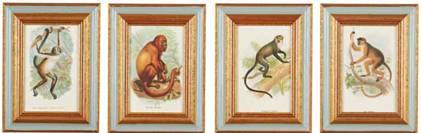
359 (four from a set of sixteen)