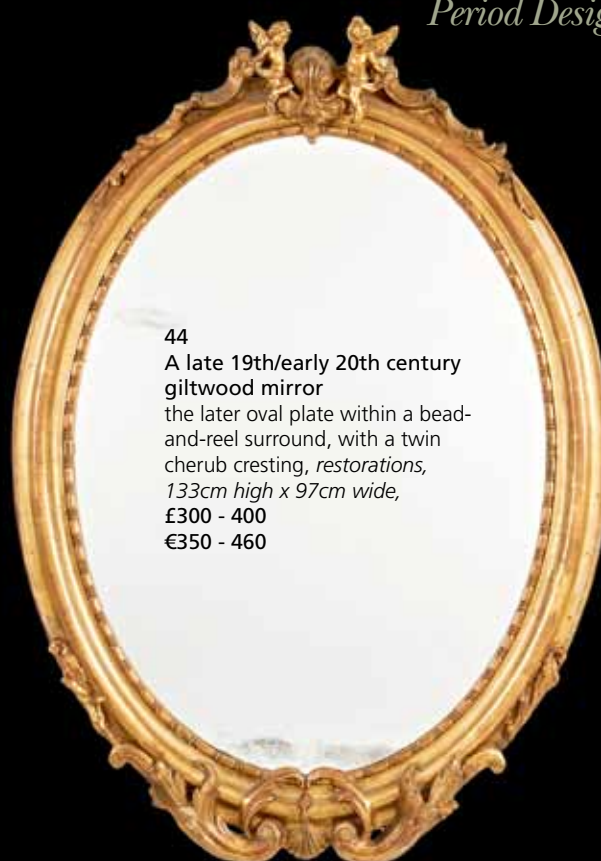
44 A late 19th/early 20th century giltwood mirror the later oval plate within a bead- and-reel surround, with a twin cherub cresting, restorations, 133cm high x 97cm wide, £300 - 400 €350 - 460