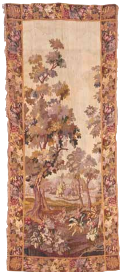
194 (one from a pair)