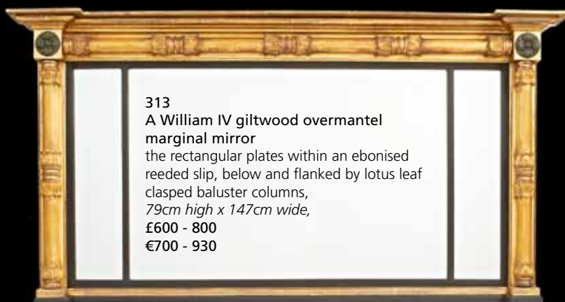
313 A William IV giltwood overmantel marginal mirror the rectangular plates within an ebonised reeded slip, below and flanked by lotus leaf clasped baluster columns, 79cm high x 147cm wide, £600 - 800 €700 - 930