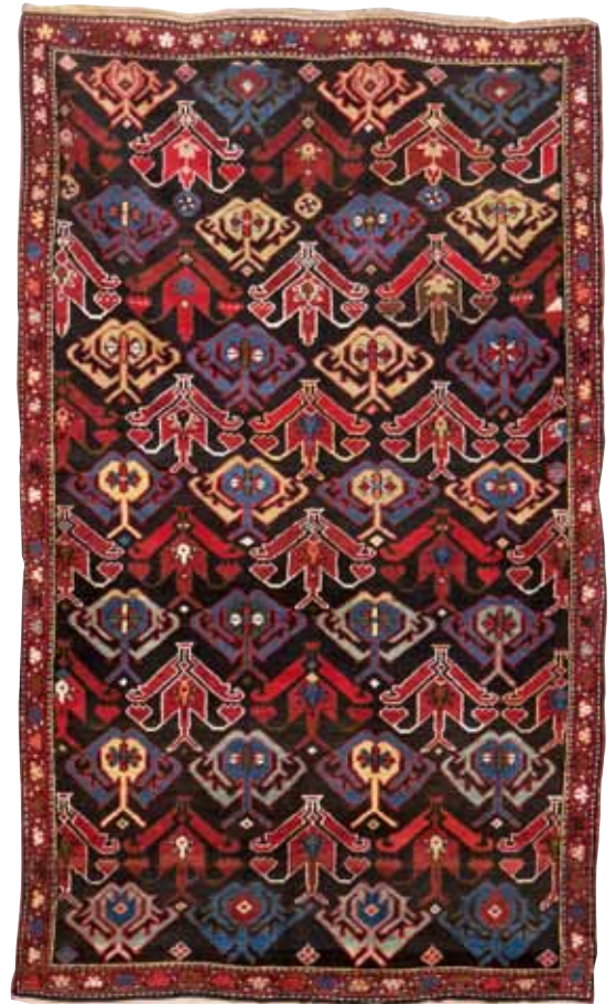
69 A silk Kashan rug, Central Persia, 203cm x 133cm £2,000 - 3,000 €2,300 - 3,500