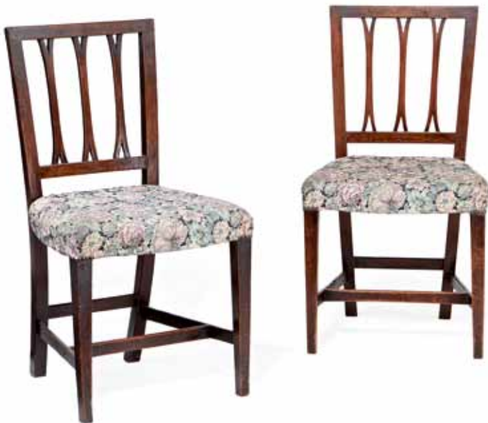
306 (two from a set of nine)