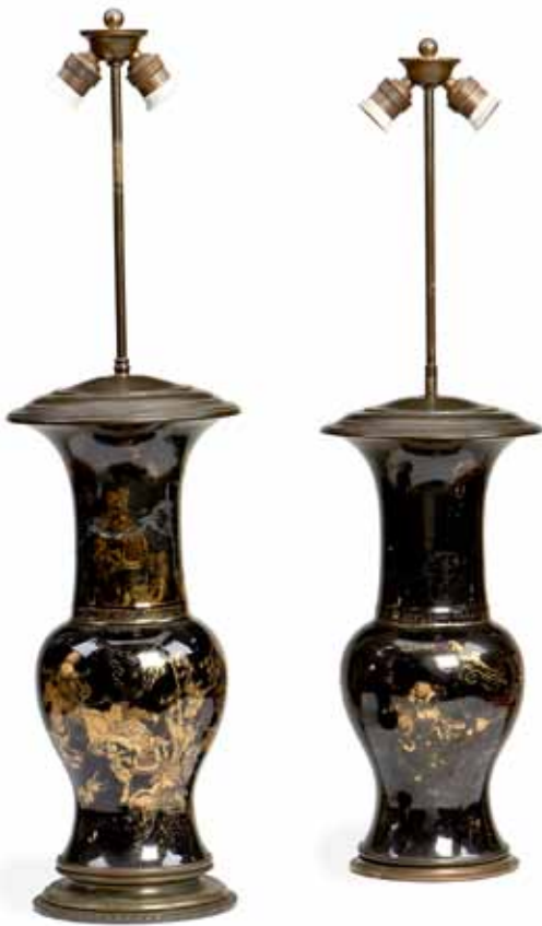
134 (two from a lot of four)