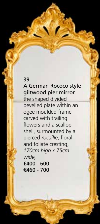
39 A German Rococo style giltwood pier mirror the shaped divided bevelled plate within an ogee moulded frame carved with trailing flowers and a scallop shell, surmounted by a pierced rocaille , floral and foliate cresting, 170cm high x 75cm wide, £400 - 600 €460 - 700