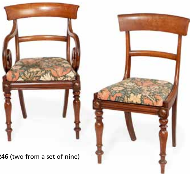
246 (two from a set of nine)