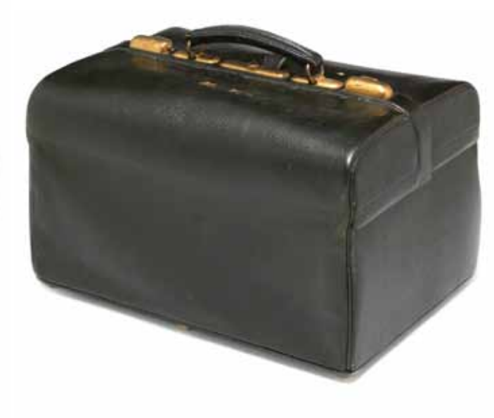
34 (two views)