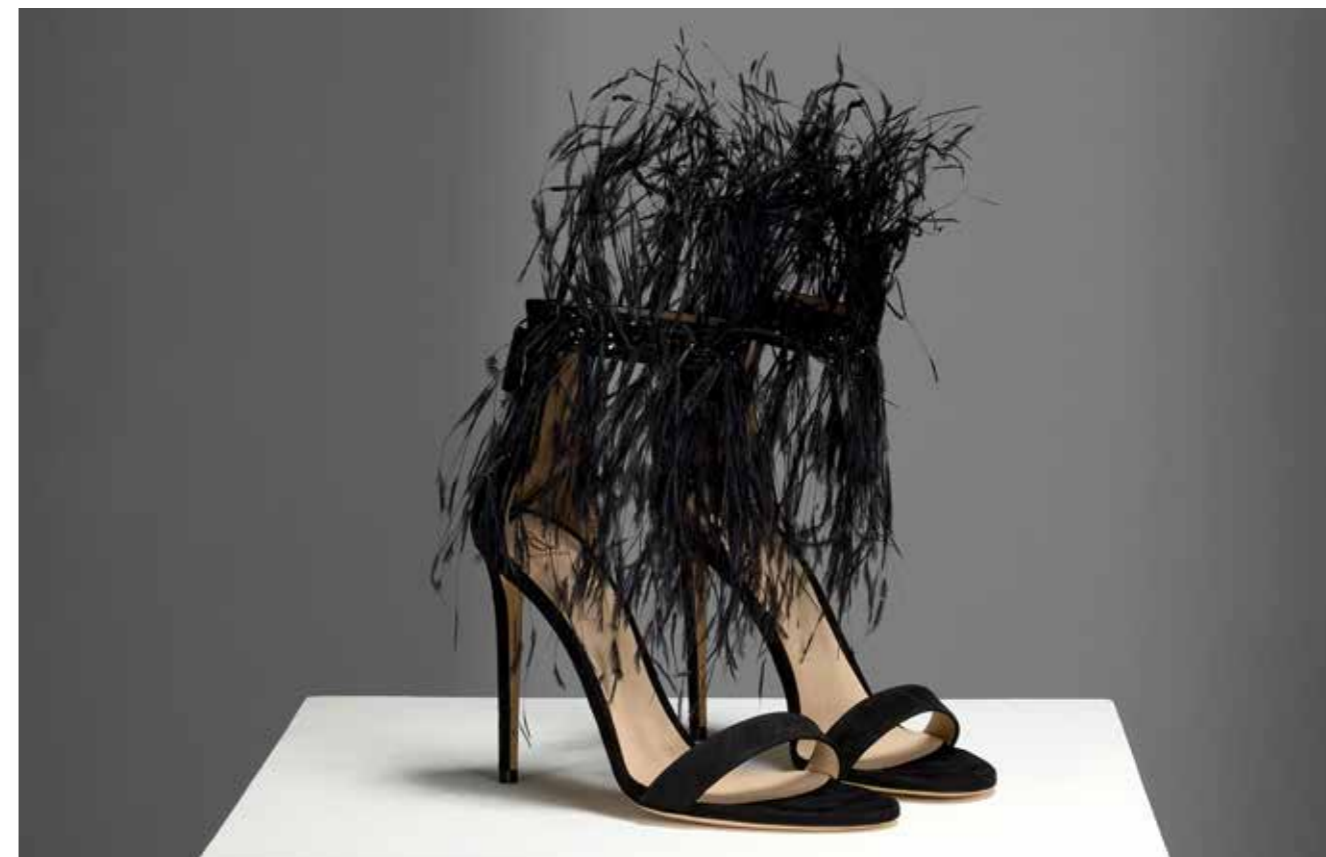
45 † RALPH & RUSSO READY-TO-WEAR: BLACK EMBROIDERED SUEDE FEATHER SANDALS Stiletto heel in suede adorned with hand-stitched crystals, and decorated with ostrich feathers fanning out from the ankle, with round toe and hidden padded insoles Labelled size 39.5, 11.5cm heel height, includes dust bags and box £350 - 450 US$470 - 600 AED1,700 - 2,200 To be sold without reserve Original RRP incl. VAT £1,195

THIS LOT MAY BE SUBJECT TO EXPORT/IMPORT RESTRICTIONS. PLEASE CONTACT THE DEPARTMENT FOR FURTHER DETAILS.