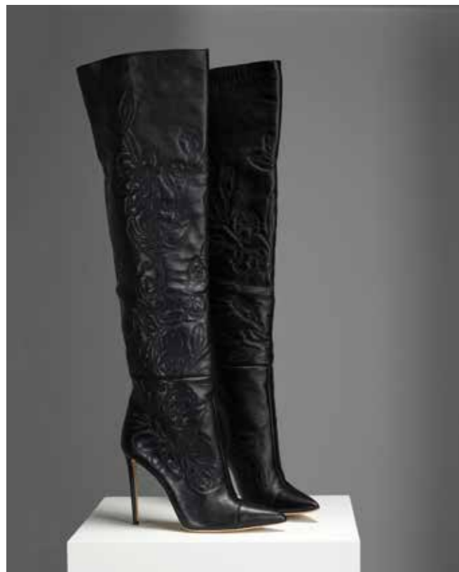
44 † RALPH & RUSSO SAMPLE: BLACK EMBOSSED LEATHER OVER-THE-KNEE HEELED BOOTS In floral-patterned embossed calf leather with a sharp pointed toe and slender stiletto Labelled size 41, 12cm heel height, includes dust bags £400 - 600 US$530 - 800 AED2,000 - 3,000 To be sold without reserve Original RRP incl. VAT £1,200