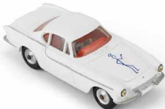
Lot 15 (part lot)