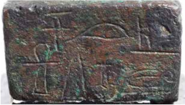
detail lot 116