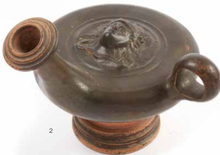
2 GRAND GUTTUS, TERRE CUITE VERNISSÉE NOIR, MAGNA GRECIA, CIRCA IVE - IIIE S. AV. J.-C.

A LARGE SOUTH ITALIAN BLACK GLAZED GUTTUS, CIRCA LATE 4TH-EARLY 3RD CENTURY B.C., the discus moulded with the head of Minerva, wearing a winged helmet, 14cm high, 17cm wide, 18cm deep