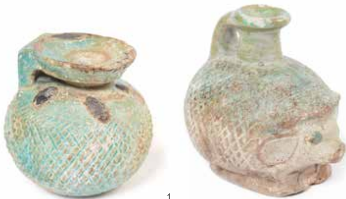
1 ARYBALLE PLASTIQUE EN FORME DE HÉRISSON ET UN ARYBALLE, FAÏENCE SILICEUSE, RHODIENNE, CIRCA VIE S. AV. J.-C.

A RHODIAN FAÏENCE HEDGEHOG ARYBALLOS AND A RHODIAN FAÏENCE ARYBALLOS, CIRCA 6TH CENTURY B.C., the hedgehog with spines incised, with pointed snout, black slip disk eyes and broad ears, the aryballos with cross-hatched body, and black glazed petals radiating around the shoulder, with lotus flower base, hedgehog : 6.5cm high, 4.5cm wide, 7cm deep; aryballos : 5.2cm high, 4.5cm diam. (2)