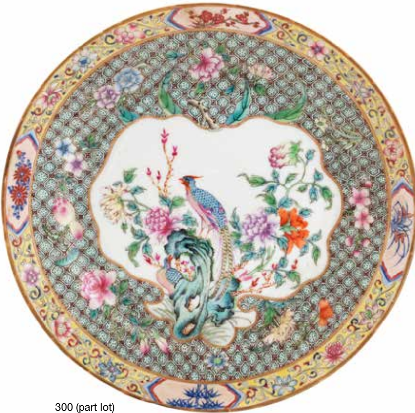
300 (part lot)