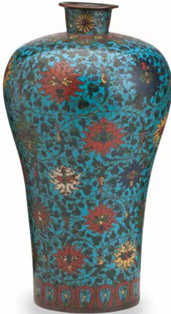
215 (part lot)