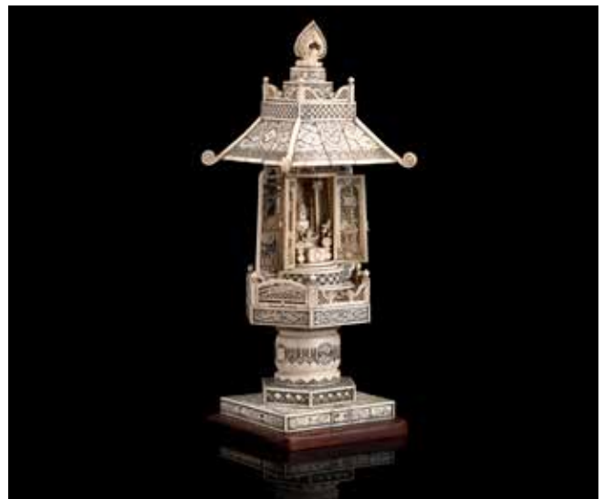
21 (part lot)