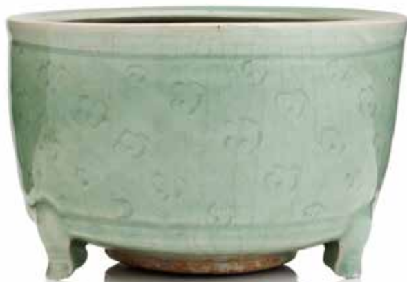
318 (part lot)