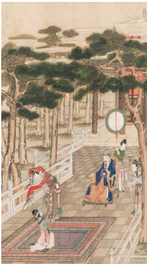
335 (part lot)