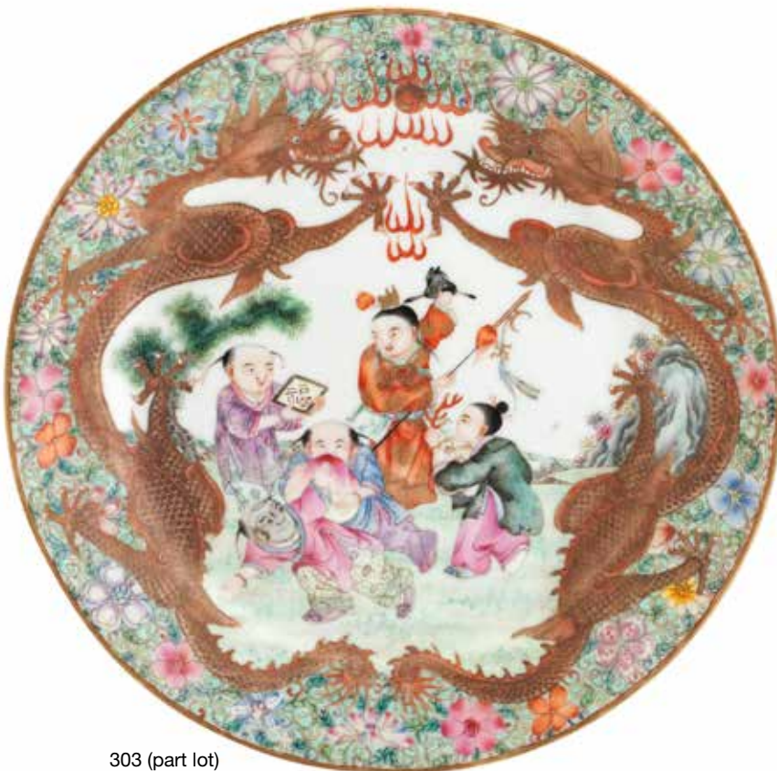
303 (part lot)