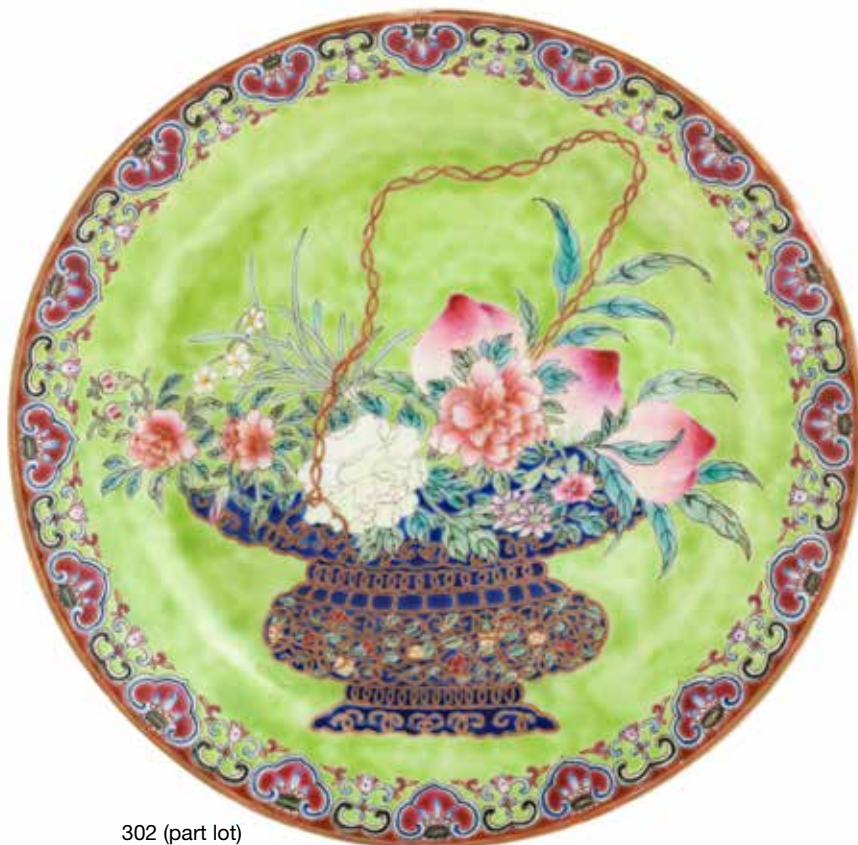
302 (part lot)