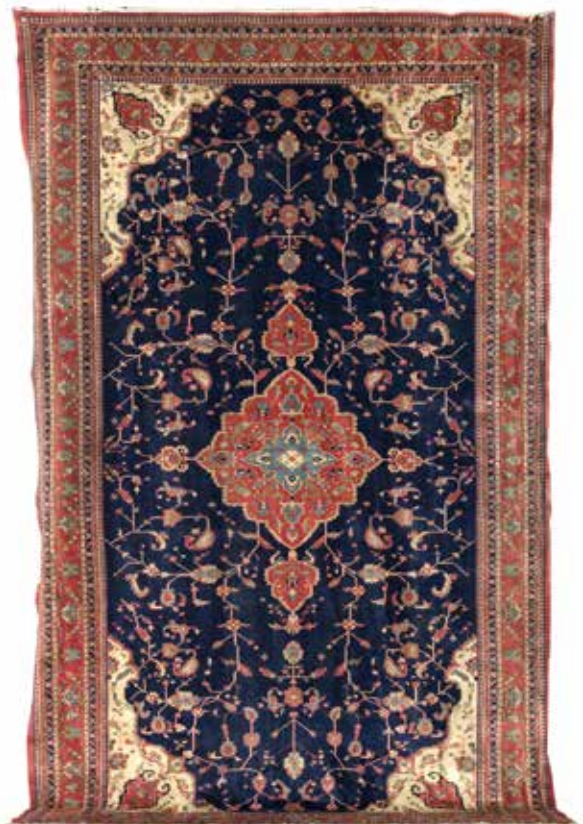
662 A large Sparta carpet, West Anatolia, 730cm x 435cm £500 - 700