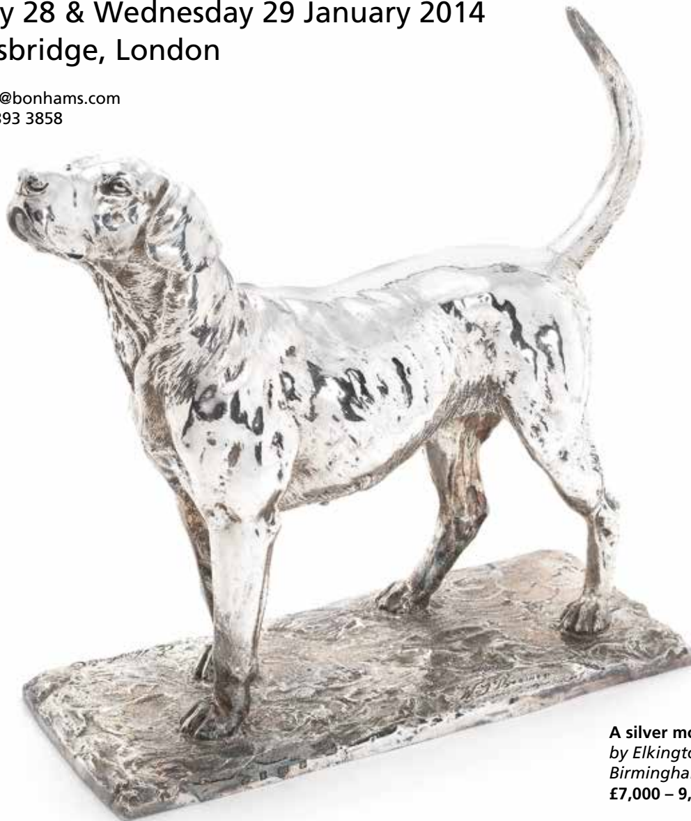
A silver model of a fox hound by Elkington & Co, Birmingham 1910. £7,000 – 9,000

lucy.gregory@bonhams.com +44 (0) 207 393 3858